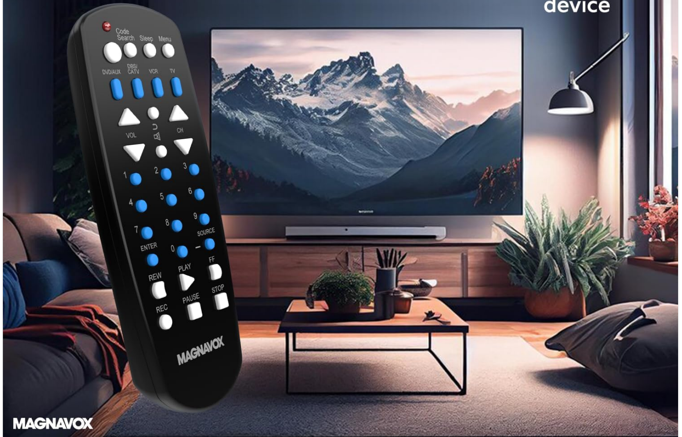
Image: The Magnavox MC345 remote control shown in a home environment, illustrating its capability to operate various devices such as TVs, DVD players, VCRs, and auxiliary devices.