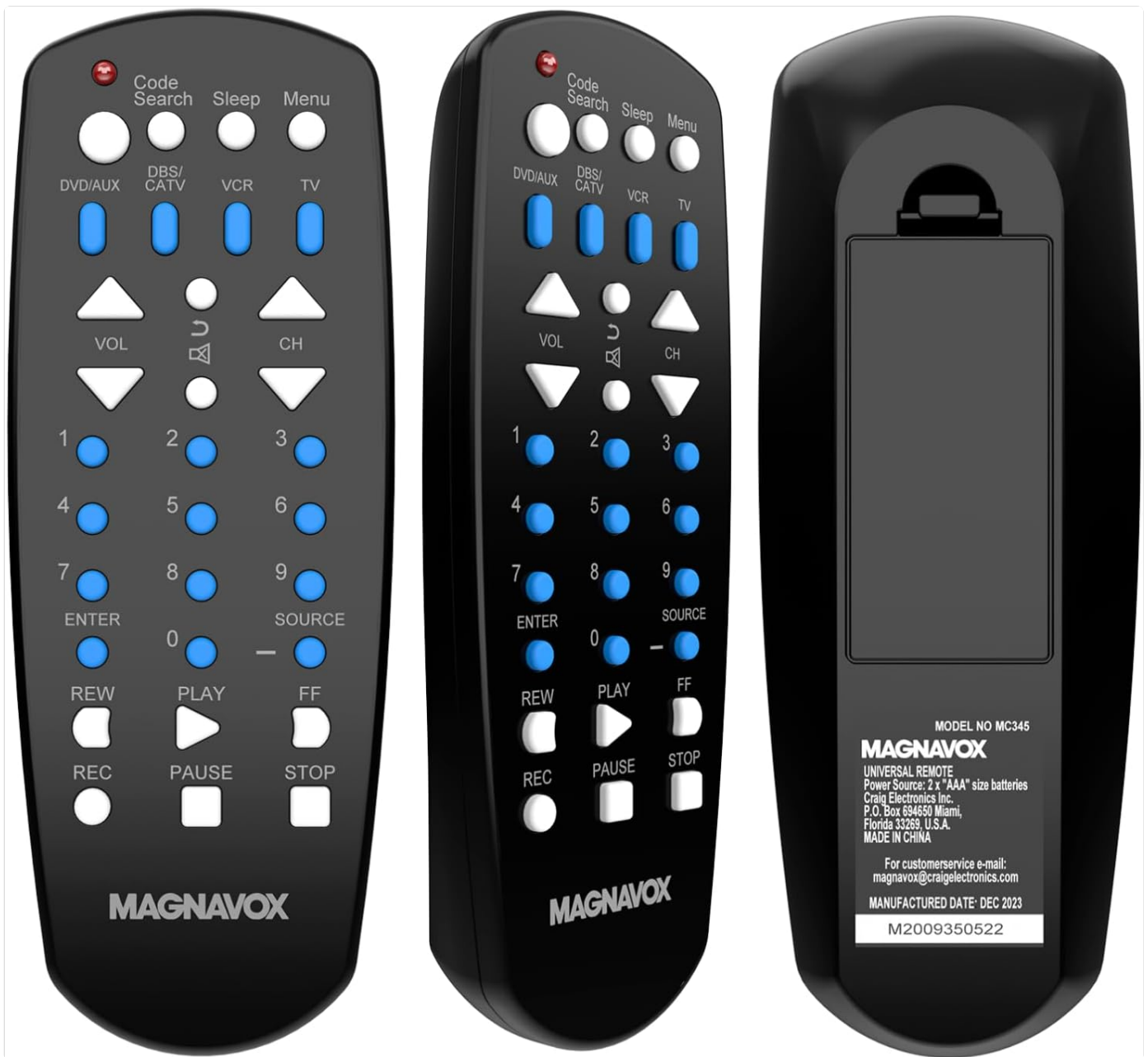
Image: Front, side, and back views of the Magnavox MC345 Universal Remote Control, highlighting its sleek black design and button layout.