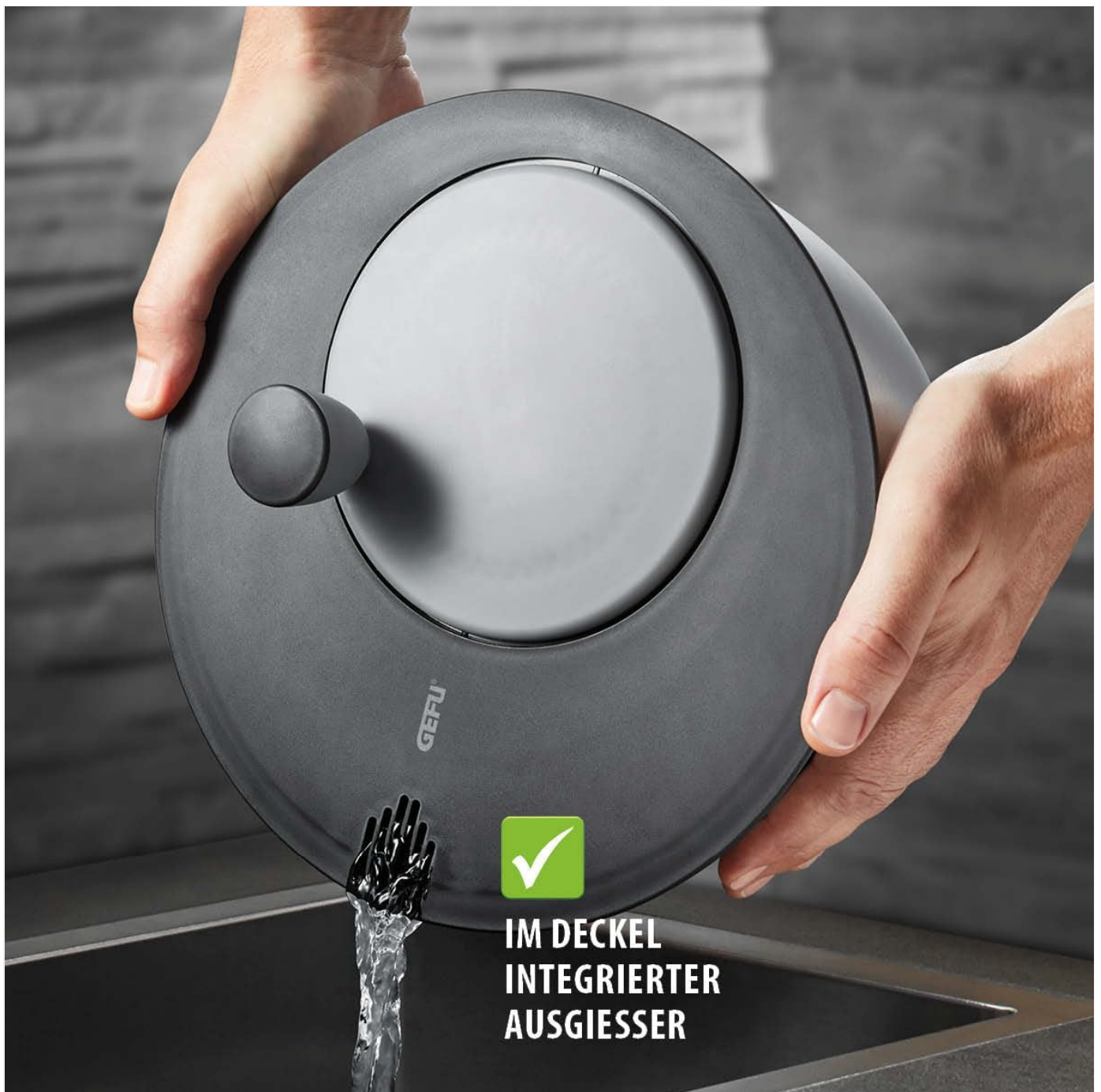
Image: Demonstrates the integrated pourer on the lid, allowing for convenient draining of water without removing the lid.

Serving Suggestion: The stainless steel bowl can also be used directly for serving your freshly dried salad. For this, simply remove the inner basket and lid.