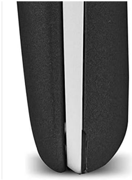
A side view of the Doro 2424, illustrating the 3.5mm headphone jack at the top and the volume up/down buttons on the side. These controls allow for easy adjustment of call and media volume.