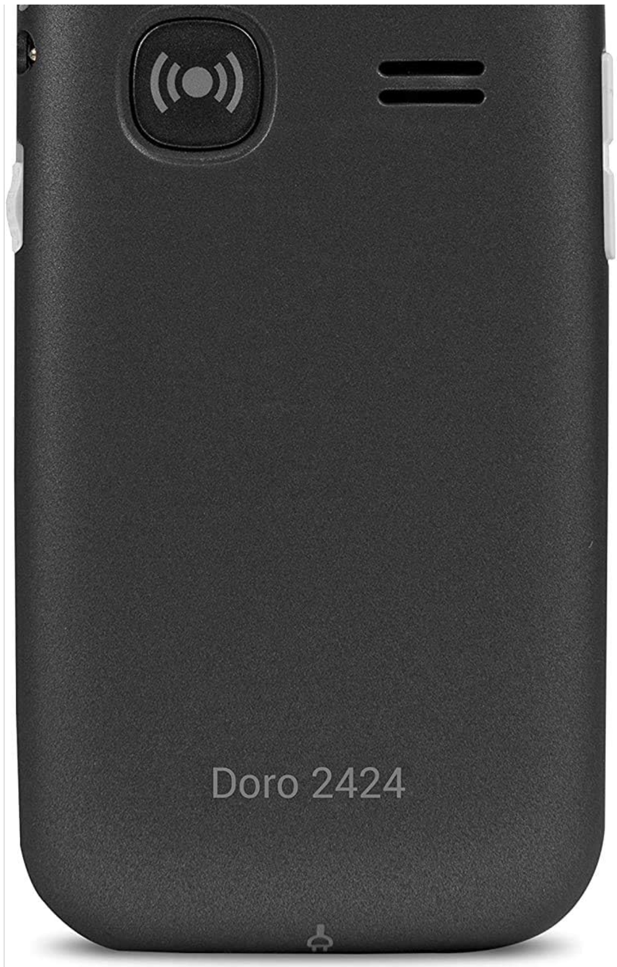
The rear view of the Doro 2424 phone. The prominent assistance button is located at the top, designed for quick access to emergency contacts. The Doro logo and model number are also visible.