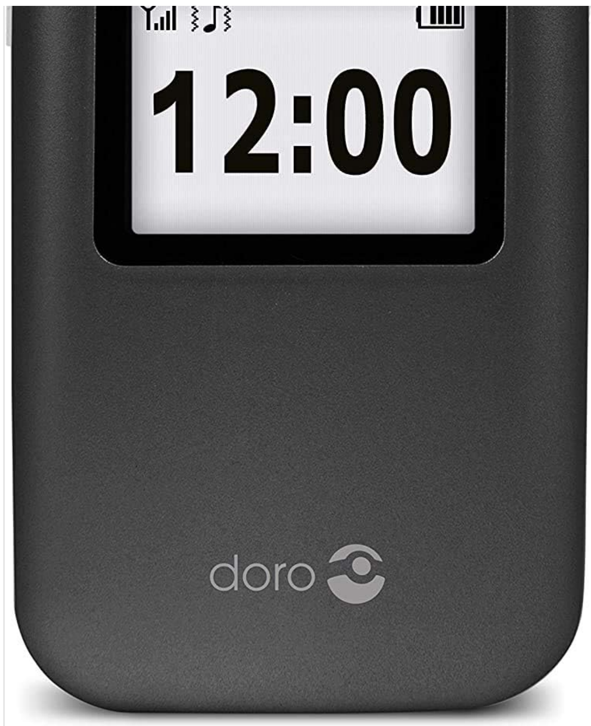
This image shows the Doro 2424 flip phone in its closed position. The external display is visible, indicating the current time, network signal strength, and battery level. The camera lens and flash are also visible above the display.