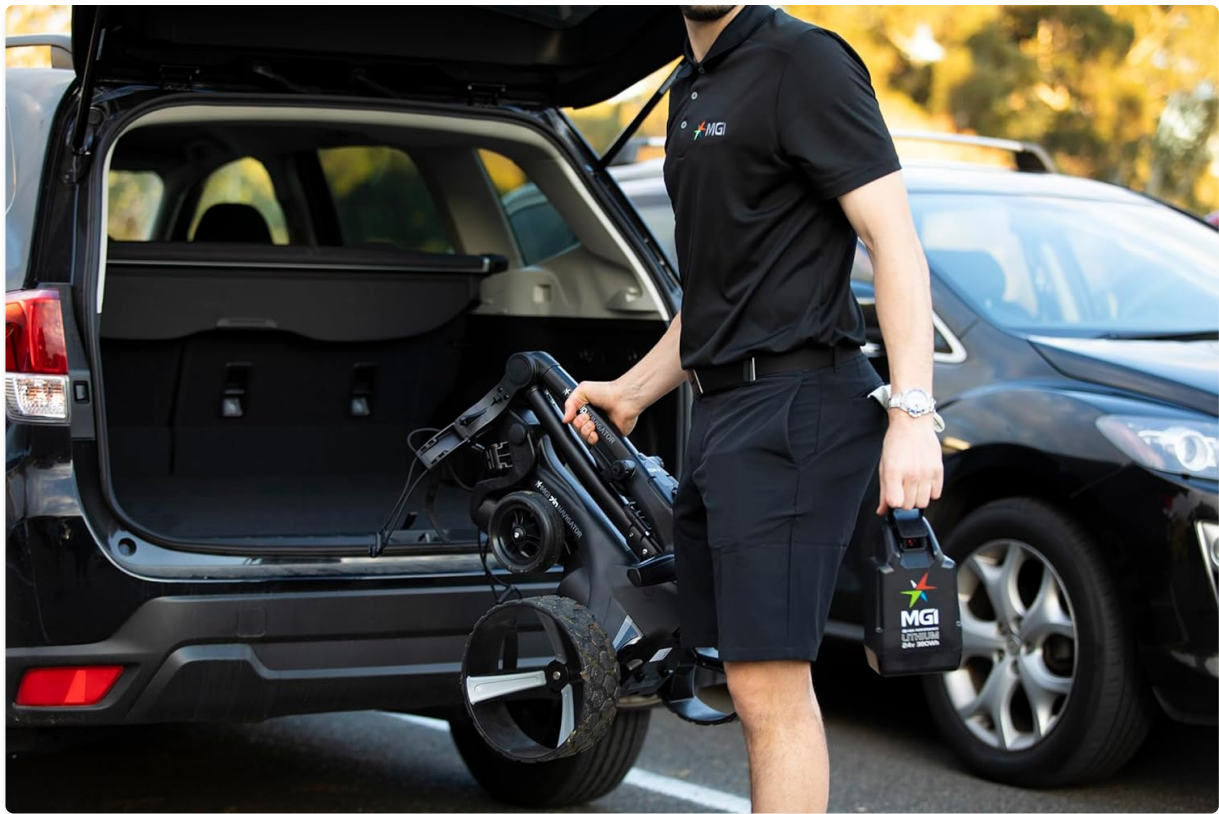
Figure 6: Battery Removal and Portability