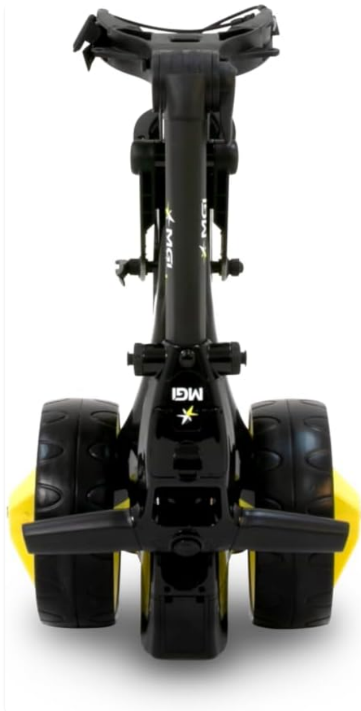
Figure 3: Rear Wheels and Anti-Tip Wheel Detail