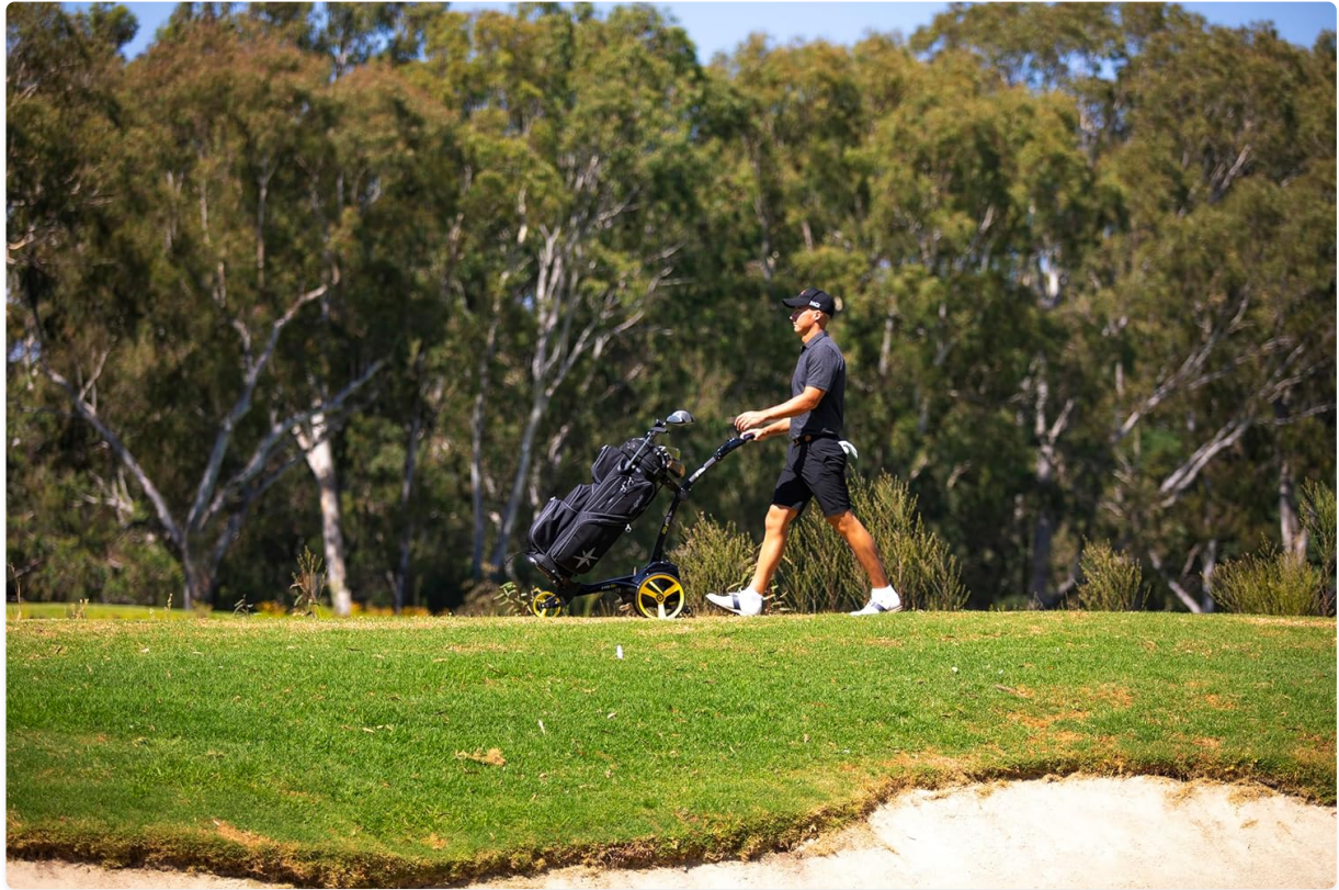
Figure 5: Cart Stability in Use

The integrated rear stabilizing wheel provides enhanced stability, especially when navigating inclines or uneven terrain. This feature significantly reduces the likelihood of the trolley tipping backward, ensuring your golf bag remains secure throughout your round.