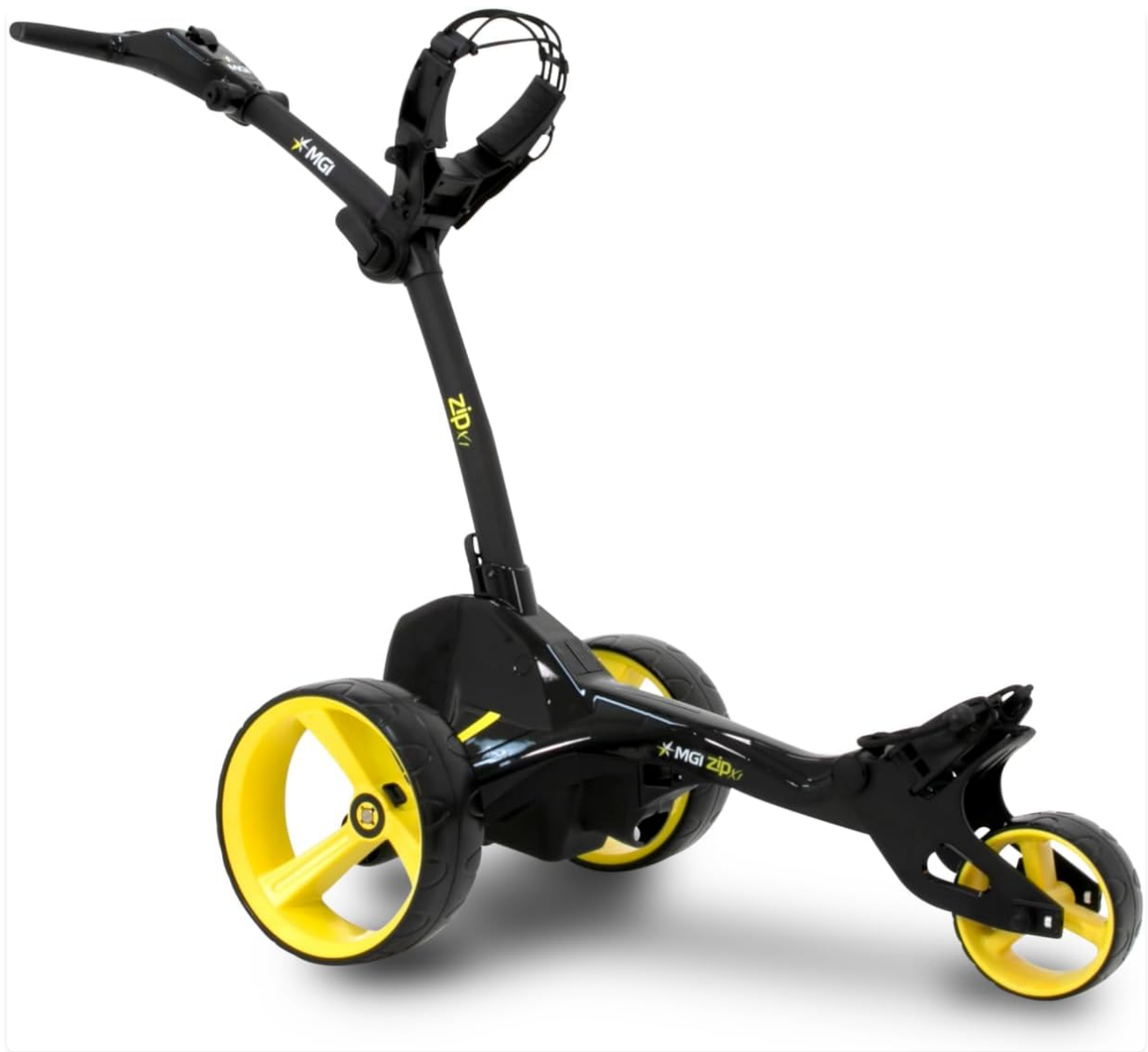
Figure 2: MGI Zip X1 in Unfolded Position