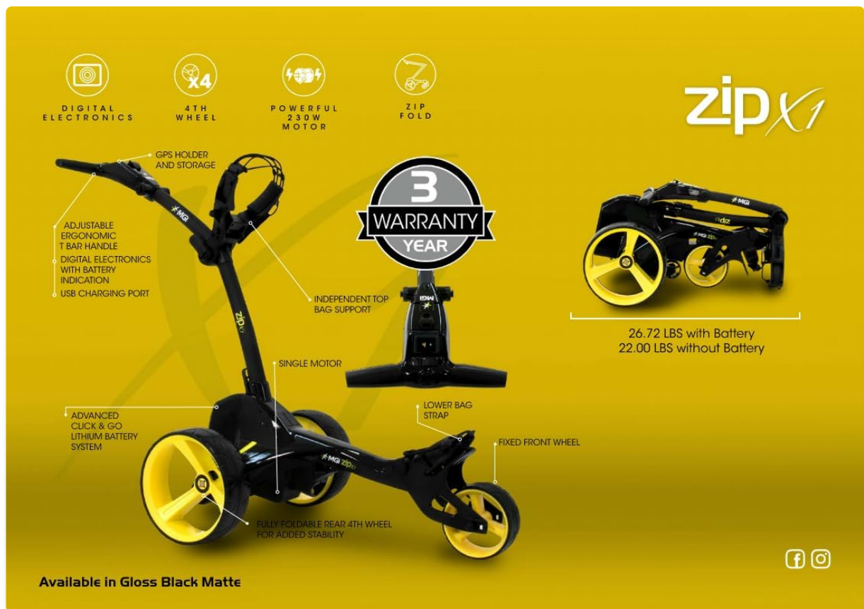
Figure 1: MGI Zip X1 Key Features Diagram