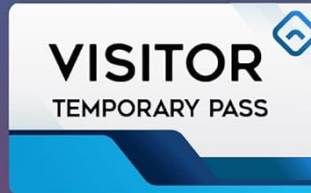
Visitor ID Cards