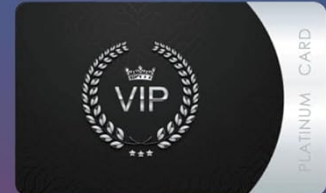
Membership ID Cards