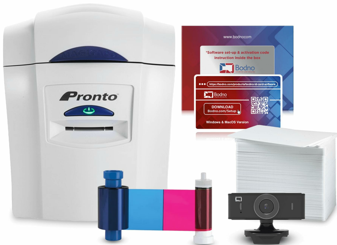
Image 1: The Bodno Magicard Pronto ID Card Printer, a compact and efficient device for creating custom ID cards.