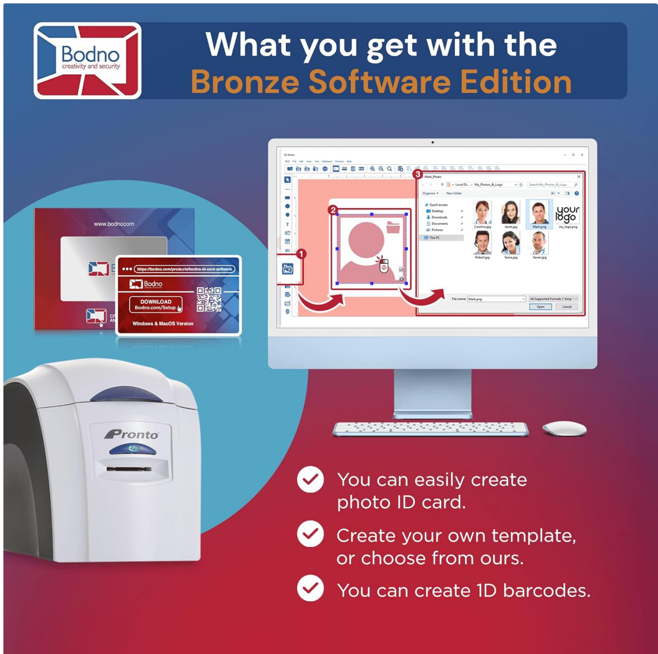
Image 3: The Bodno Magicard Pronto printer connected to a computer displaying the Bodno Bronze Edition software, highlighting its user-friendly interface for creating photo ID cards, templates, and 1D barcodes.

on-screen instructions to complete the installation. Use the provided one-time license and activation code during the setup process.