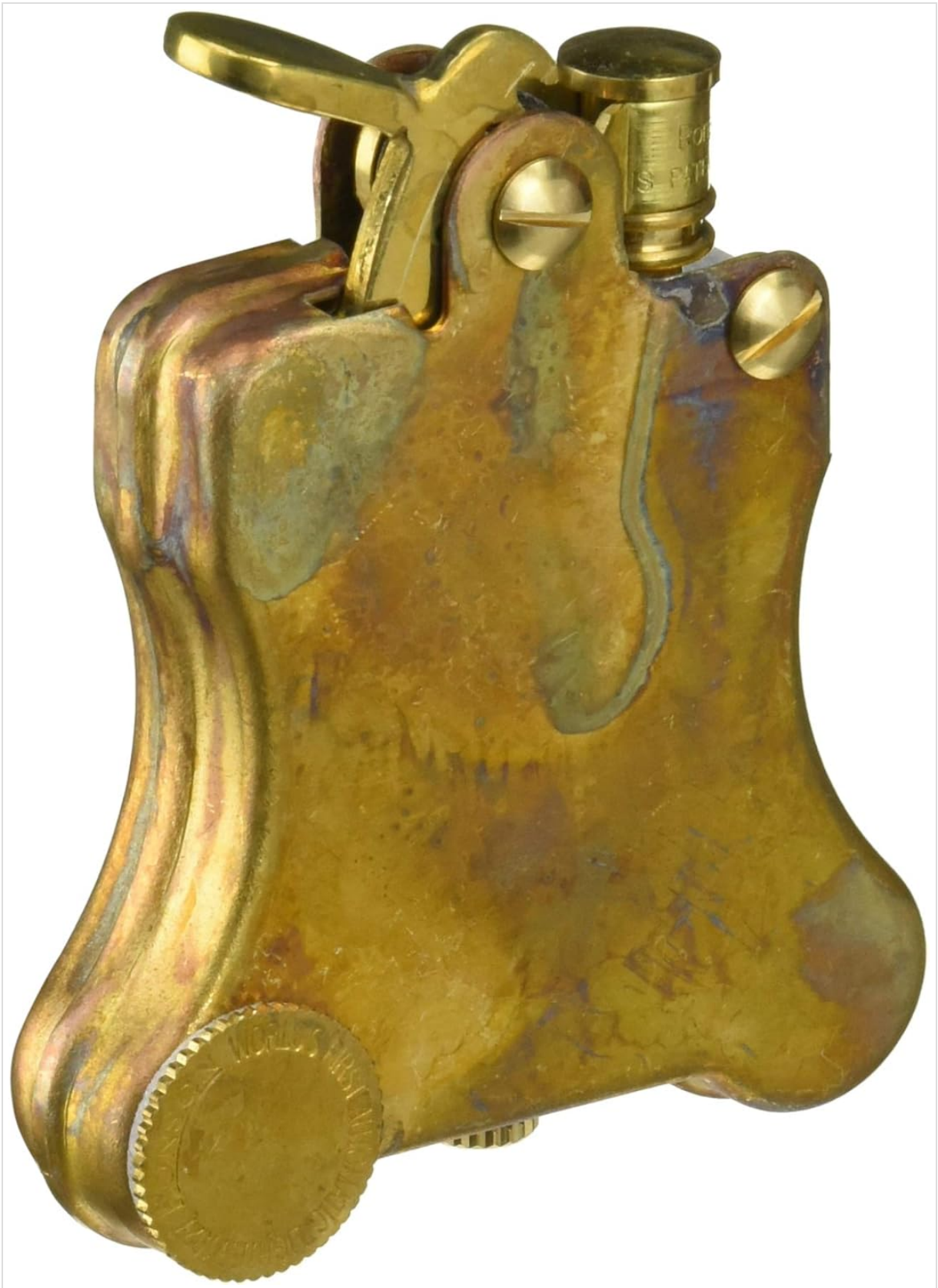
Figure 1: Front view of the Ronson Banjo Steampunk Design Oil Lighter, showcasing its unique brass finish and design elements.