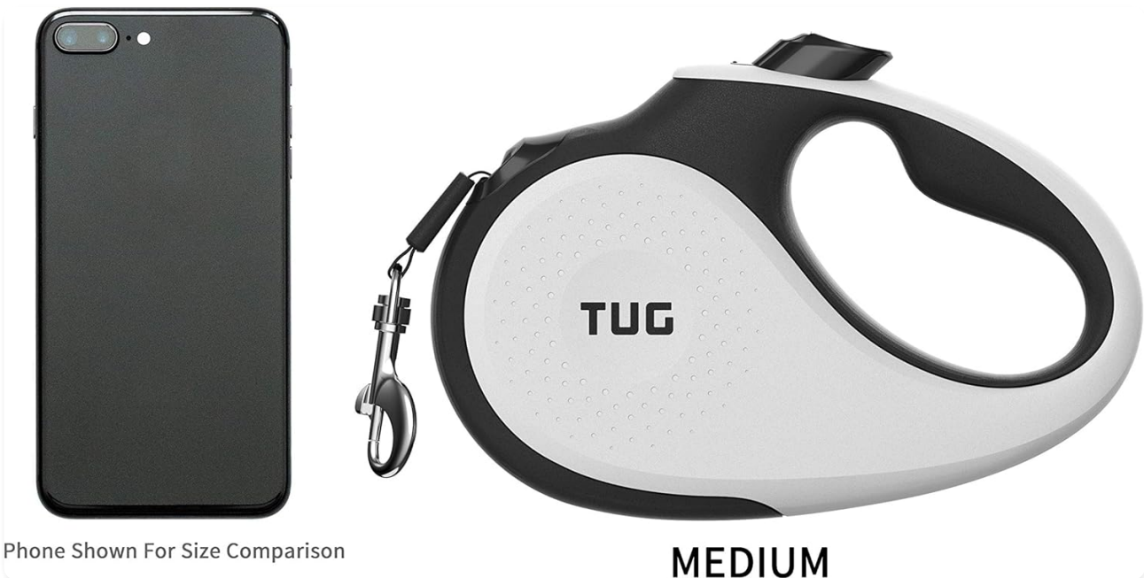
Phone Shown For Size Comparison