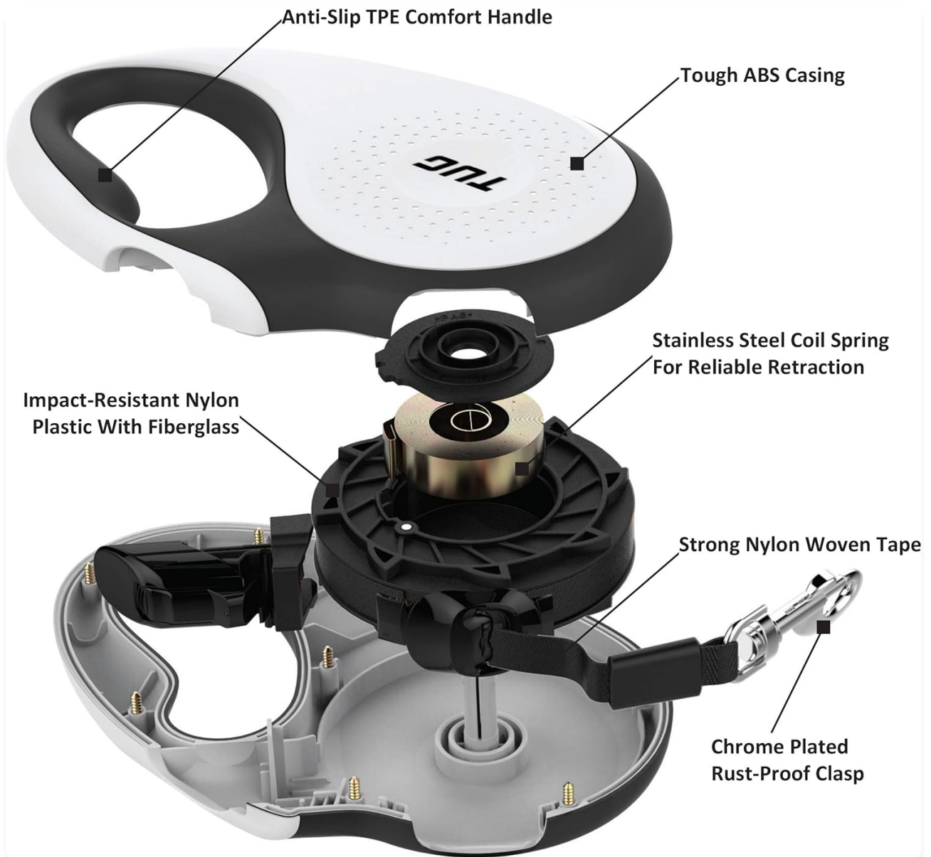
Image: Exploded view showing the internal components of the leash, including the anti-slip handle, ABS casing, stainless steel coil spring, impact-resistant nylon plastic with fiberglass, strong nylon woven tape, and chrome-plated rust-proof clasp.