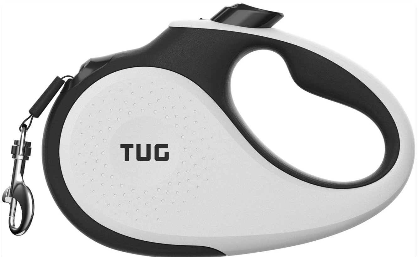
Image: The TUG 360° Tangle-Free Retractable Dog Leash, showcasing its ergonomic design in white and black.

Thank you for choosing the TUG 360° Tangle-Free Retractable Dog Leash. This manual provides essential information for the safe and effective use of your new leash. Designed for comfort and control, this leash features a 16 ft strong nylon tape, a one-handed brake, pause, and lock mechanism, and a 360-degree tangle-free inlet for a smooth walking experience.