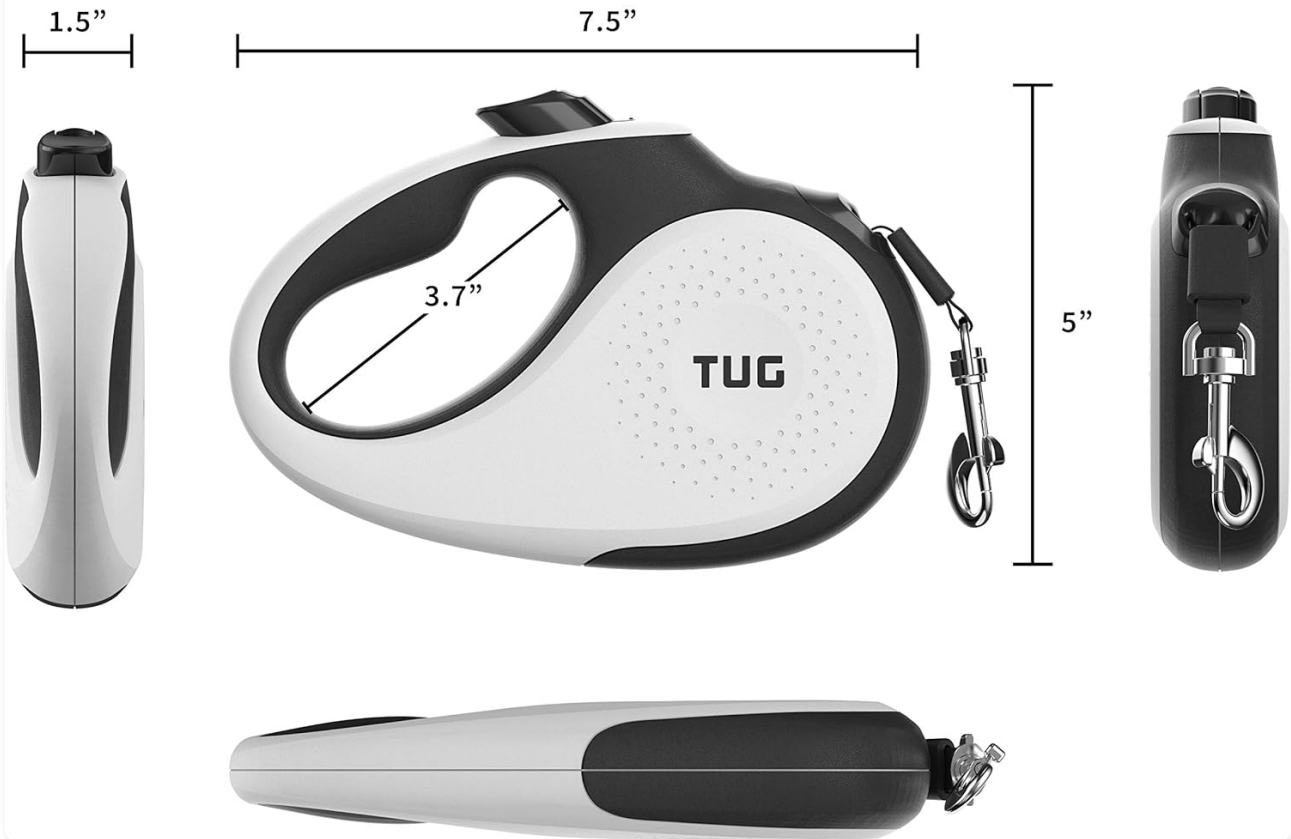
Image: Detailed dimensions of the Medium TUG Retractable Dog Leash, showing length, width, and height of the casing.