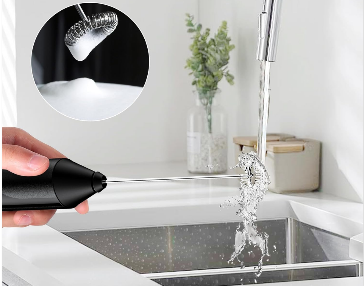
Image: A hand holding the frother with its whisk submerged in water, demonstrating the easy cleaning process by simply turning it on under running water.