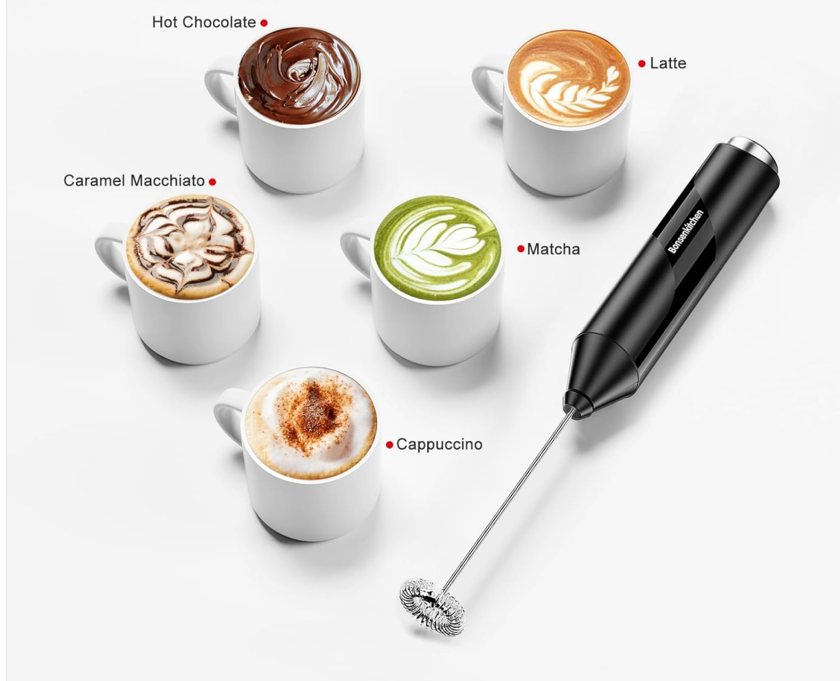
Image: Display of various beverages like Hot Chocolate, Caramel Macchiato, Latte, Matcha, and Cappuccino, indicating the frother's versatile use.