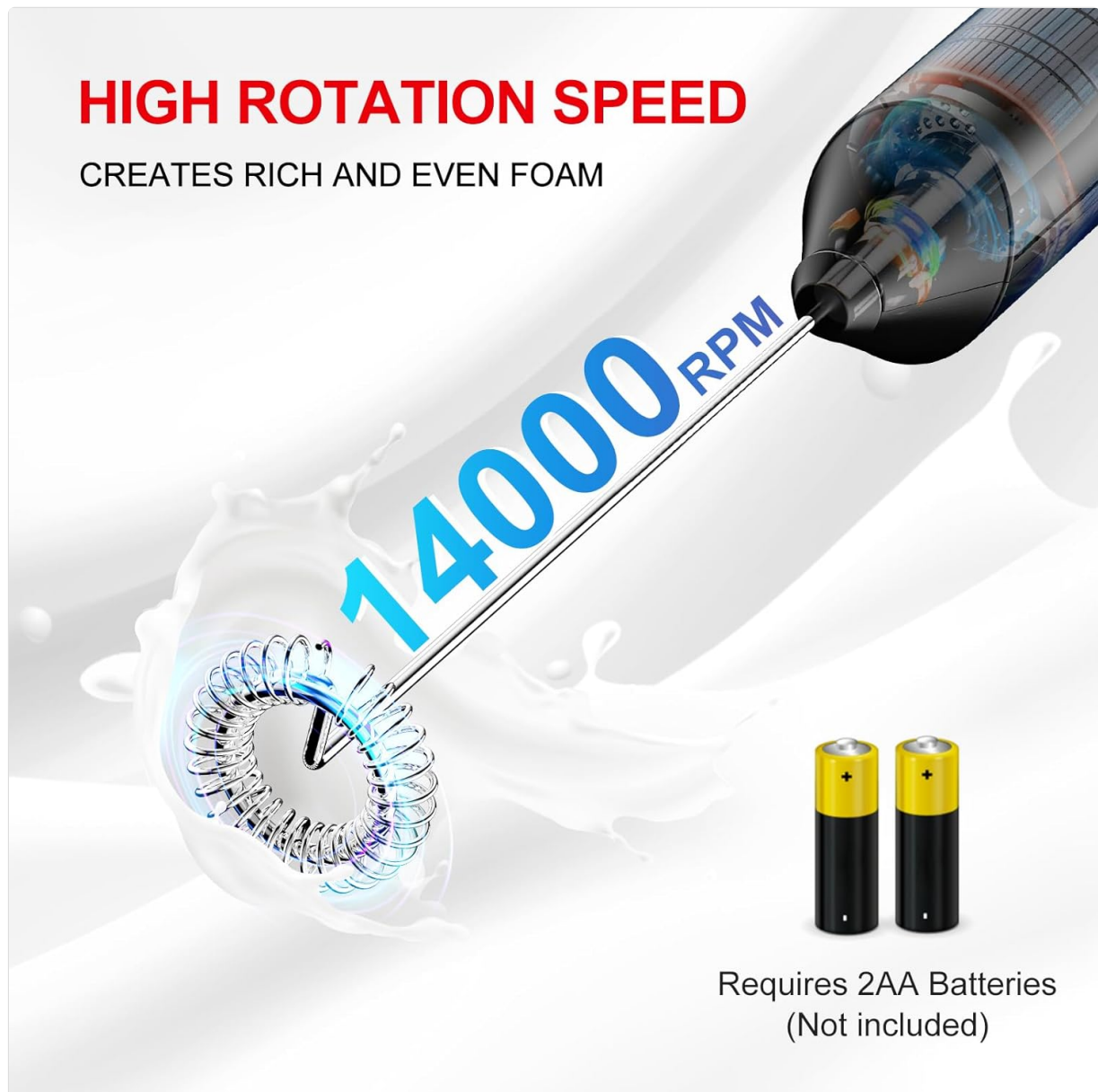
Image: Illustration highlighting the frother's 14000 RPM high rotation speed for creating rich and even foam, and indicating it requires 2 AA batteries (not included).