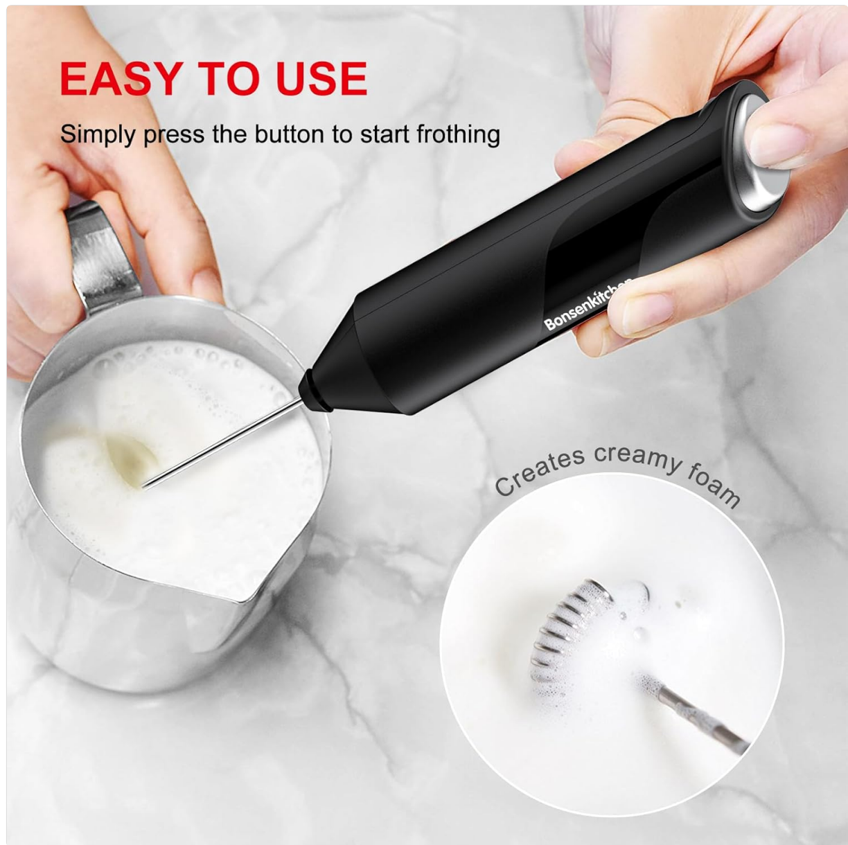
Image: A hand operating the Bonsenkitchen frother in a pitcher of milk, demonstrating how easy it is to press the button and create creamy foam.