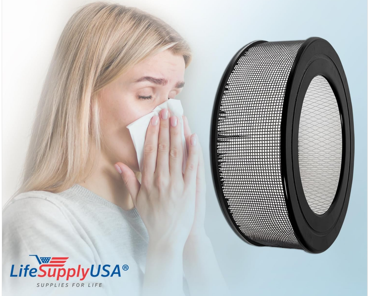
Image: This image highlights the filter's compatibility with Sears Kenmore 62500, 83236, and 83256 Air Purifiers.

Fully compatible with Sears Kenmore 62500, 83236, 83256 Air Purifier