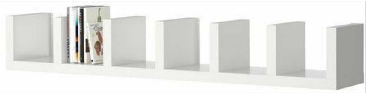
Image: The IKEA Lack Wall Shelf Unit installed horizontally, demonstrating its use for books and small items.