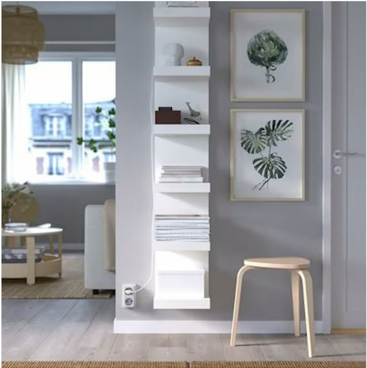
Image: The IKEA Lack Wall Shelf Unit installed vertically, showcasing its use for displaying decorative items and books.