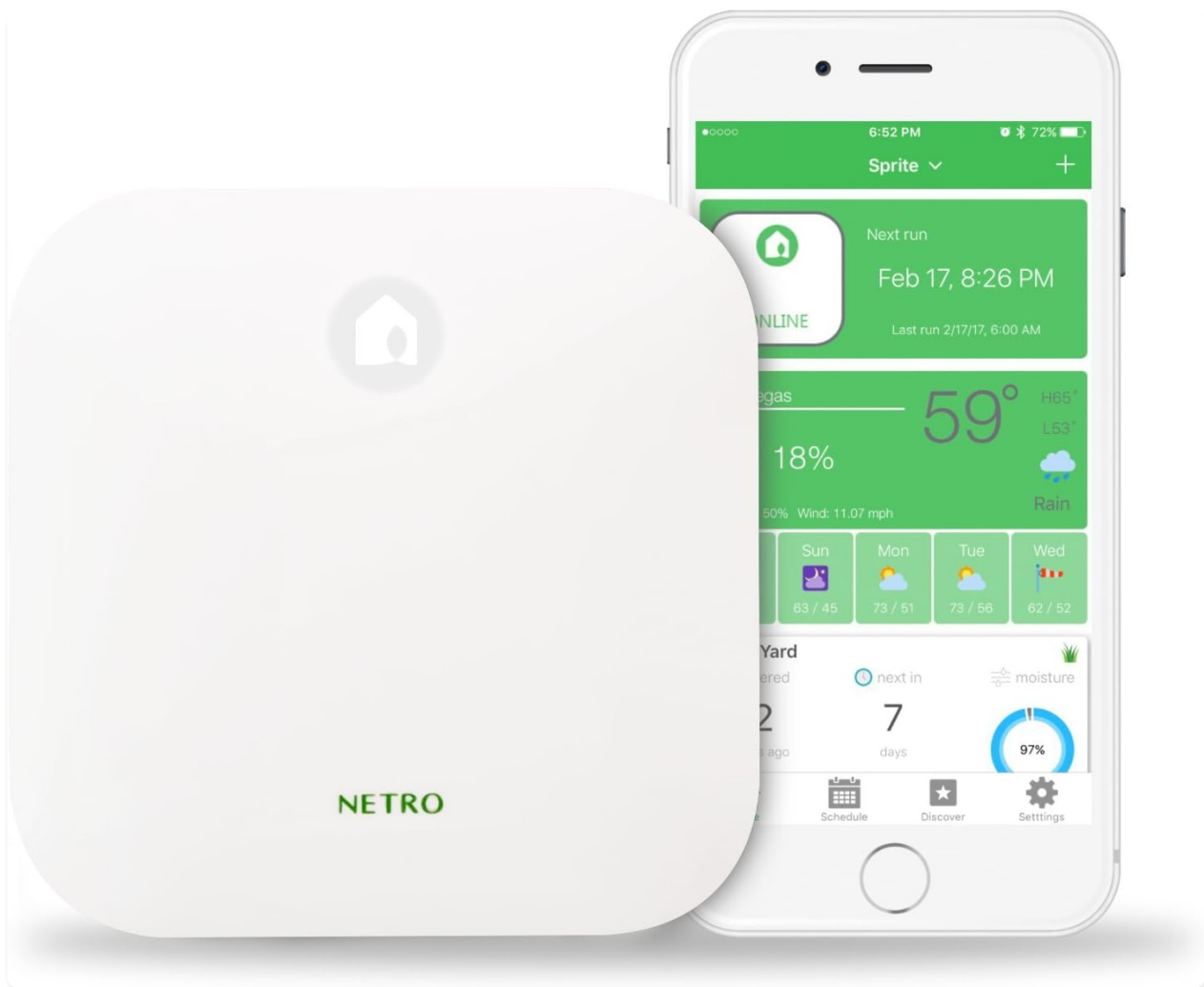
Image 1.1: Netro Smart Sprinkler Controller (Sprite-6) and its mobile application interface.