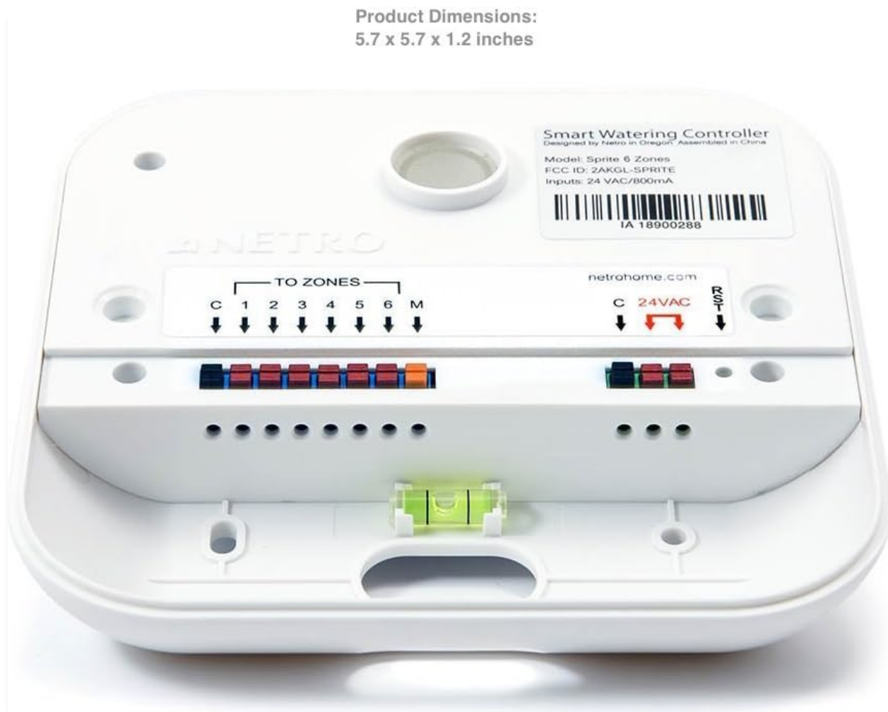
Image 4.1: Rear view of the Netro Sprite-6 controller, highlighting wiring terminals and the integrated bubble level for mounting.

The Netro Sprite-6 controller is designed for indoor use only. Select a suitable location near a power outlet and existing sprinkler wiring.