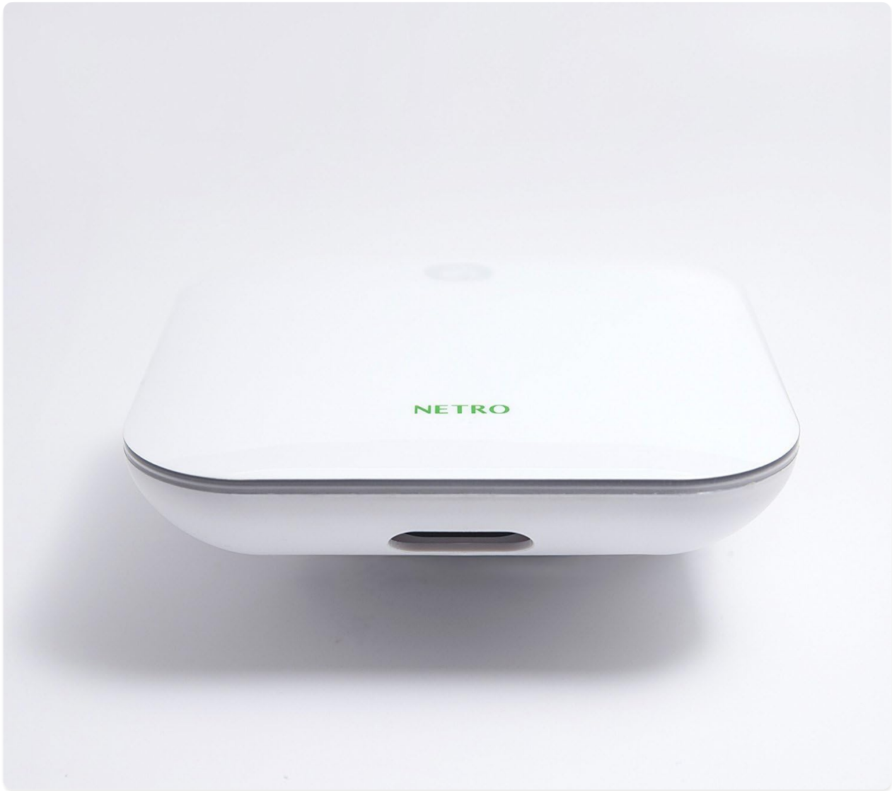
Image 5.1: Remote control of your irrigation system through the Netro app.

The Netro controller automatically creates and adjusts watering schedules based on local weather data and your zone's specific needs. You can monitor and adjust these schedules via the app.