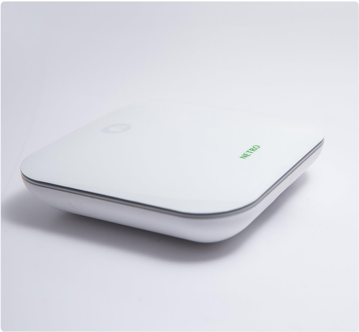
Image 5.2: Monitor your water usage and savings directly from the Netro app.