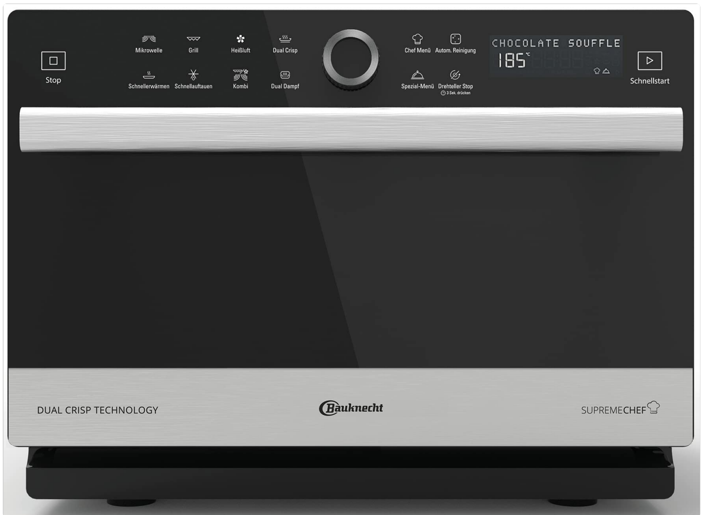
Front view of the Bauknecht Supreme Chef MW 3391 SX microwave oven.