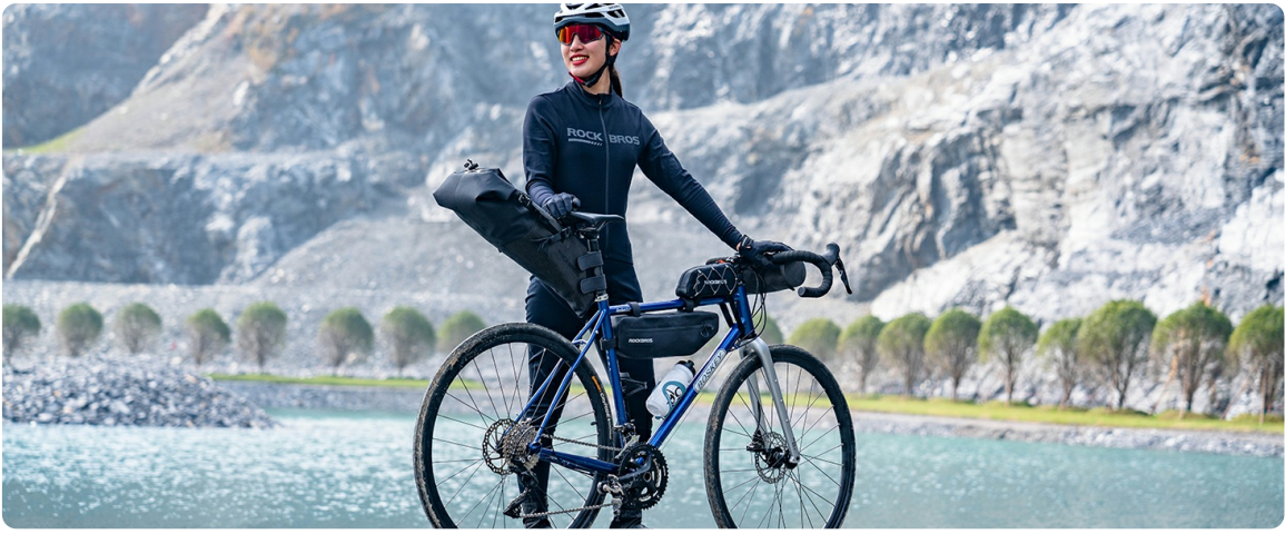
Figure 3.1: The bag's roll-top design allows for flexible capacity adjustment, from a compact size to its full 14L.