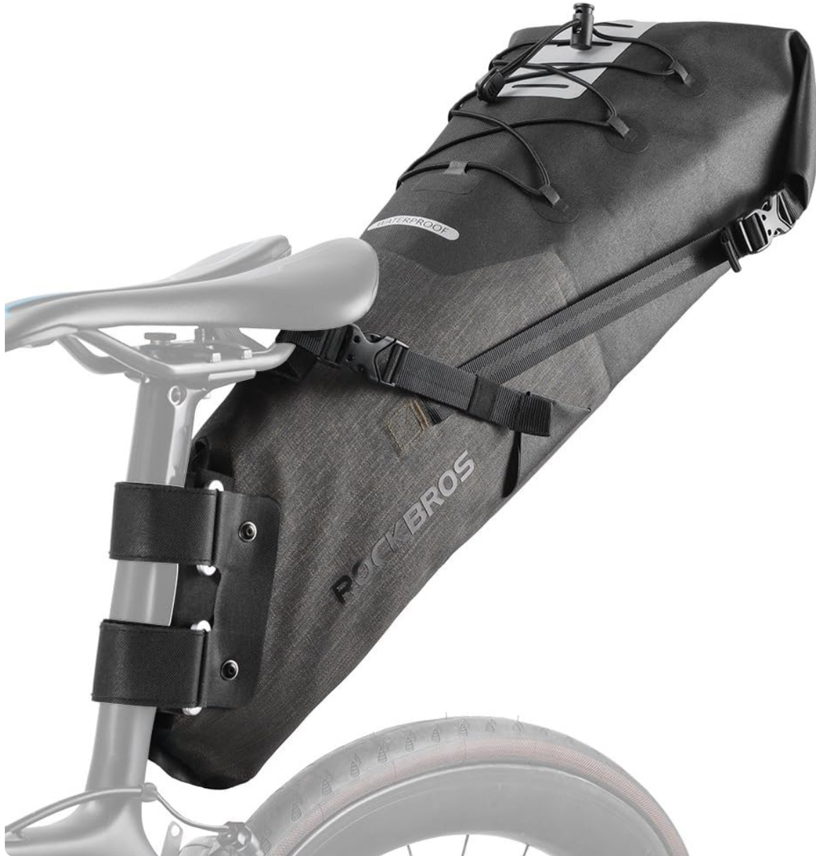
Figure 2.1: ROCKBROS Waterproof Bike Saddle Bag securely installed on a bicycle.