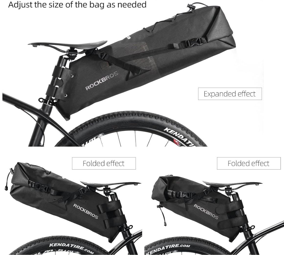
Figure 3.3: Key details include a reflective sign for night visibility and a dedicated loop for attaching a tail light.