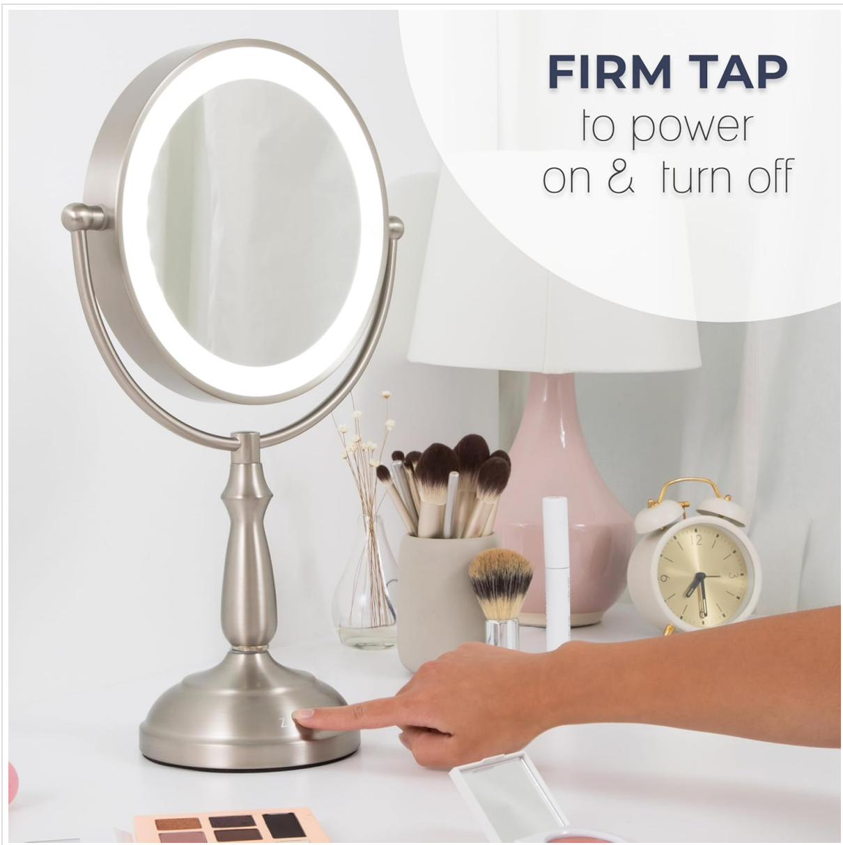
Figure 2: Tapping the base to power on/off.