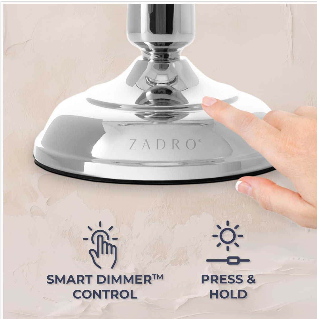
Figure 3: Smart Dimmer Control on the mirror base.