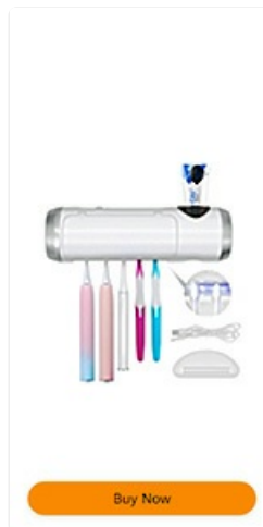
Image 8: The integrated toothpaste tube squeezer for convenient dispensing.

The unit includes a convenient slot for a toothpaste tube. This feature helps keep your countertop clear and provides easy access to toothpaste.