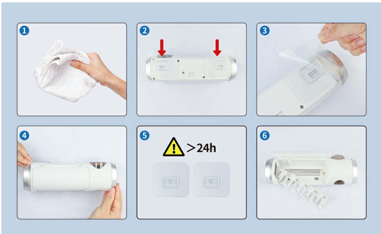
Image 6: The toothbrush holder actively sanitizes brushes using UV light.

The device features a 6-minute cleaning cycle that utilizes UV light to sanitize your toothbrushes. After the cleaning cycle, a built-in fan activates to dry the toothbrushes, preventing moisture buildup and odors. The unit will automatically stop after the 6-minute work cycle is complete.