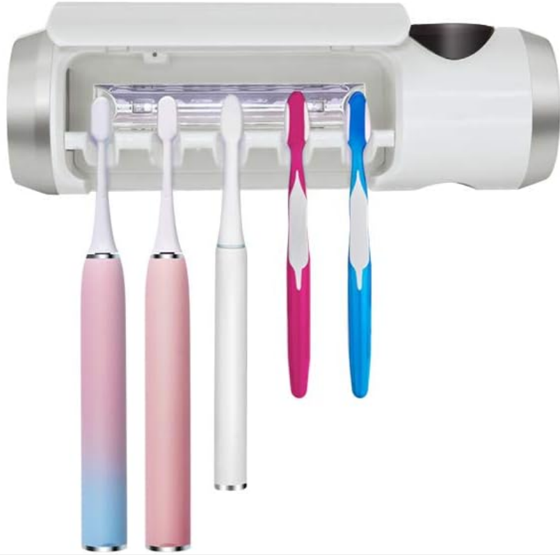
Image 4: The toothbrush holder provides five slots for various toothbrush types.