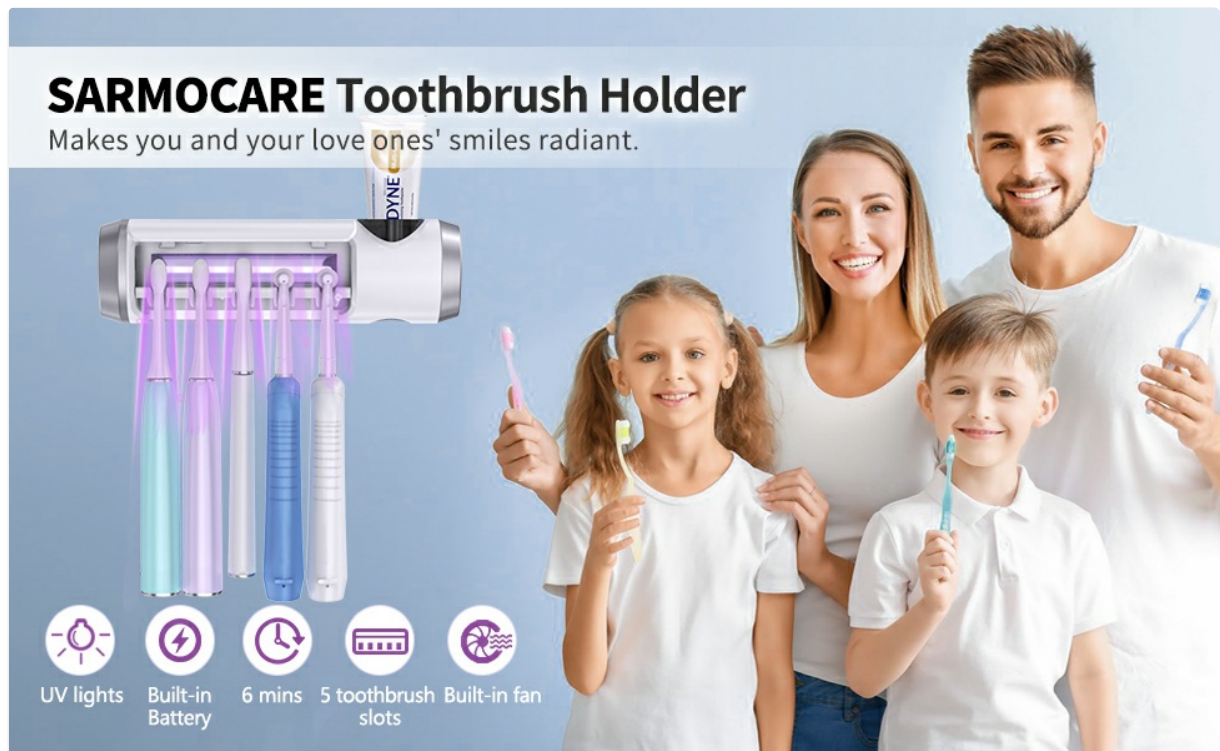
Image 1: The SARMOCARE Toothbrush Holder Cleaner mounted on a bathroom wall, providing organized storage for multiple toothbrushes.

The SARMOCARE B1001 Toothbrush Holder Cleaner is designed to provide a hygienic storage solution for your toothbrushes. It features a 6-minute UV cleaning cycle, fan drying, and accommodates up to 5 toothbrushes. This rechargeable, wall-mounted device is suitable for both sonic and manual toothbrushes, helping to keep your bathroom organized and your toothbrushes clean.