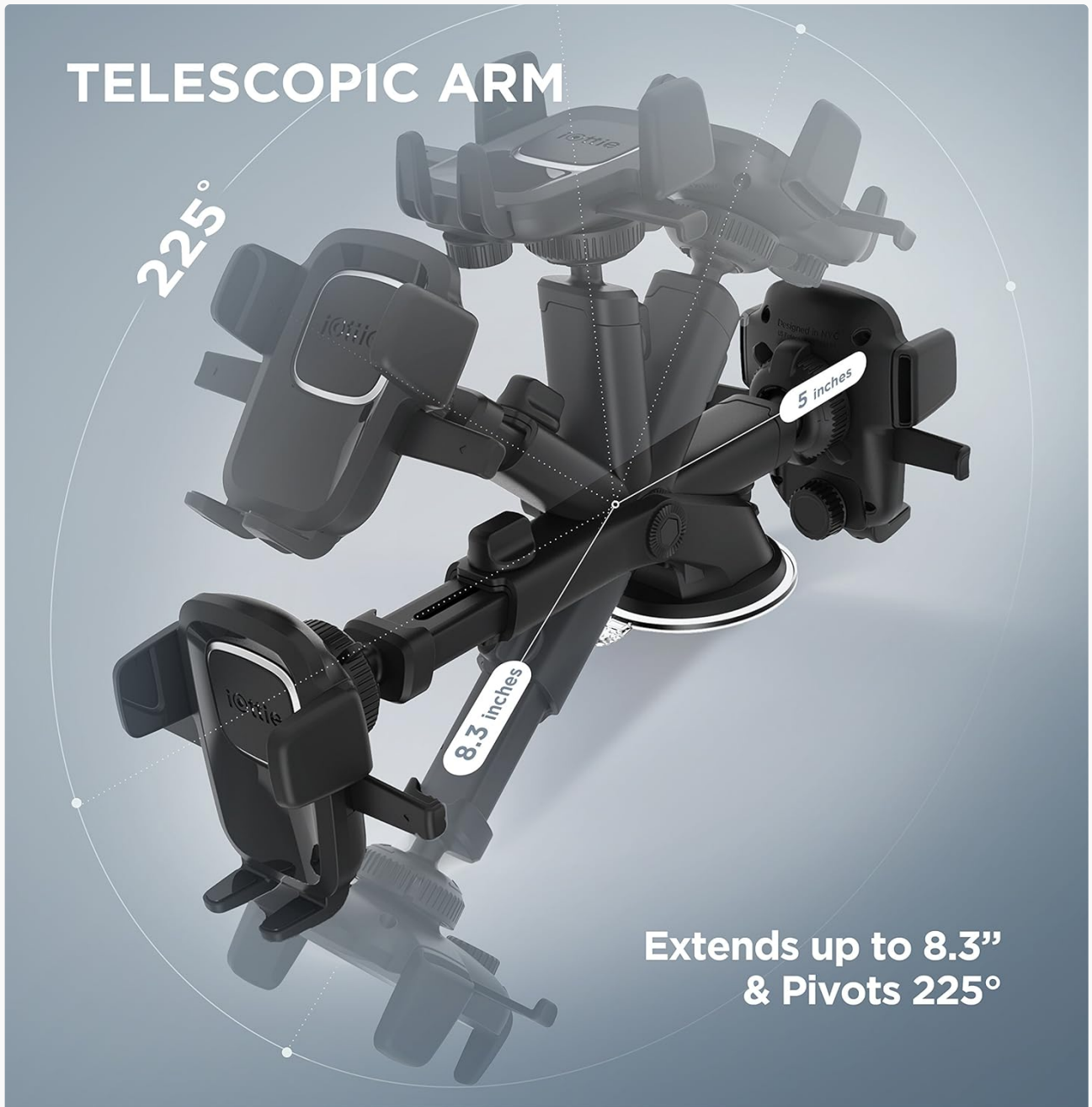
Image: Illustration of the telescopic arm extending and pivoting for optimal viewing angles.

Loosen the knob on the telescopic arm to extend or retract it to your desired length. The arm extends from 4 to 6.5 inches. Tighten the knob to secure the arm's length.