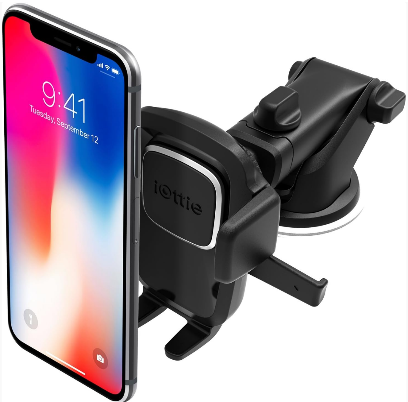
Image: The iOttie Easy One Touch Classic Dash & Windshield Universal Car Mount, shown holding a smartphone.