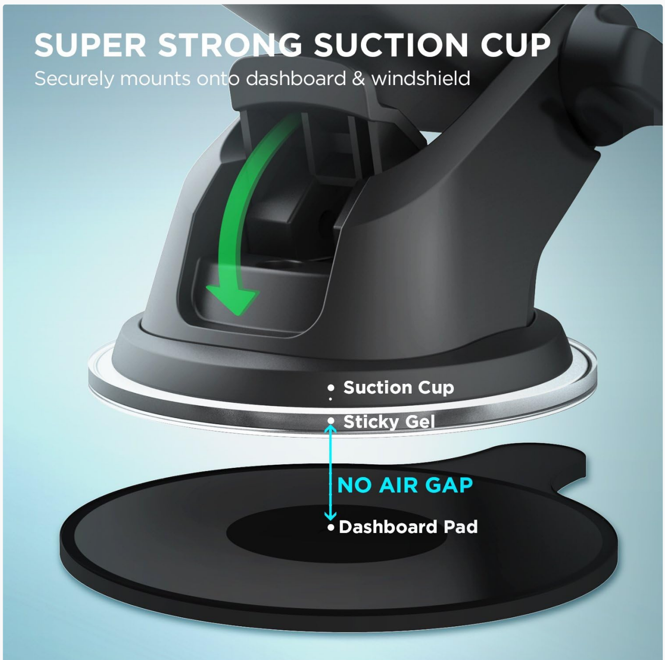
Image: Diagram showing the suction cup, sticky gel, and dashboard pad for secure mounting.

If mounting on a dashboard, peel the protective film from the adhesive dashboard pad and firmly press it onto the cleaned surface. Allow it to set for a few minutes before proceeding.