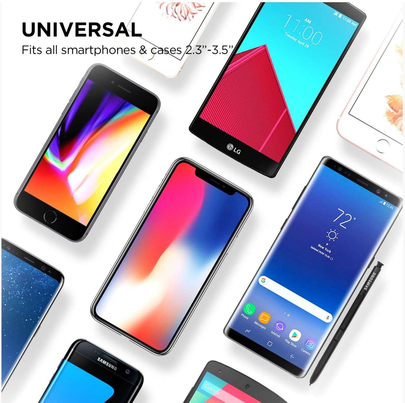
Image: Various smartphones demonstrating the universal fit of the mount for devices between 2.3 and 3.5 inches.