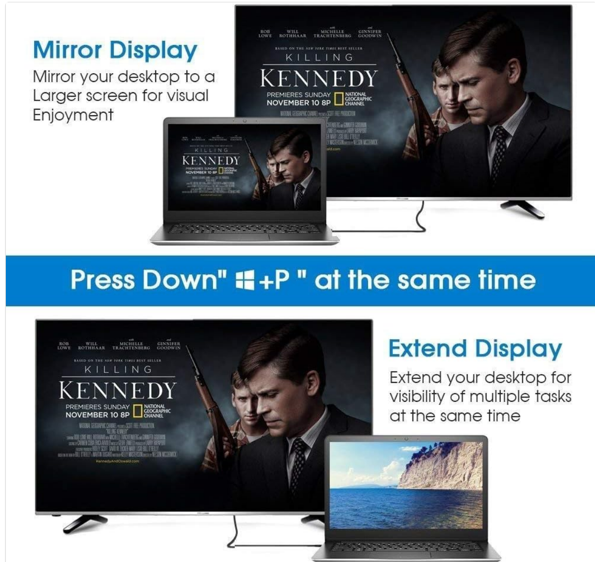
Figure 3: Examples of Mirror Display and Extend Display modes.