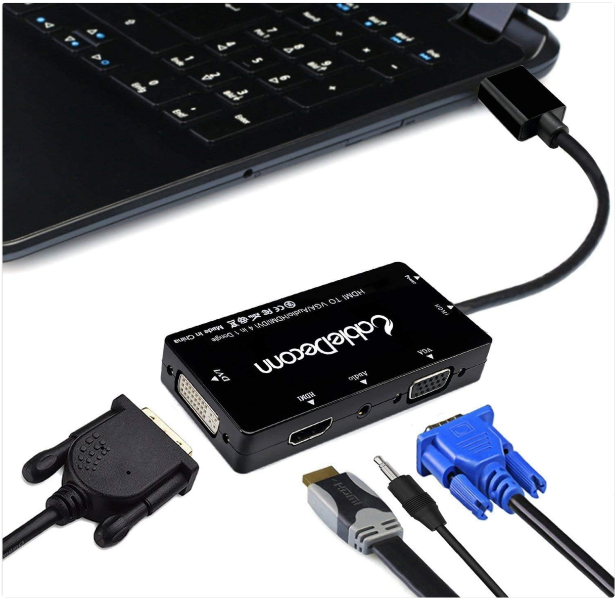
Figure 1: CABLEDECONN 4-in-1 HDMI Adapter showing all ports (HDMI input, HDMI, DVI, VGA, Audio, and Power outputs).