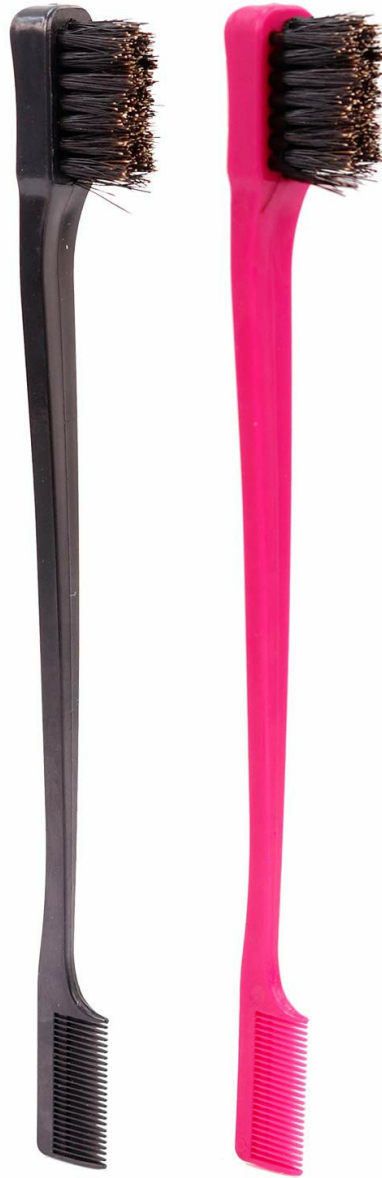
Image: Two Gentle Edges Brushes, one black and one pink. Please note that colors may vary, and only one brush is included per purchase.