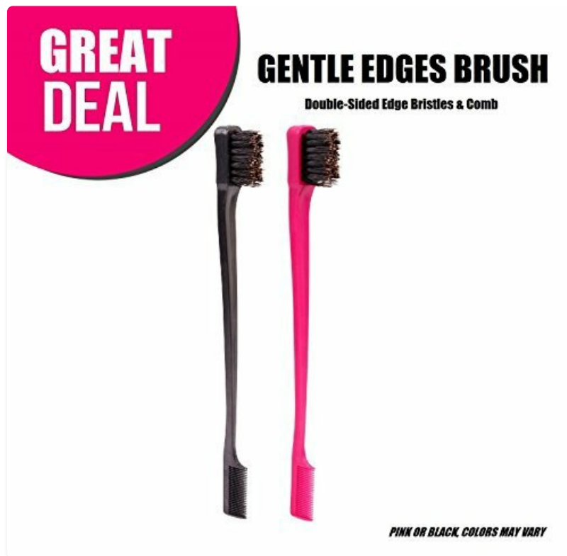
Image: A detailed view of the brush head, showing the bristles and the fine-tooth comb.