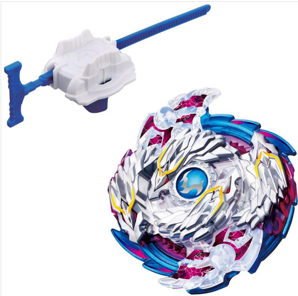
Image showing the complete TAKARA TOMY B-97 Beyblade Burst Starter Nightmare Longinus.Ds set, including the Nightmare Longinus.Ds spinning top and the W Launcher with its ripcord.