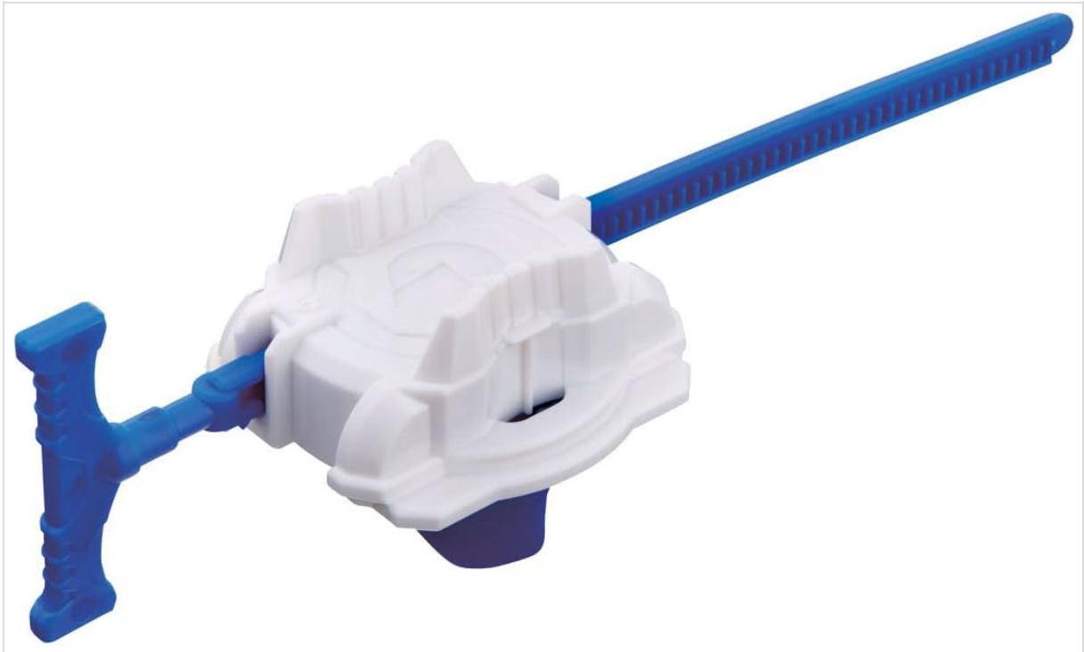
Image of the W Launcher with the blue ripcord correctly inserted, ready for launching a Beyblade.

Insert the ripcord into the W Launcher. Ensure the teeth of the ripcord engage properly with the gear inside the launcher. The ripcord should slide in smoothly and be held firmly.