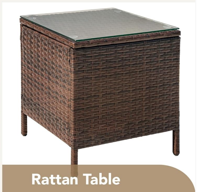
Figure 2.2: Detailed view of the chair, cushion, and table components.