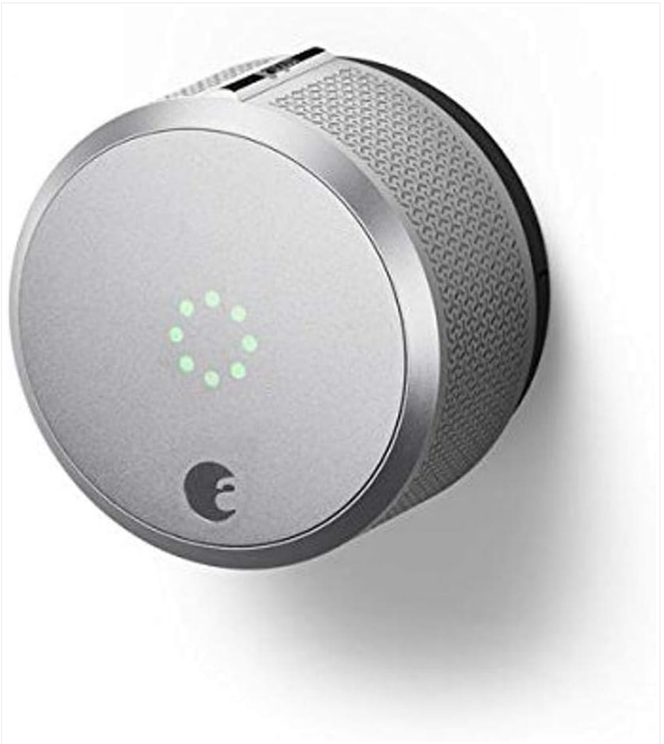
Image: The August Home Silver Smart Lock Pro, 3rd Generation, shown in its silver finish. This is the main unit that attaches to the inside of your door.