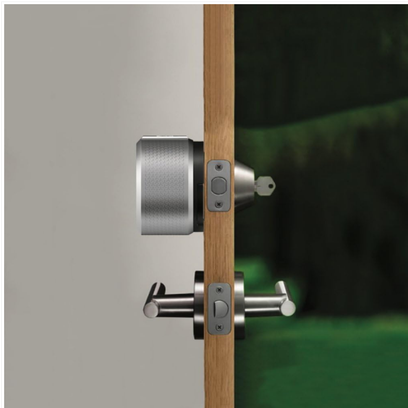
Image: The August Smart Lock Pro installed on the interior side of a wooden door, positioned above a standard door handle. The exterior side of the door retains its original keyhole.