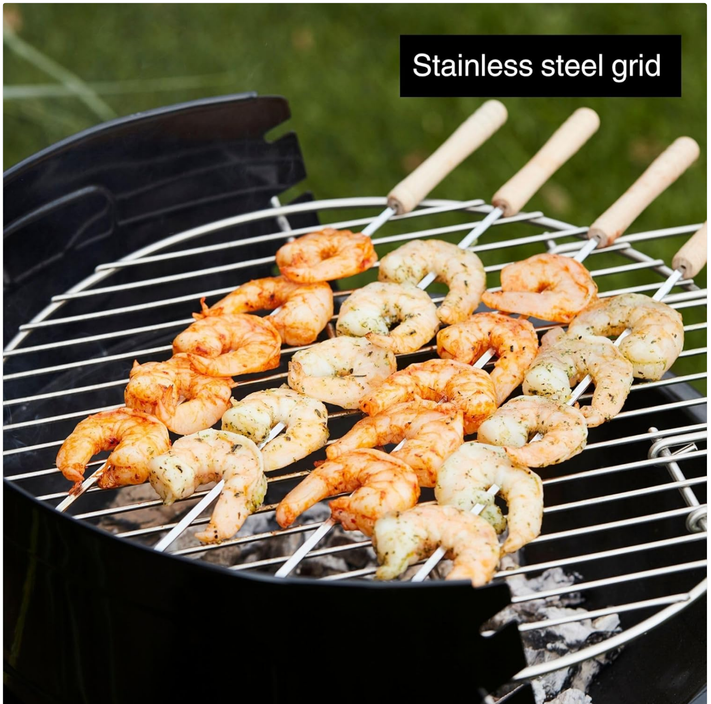
Figure 6: The durable stainless steel grid, shown with food cooking, highlighting its robust construction.