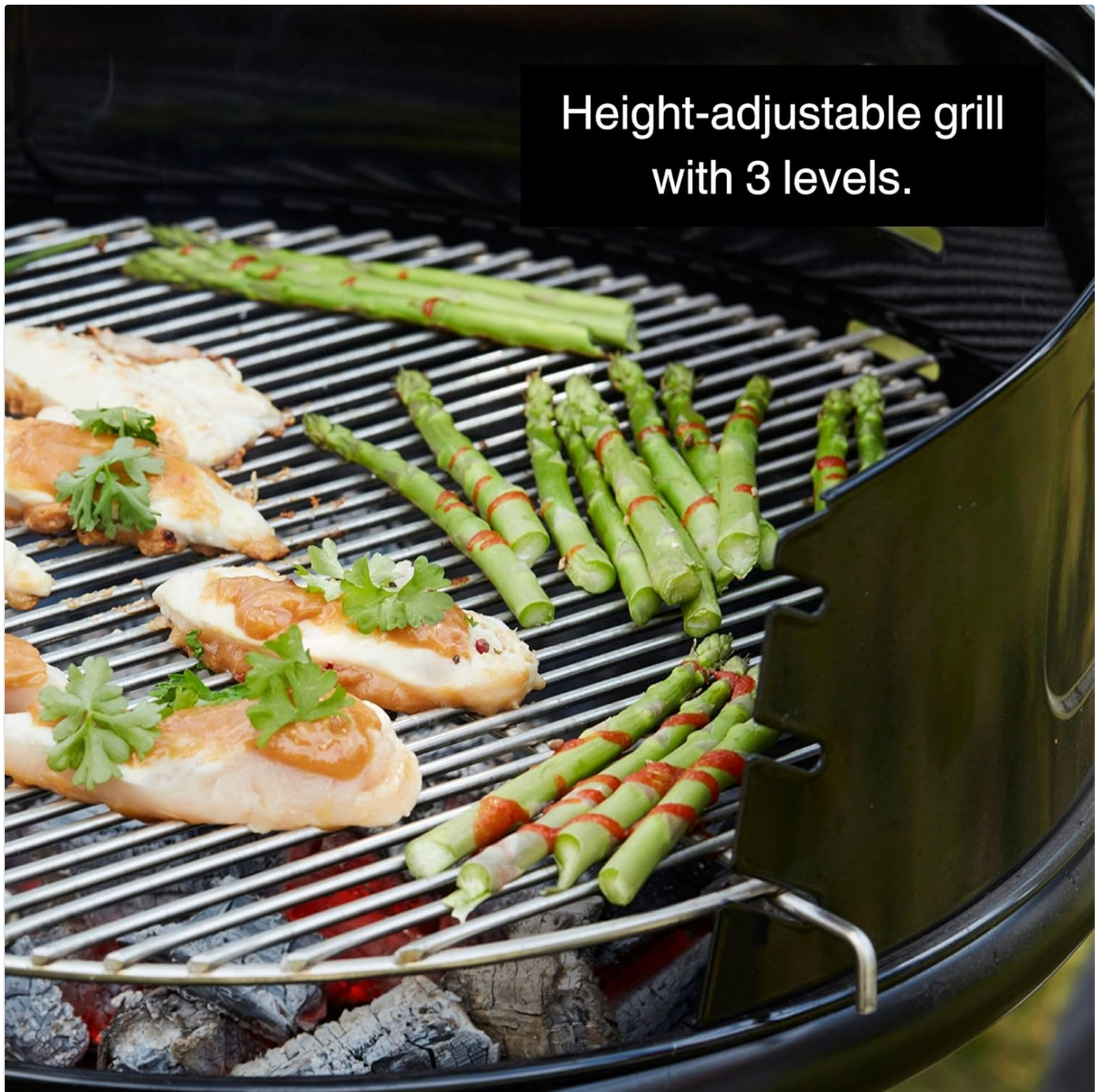
Figure 5: The height-adjustable grill with 3 levels, allowing for versatile cooking temperatures.