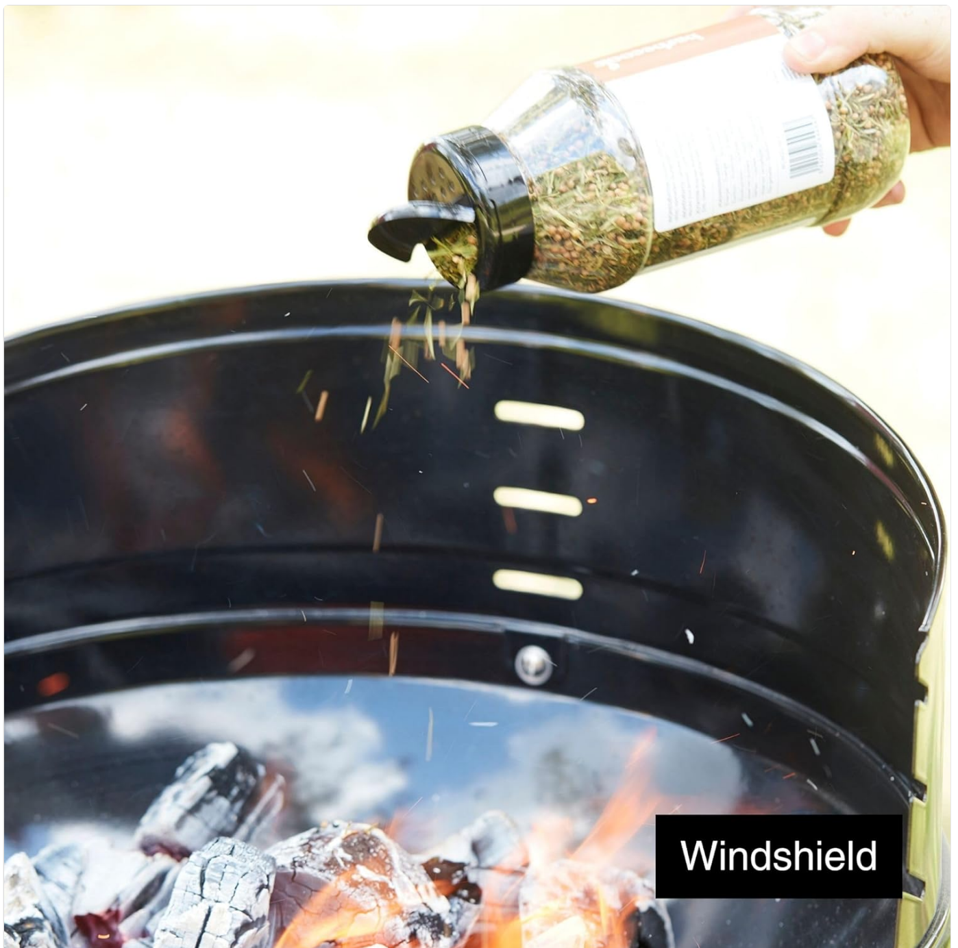
Figure 7: The integrated windshield, designed to protect the flame and enhance heat retention during grilling.