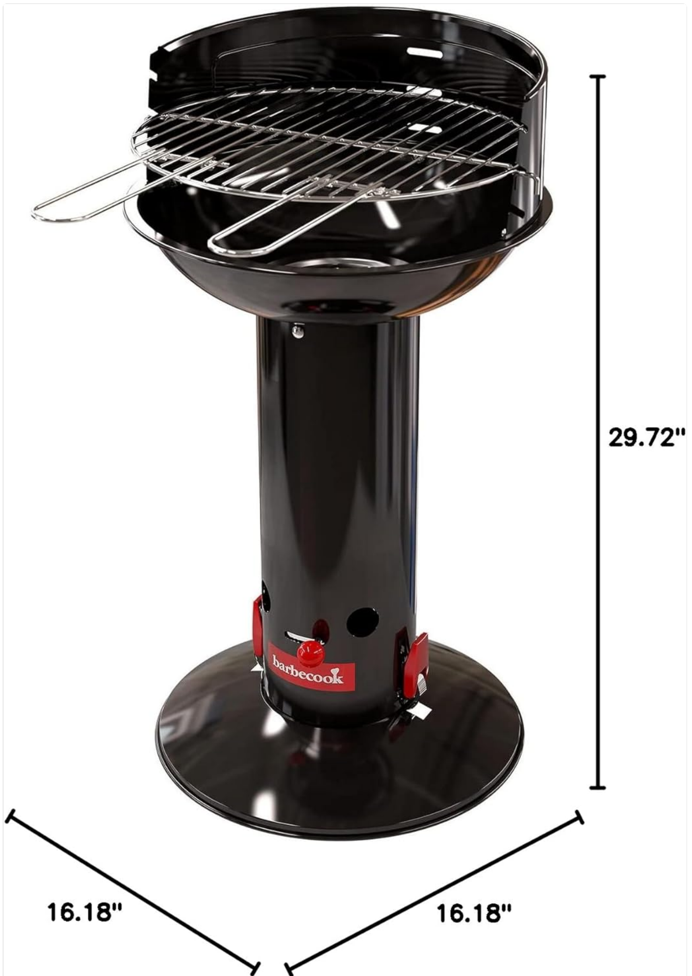
Figure 2: Dimensions of the Barbecue Loewy 40, showing its compact design at 16.18"D x 16.18"W x 29.72"H.