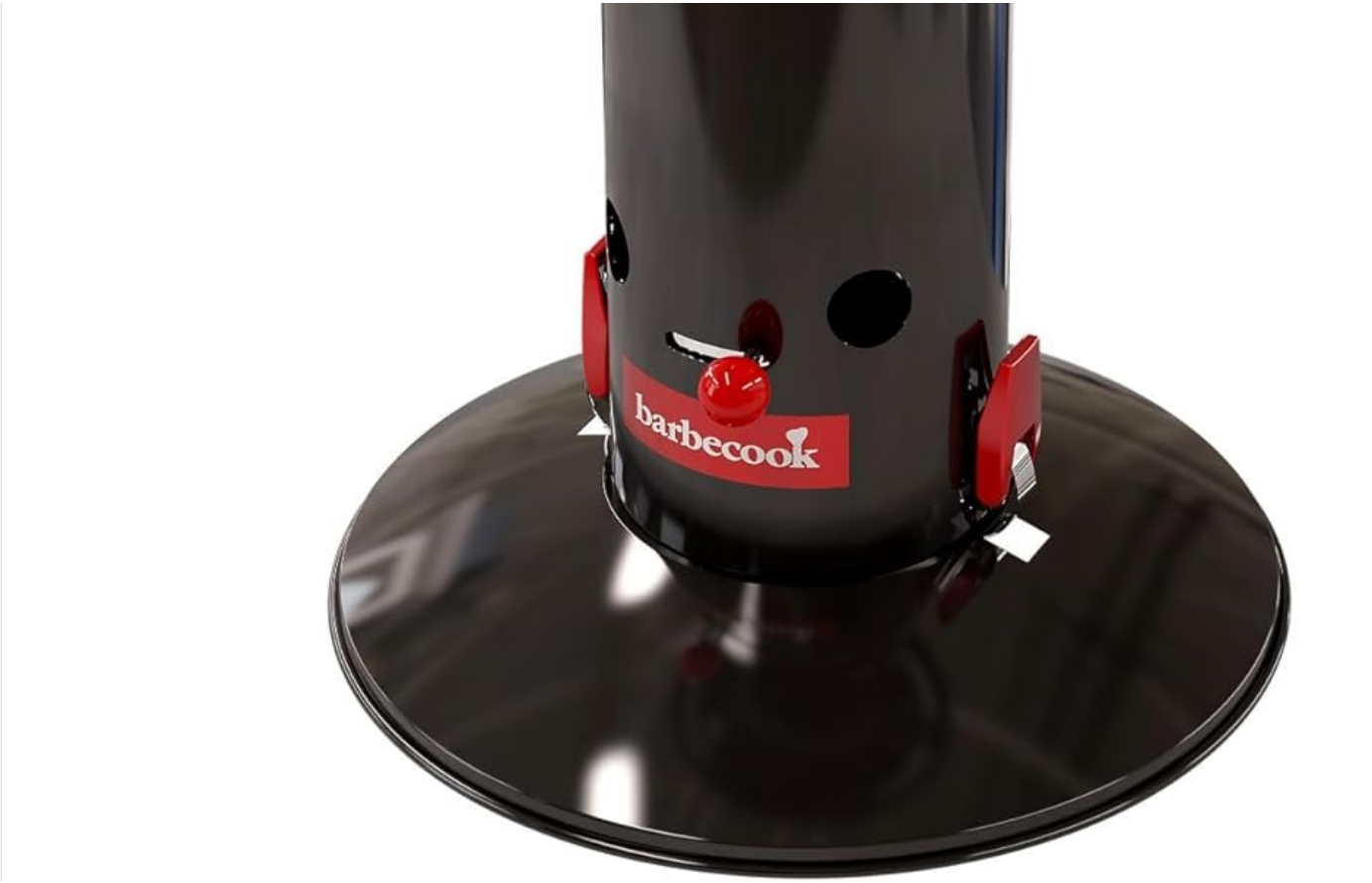
Figure 1: Fully assembled Barbecook Loewy 40 Charcoal BBQ, ready for use.