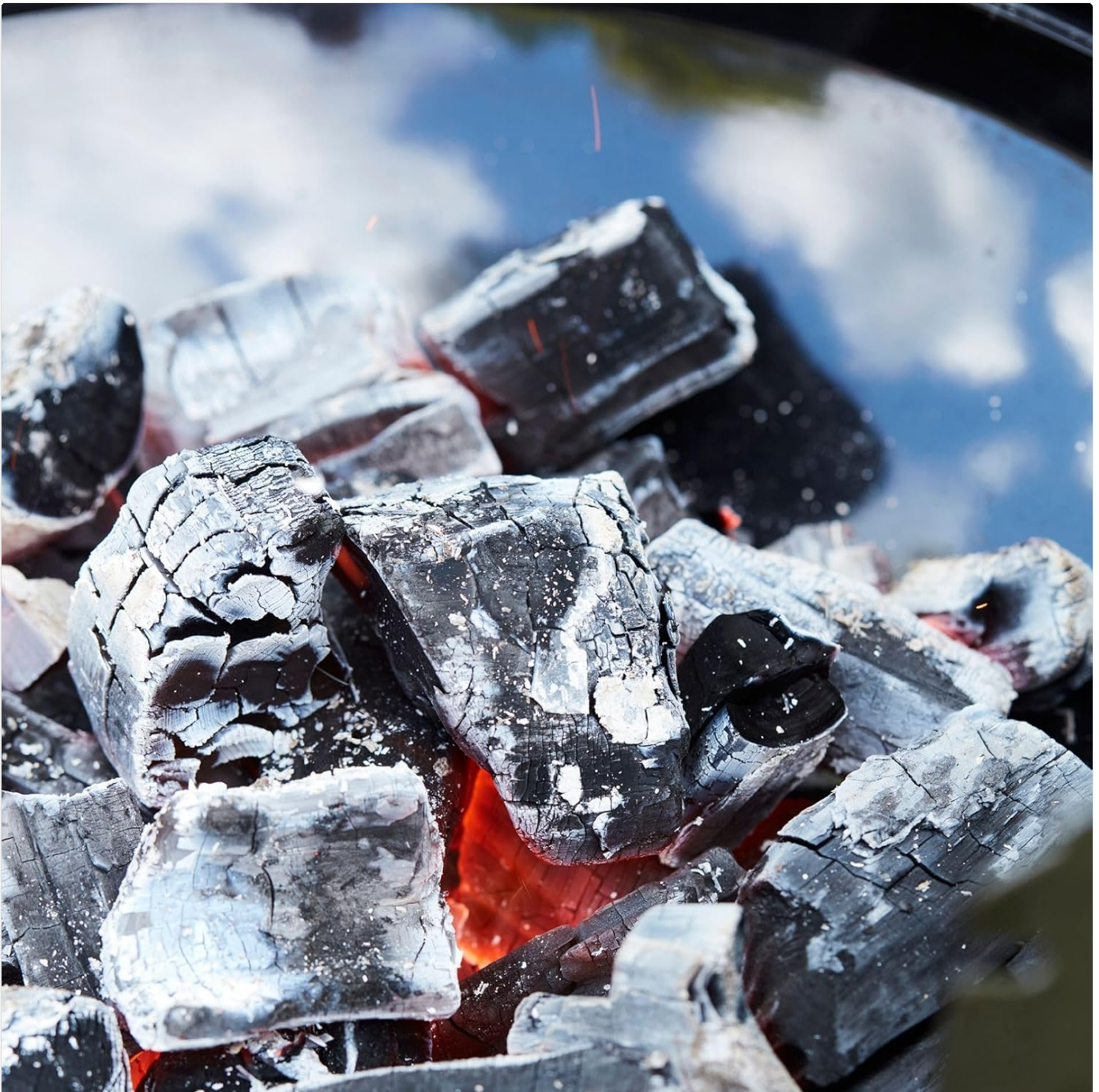
Figure 4: Close-up view of glowing charcoal, indicating it is ready for grilling after the QuickStart process.