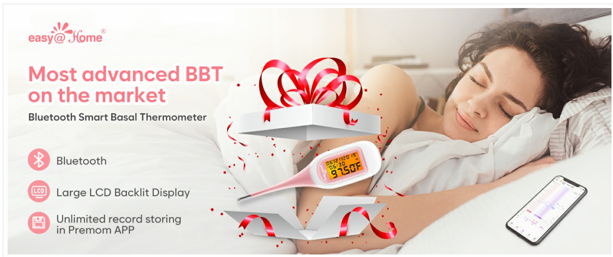
Figure 1: Overview of Easy@Home Smart Basal Thermometer features.