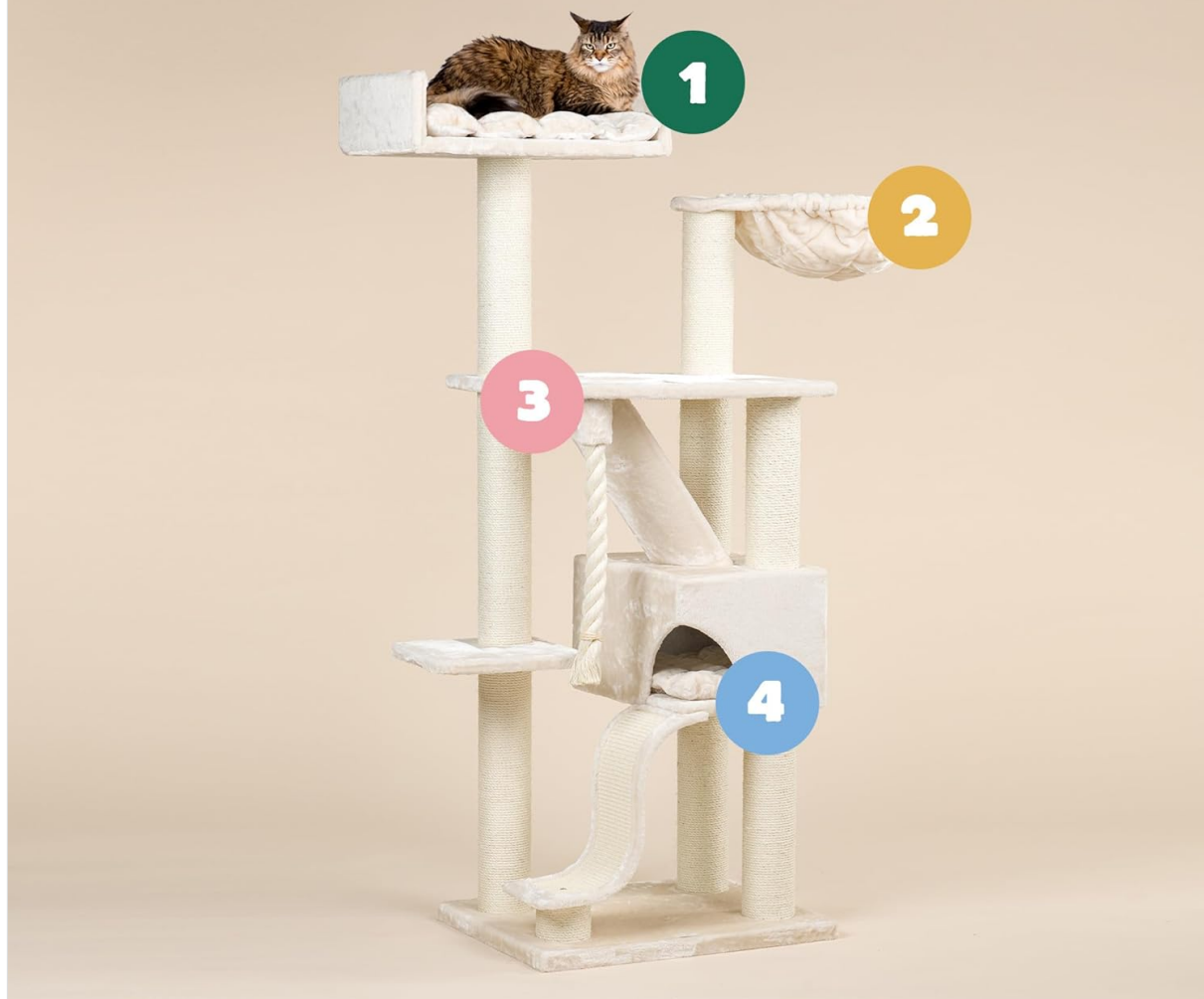
Figure 2.1: Key features of the Kilimanjaro Deluxe Cat Tree, including 12 cm thick sisal posts.

Avec des troncs en sisal de 12 cm d'épaisseur