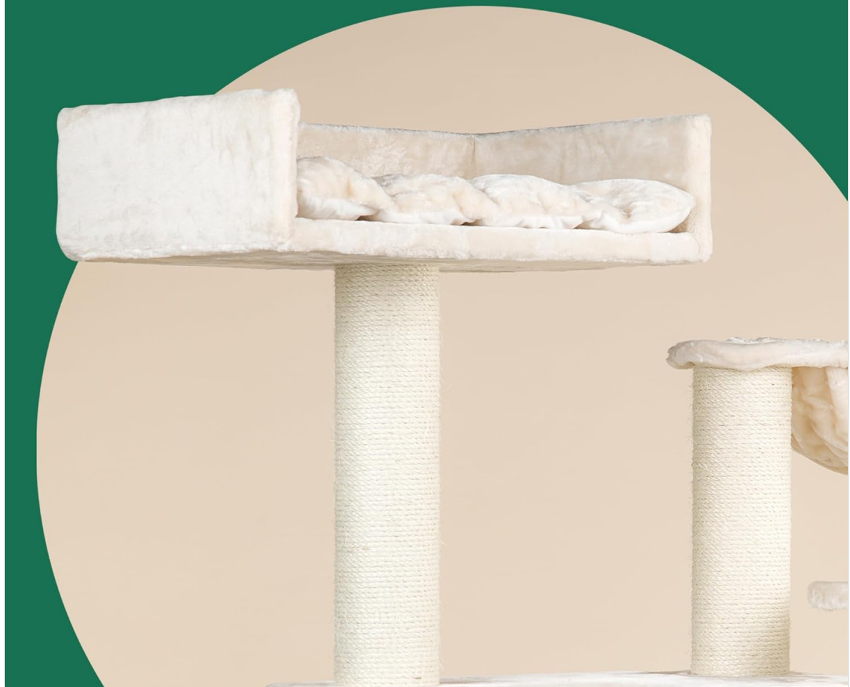
Figure 4.2: Detail of the removable cushion for the top sleeping area.