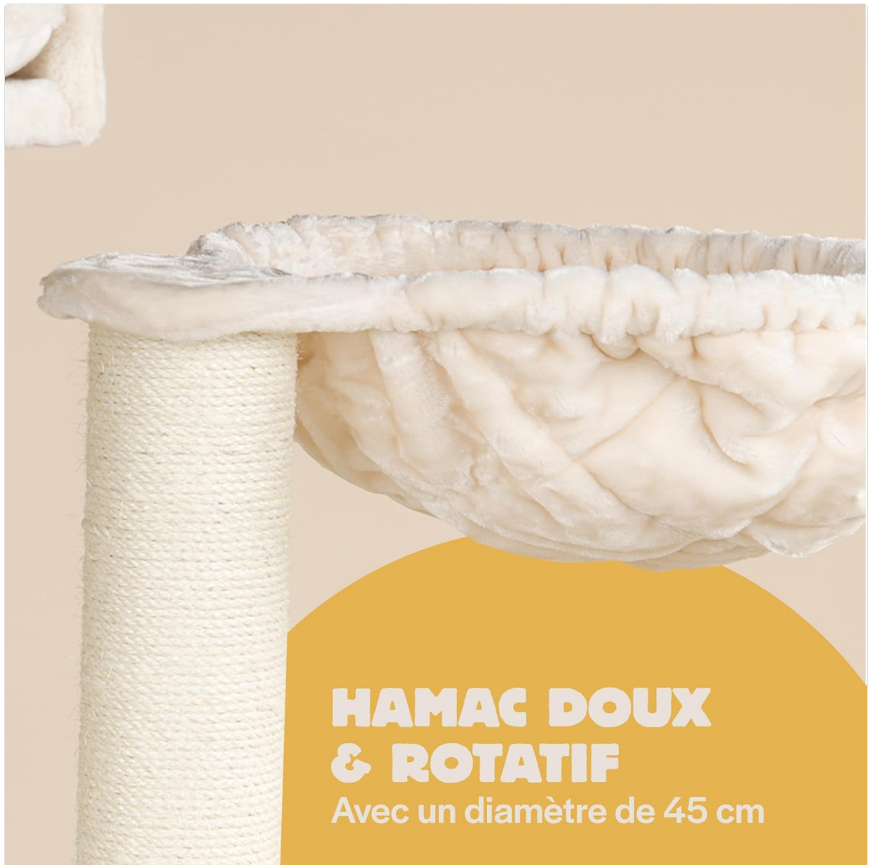
Figure 4.3: Detail of the soft, rotatable hammock.