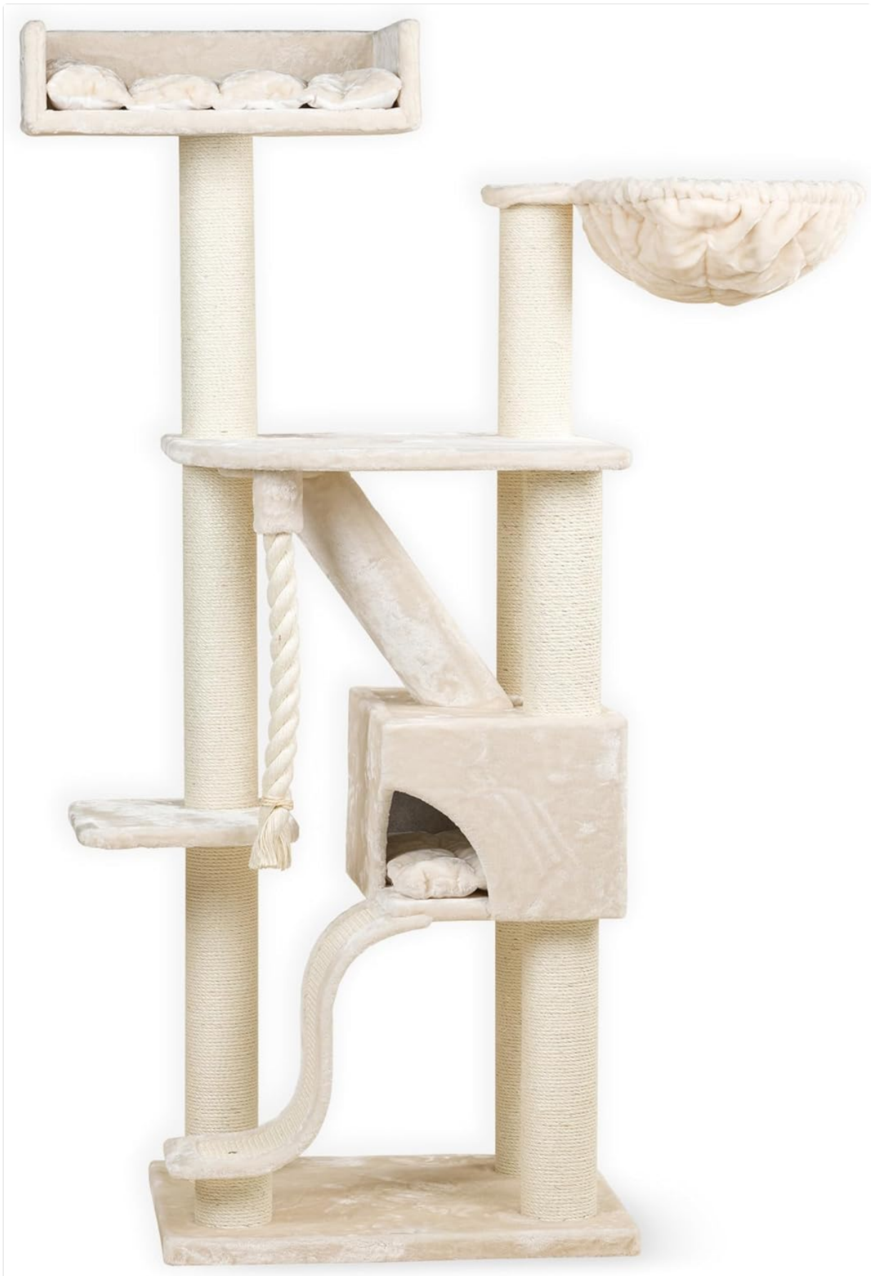
Figure 4.1: Fully assembled RHRQuality Kilimanjaro Deluxe Cat Tree.