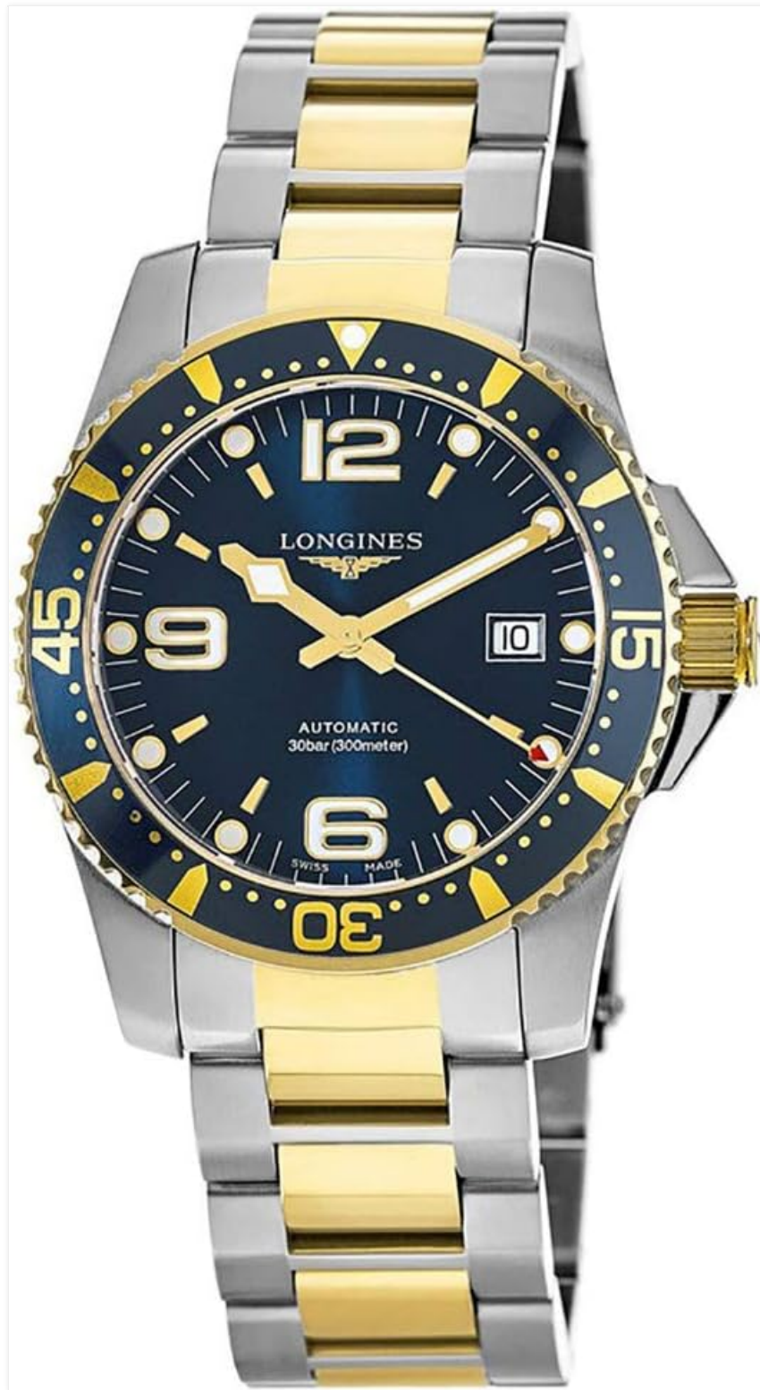
Image 1: Front view of the Longines Hydroconquest Automatic Watch L37423967. This image displays the watch's blue dial with gold-tone hour markers and hands, a uni-directional rotating bezel with gold accents, and a two-tone stainless steel bracelet. The date window is visible at the 3 o'clock position, and the Longines logo is prominently featured below the 12 o'clock marker. The text "AUTOMATIC 30bar (300meter)" is visible on the dial, indicating its automatic movement and water resistance.