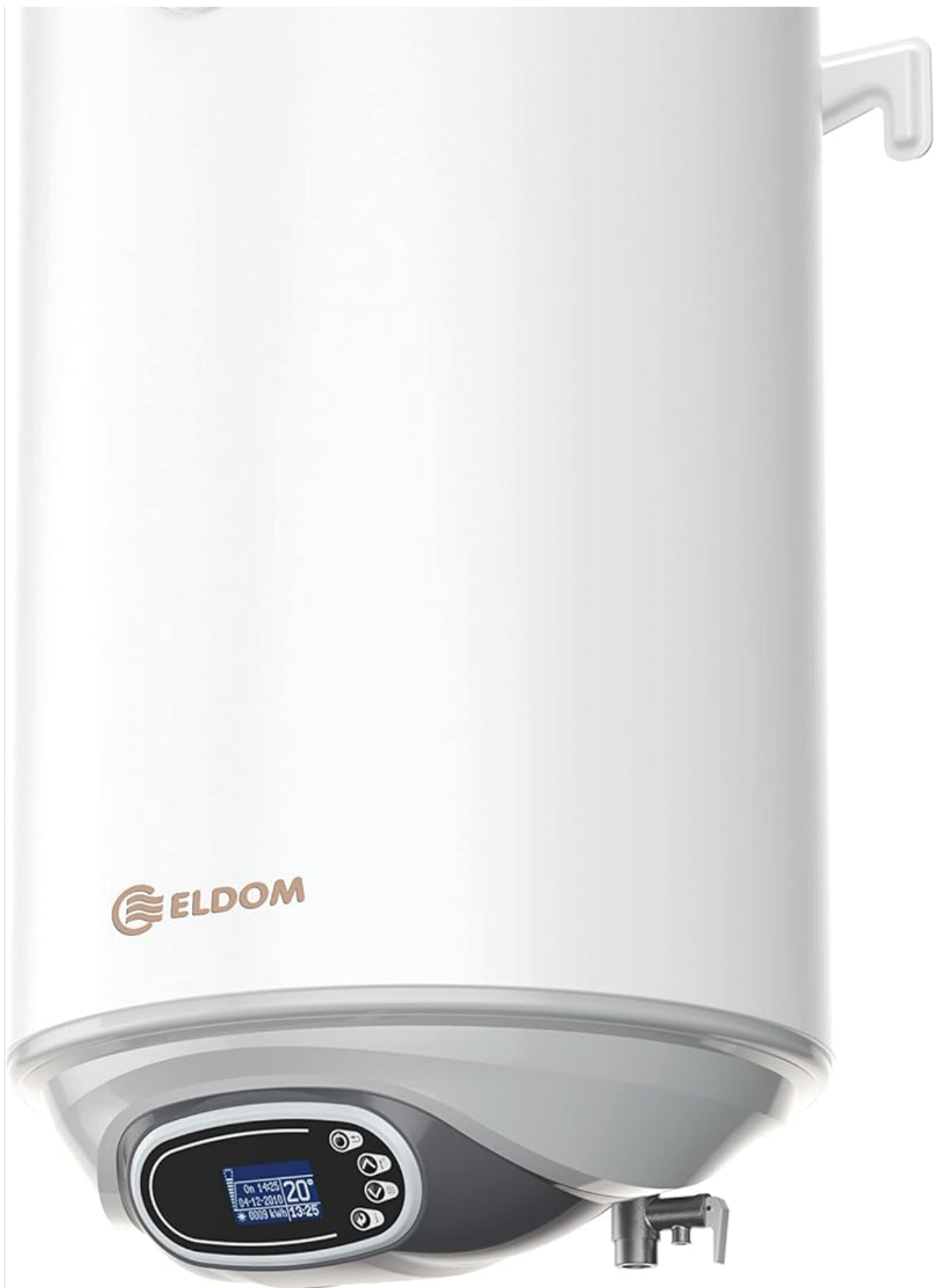
Image 8.1: Product data sheet (Produktdatenblatt Warmwasserspeicher) for Eldom Favourite 50L WV05039E.