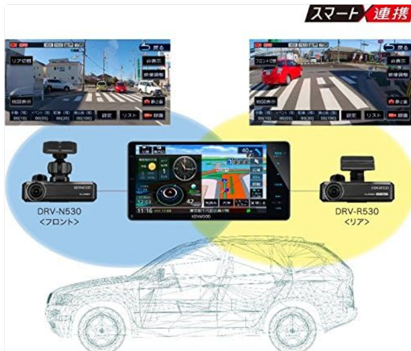
Image: Smart linkage feature showing the navigation unit connected to front and rear drive recorders.

The MDV-M705 can integrate with compatible KENWOOD drive recorders (front and rear) for enhanced safety features. This allows for dual recording and viewing of recorded footage directly on the navigation screen.