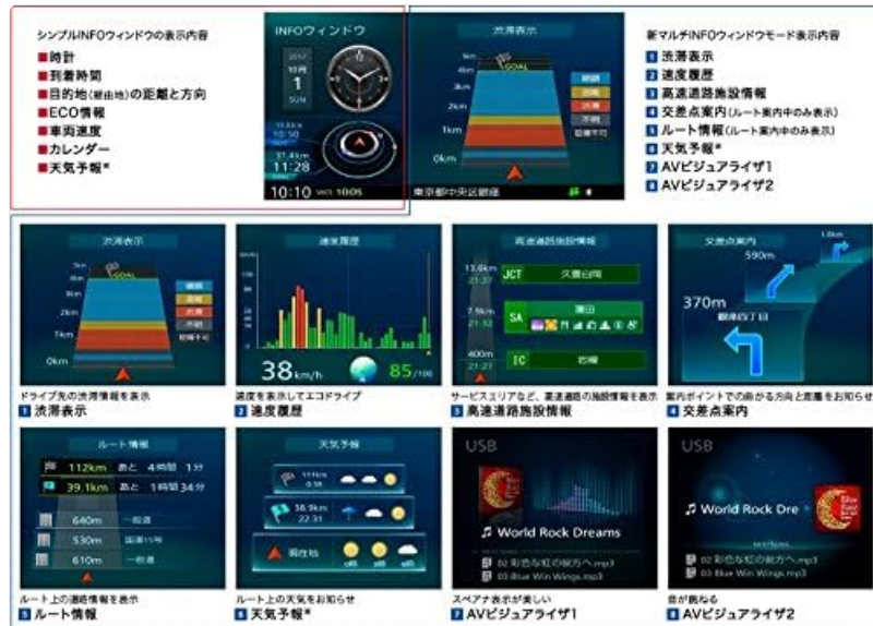
Image: Examples of the multi-information window displaying various data like clock, ECO mode, weather, and USB audio.