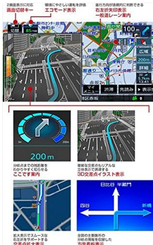
Image: Detailed navigation display with lane guidance and 3D intersection view.