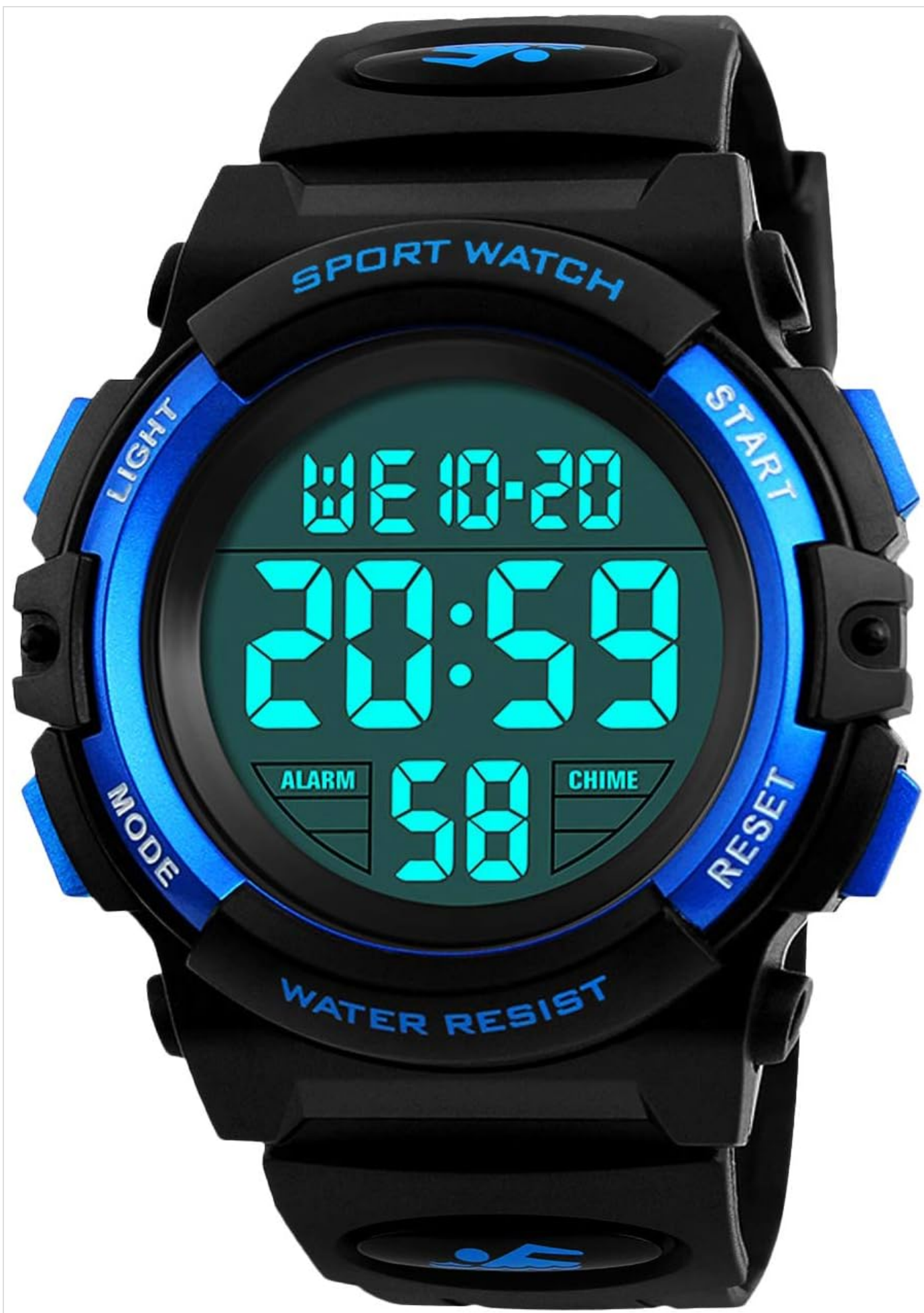
Image 1.1: Front view of the KIDPER Kids Digital Watch, Model 1266. The watch displays the time 20:59, date WE 10-20, and features 'LIGHT', 'START', 'MODE', and 'RESET' buttons.