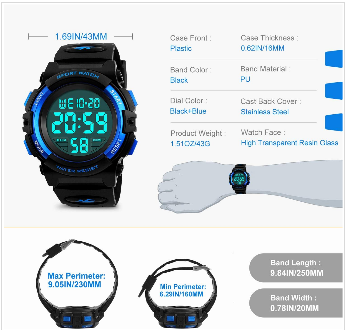
Image 4.1: Detailed dimensions and material specifications of the watch.