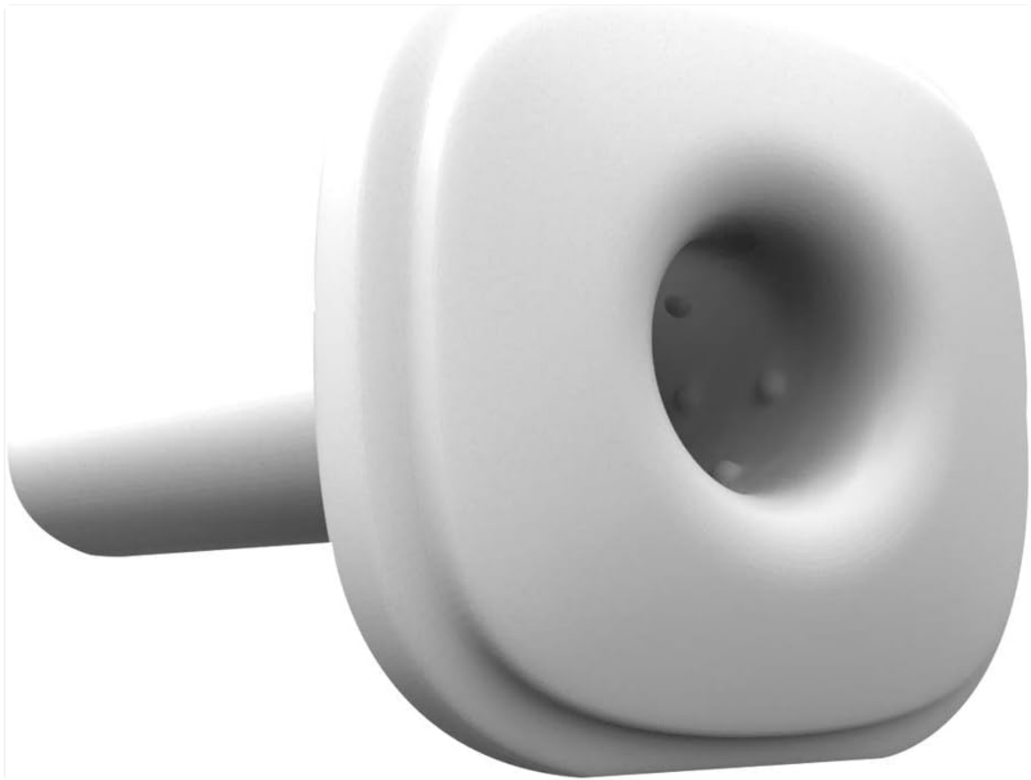
Figure 6: Close-up view of the SuperSkin Kiiroo insert, showing its texture.