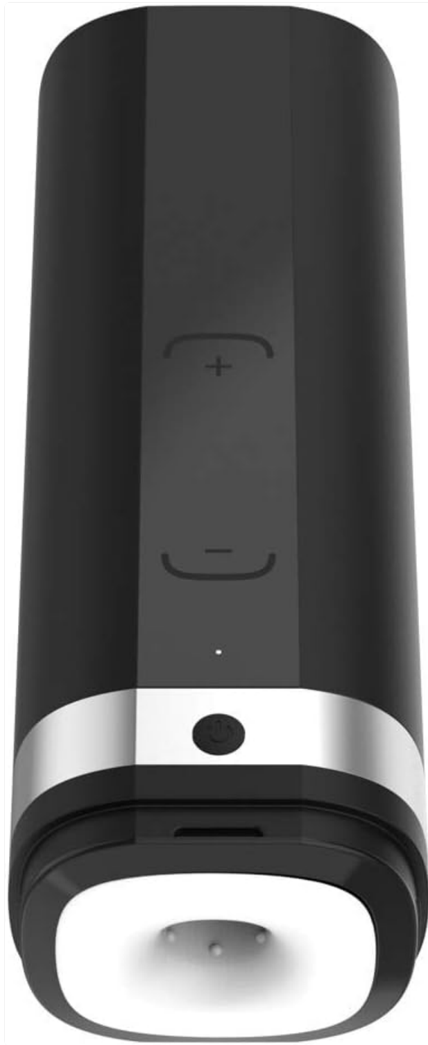
Figure 3: Top-down view of the Onyx 2, showing the sleeve opening, power button, and control buttons.