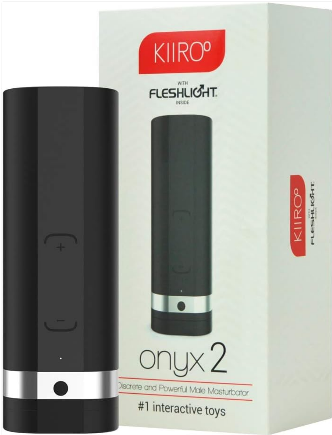
Figure 1: KIIRRO Onyx 2 device shown alongside its retail packaging.