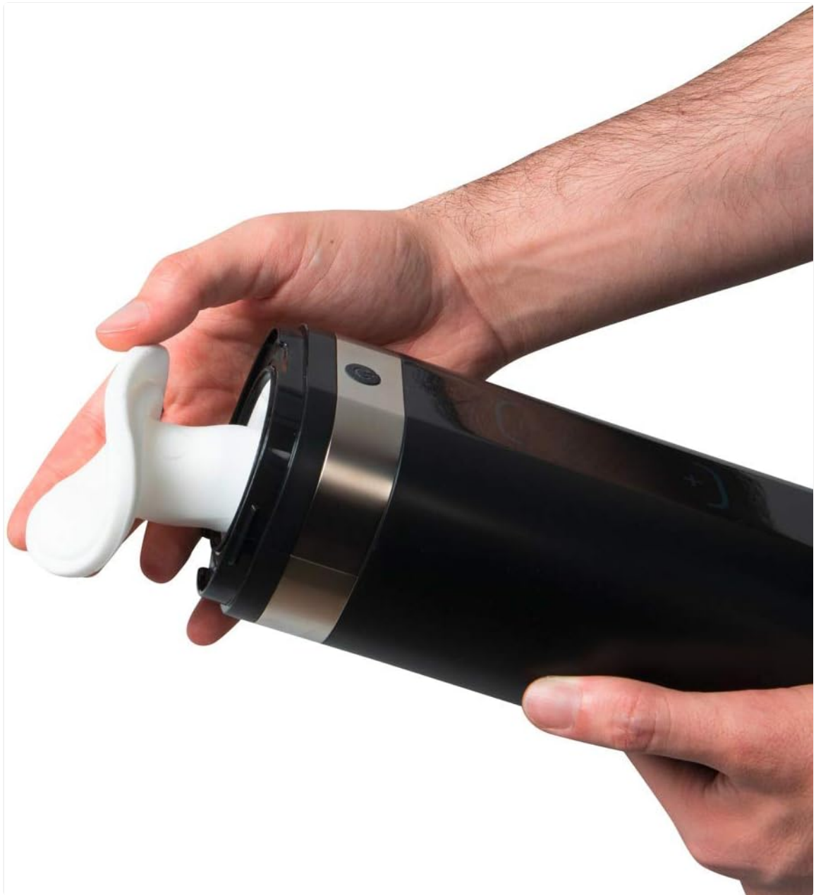
Figure 5: Illustration of removing the internal sleeve for cleaning.