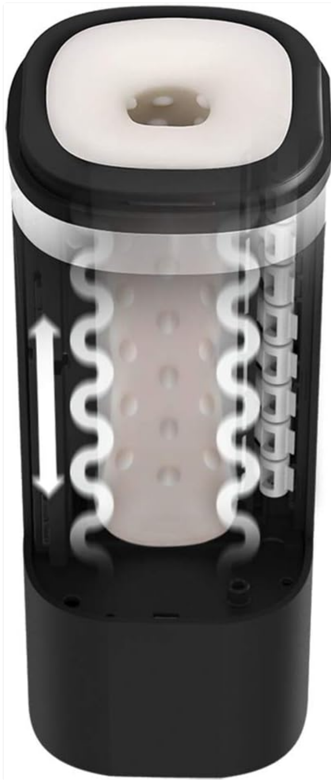
Figure 4: Internal view of the Onyx 2, illustrating the sleeve and the automated thrusting mechanism.