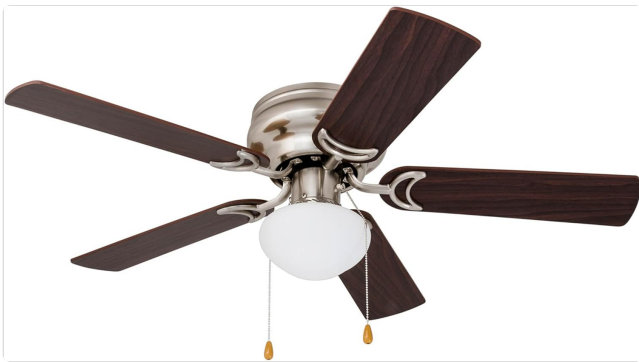
Image: The Alvina 42-inch ceiling fan in Satin Nickel finish with Walnut Brown blades, ready for installation.