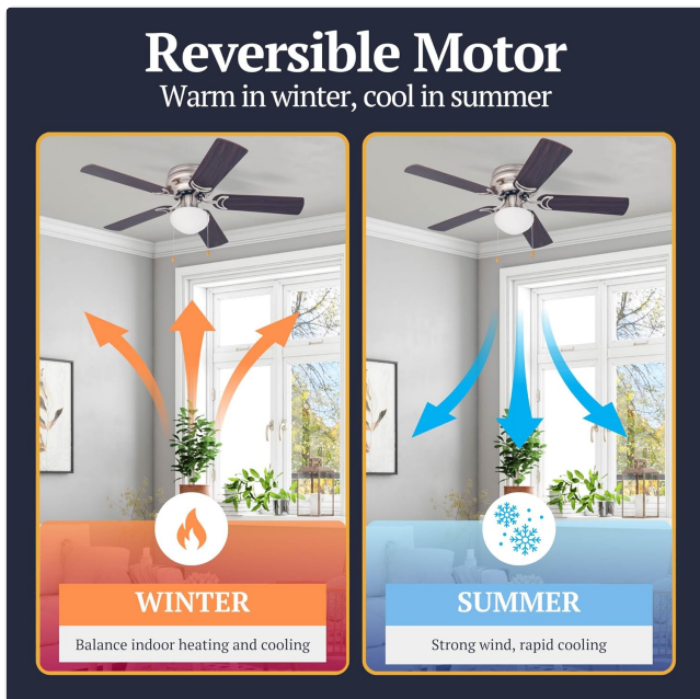
Image: Illustration demonstrating the reversible motor function, allowing for warm air circulation in winter and cooling airflow in summer.