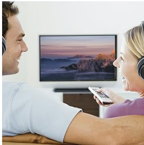
Image: A couple comfortably watching television while wearing headphones, demonstrating shared quiet listening.