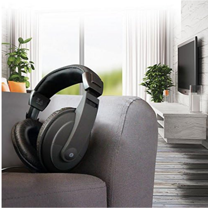
Image: The Metronic headphones resting on a sofa, positioned near a television, illustrating a typical usage scenario.