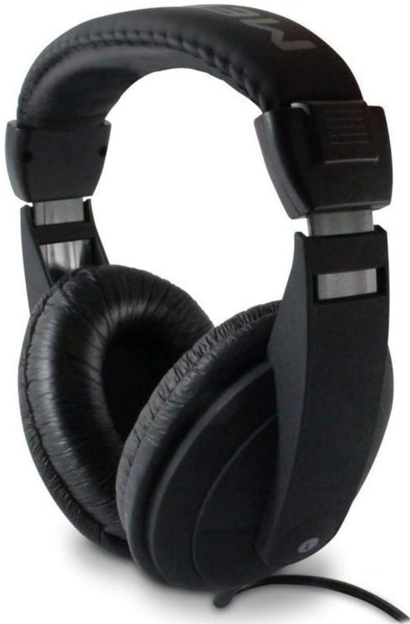
Image: The Metronic 480143 over-ear headphones in black, showcasing their design.