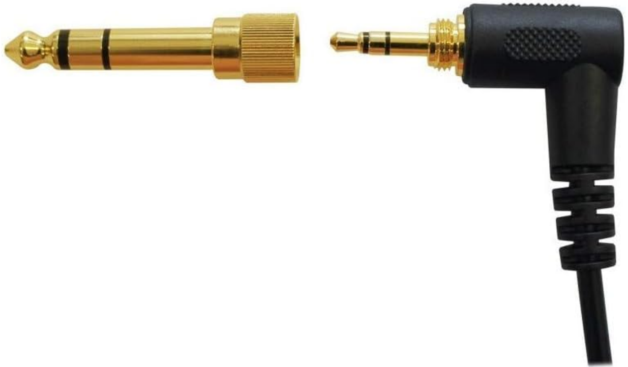
Image: The included 3.5mm jack and the detachable 6.35mm adapter.