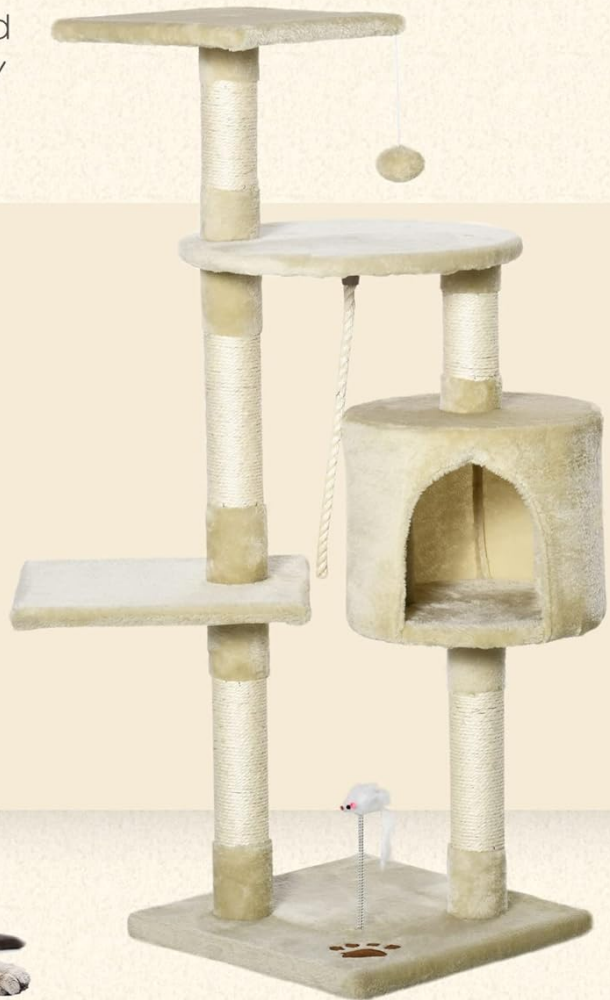
Image: Visual representation of the cat tree's key features, including its sturdy structure and soft plush covering.