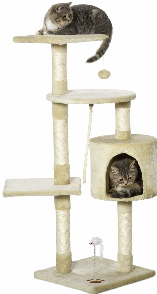
Image: The PawHut D30-035 cat tree, showcasing its multi-level design and integrated cat condo.