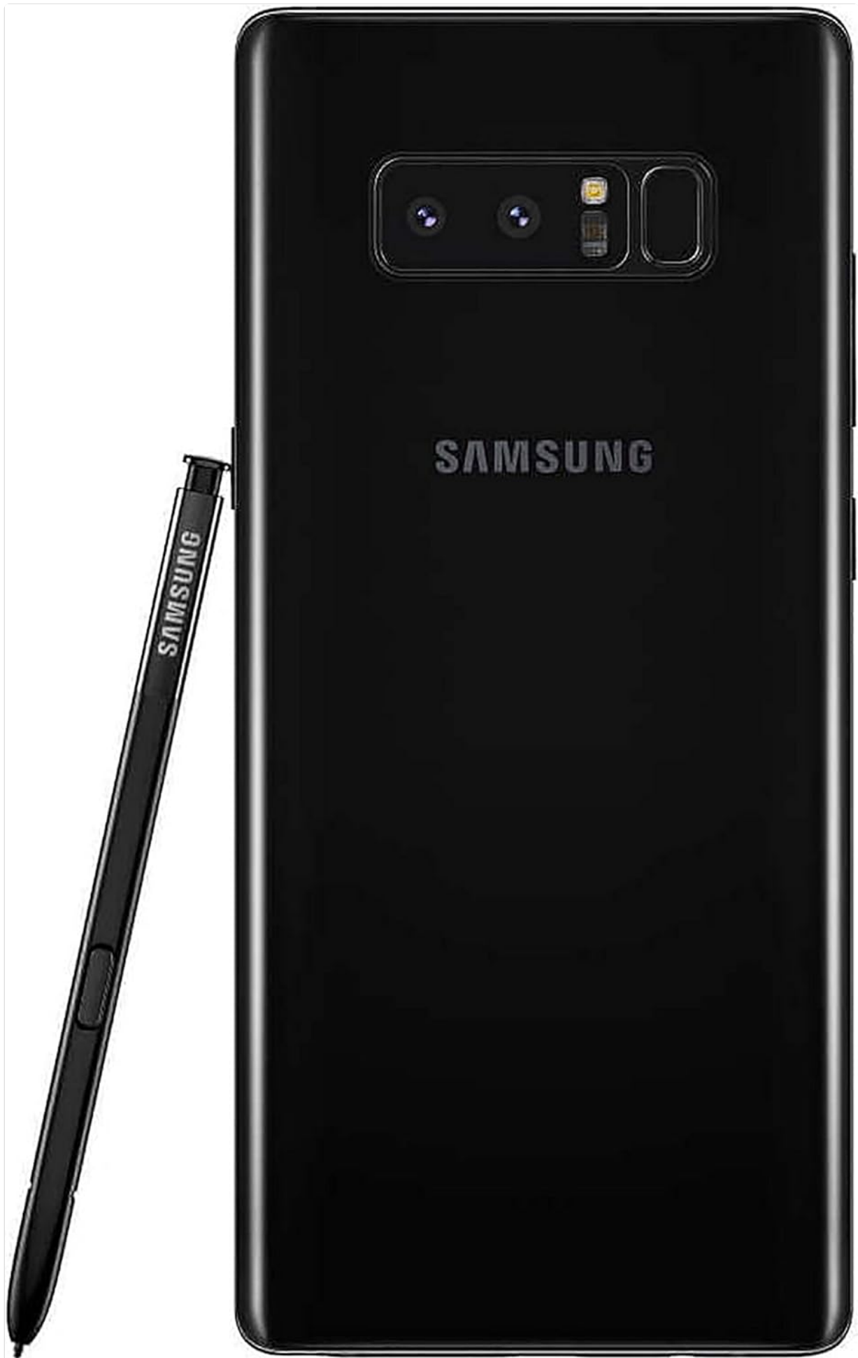
Image 2.1: Rear view of the Samsung Galaxy Note 8, showing the dual camera and S Pen slot with the S Pen partially removed.