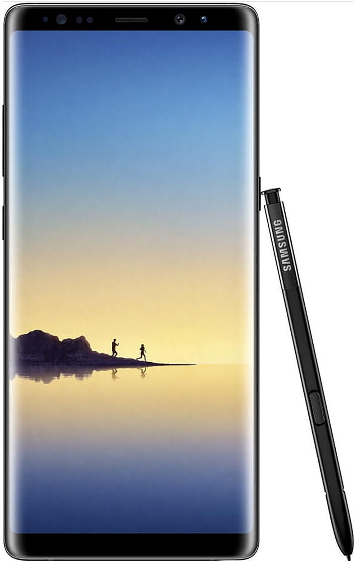
Image 1.1: Front view of the Samsung Galaxy Note 8 smartphone, showcasing its large display.