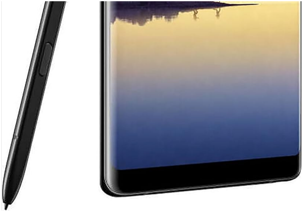
Image 4.1: Front view of the Samsung Galaxy Note 8 with the S Pen, demonstrating its use for screen interaction.