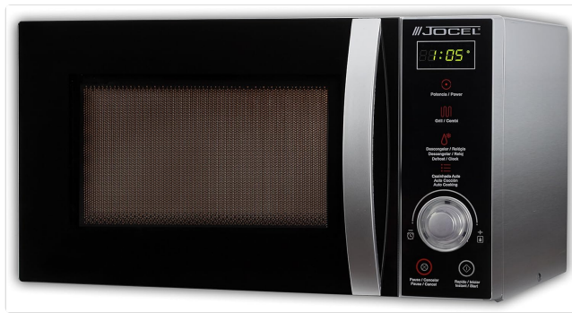
Figure 2.1: Front view of the Jocel JMO001276 Microwave Oven, showing the control panel, door, and viewing window.