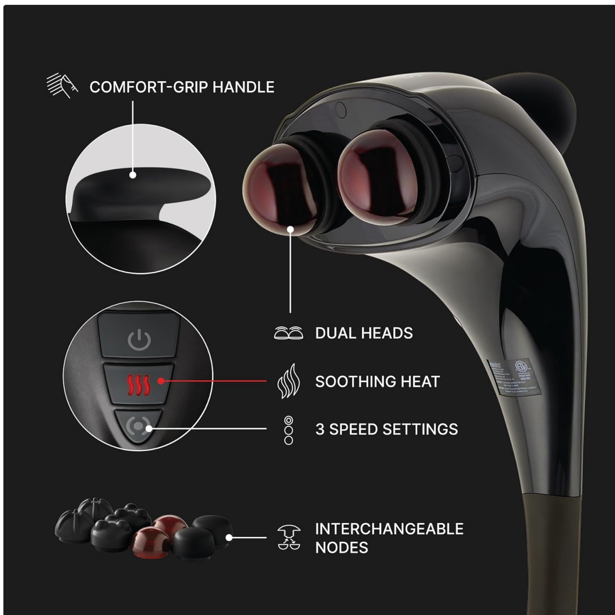
Image: Detailed view of the massager showing dual heads, soothing heat button, 3 speed settings, and interchangeable nodes.