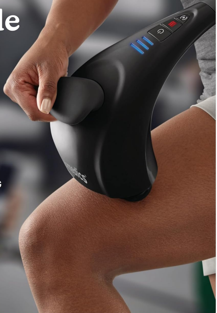
Image: The massager held by hand, highlighting its comfort grip handle and portable design for easy use and transport.