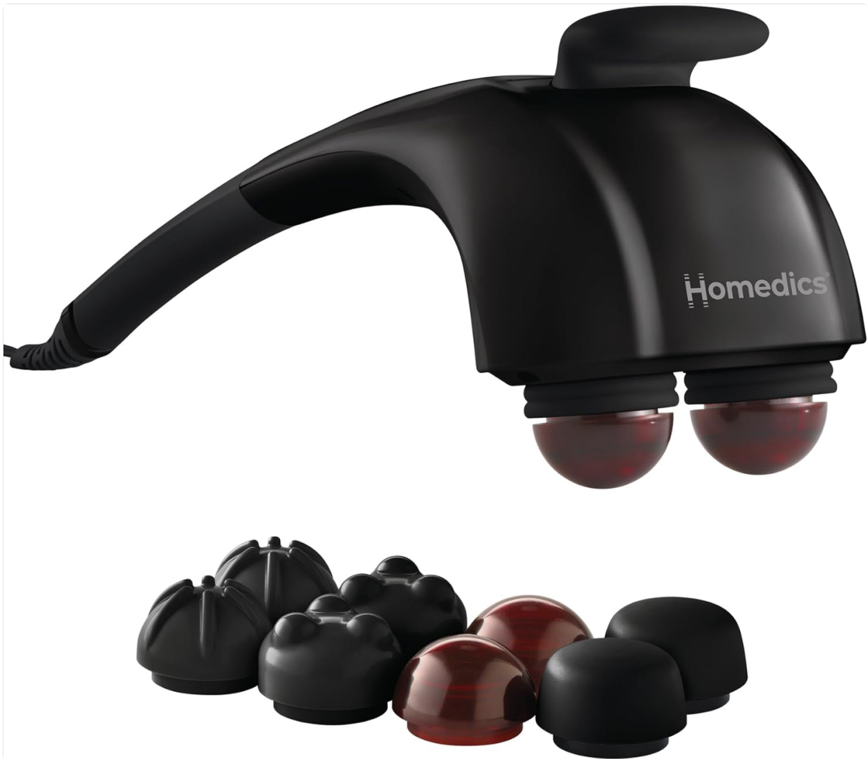
Image: The HoMedics Twin Percussion Pro Massager with Heat, shown with its main body and all included interchangeable massage nodes.