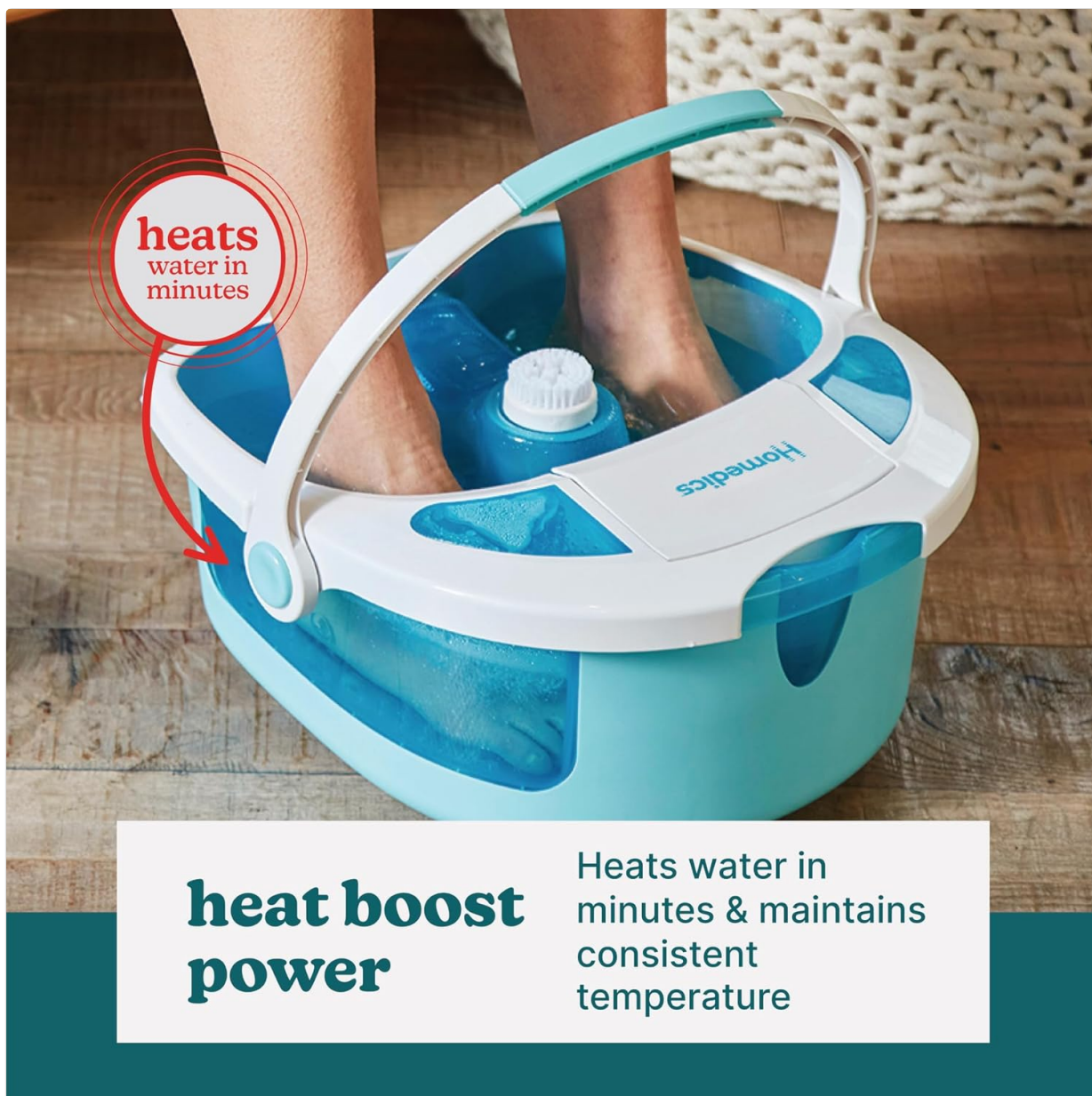
Image: A close-up of feet immersed in the HoMedics Shower Bliss Foot Spa, with an arrow indicating the "heat boost power" feature, which heats water in minutes and maintains consistent temperature.