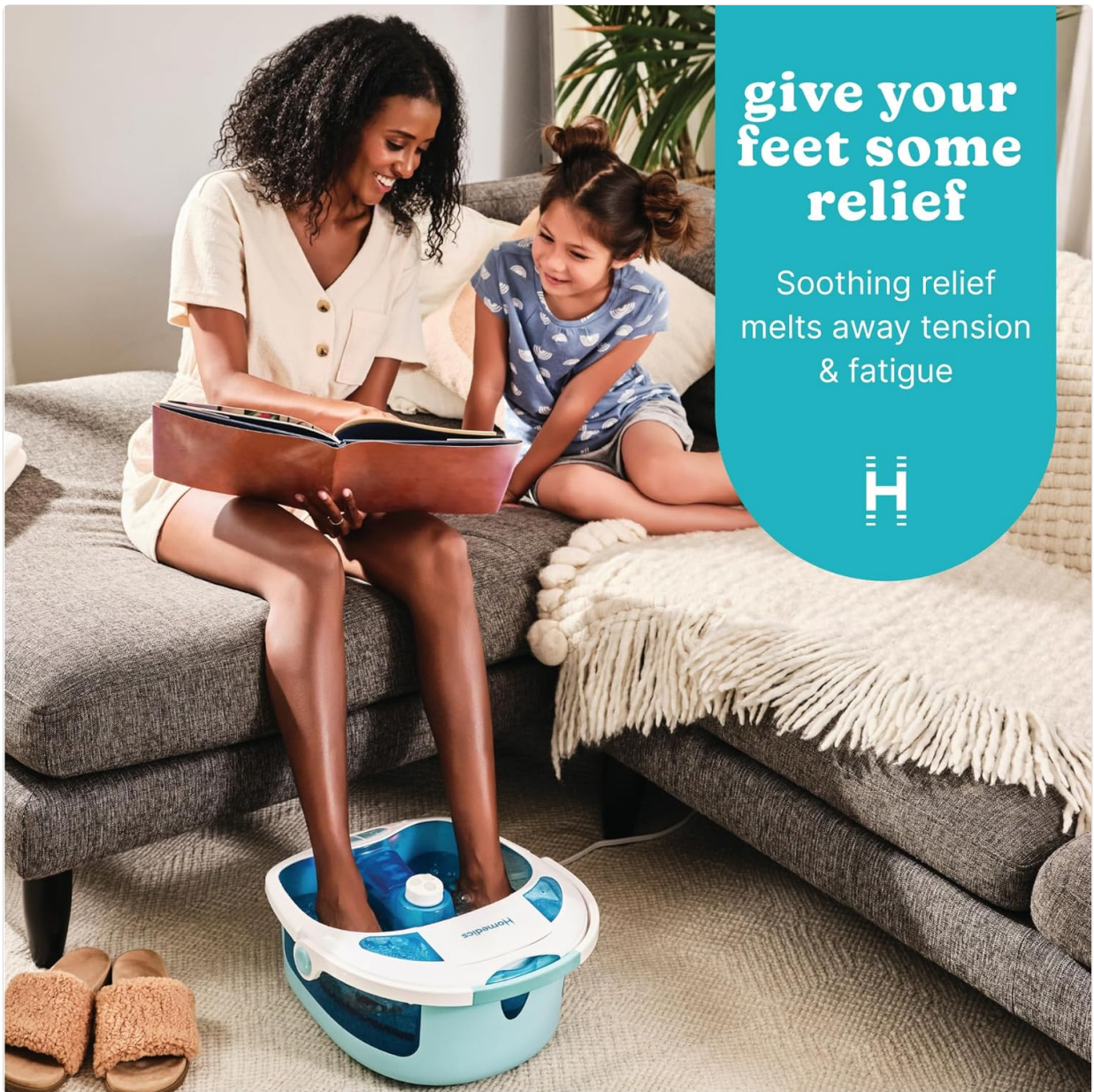
Image: The HoMedics Shower Bliss Foot Spa in operation, showing water and bubbles, ready for use.