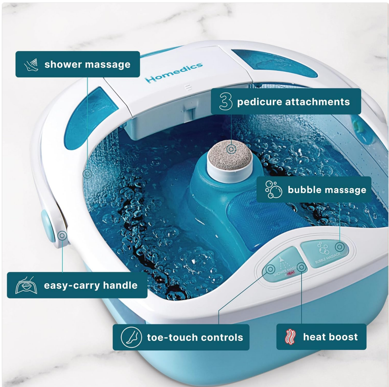
Image: An overhead view of the HoMedics Shower Bliss Foot Spa, highlighting its key features such as shower massage, pedicure attachments, bubble massage, easy-carry handle, toe-touch controls, and heat boost.