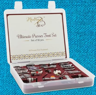
Durable hard plastic storage case