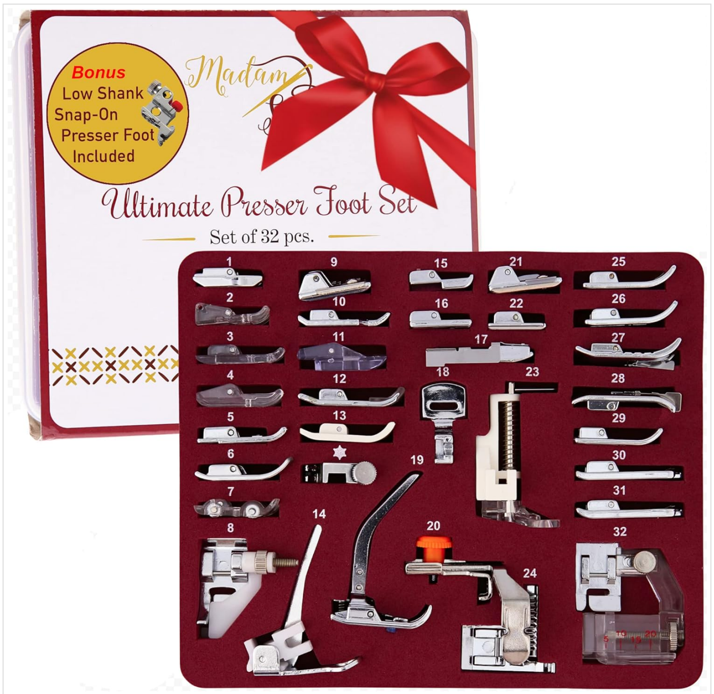
The Madam Sew 32 Piece Presser Foot Set includes 32 distinct presser feet, a low shank snap-on adapter, and a durable storage case with numbered slots for easy organization.