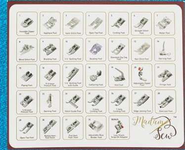
Numbered overview of all feet with names