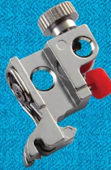
Bonus low shank snap-on adapter