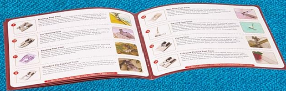
Full color printed manual with description of use of each presser foot and pictures of each foot in use