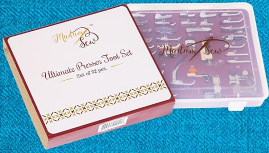
Smart looking packaging with handsome outer sleeve