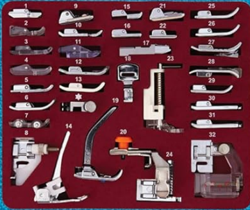
32 high quality presser feet, numbered custom fit slots, snug fit - won't fall out