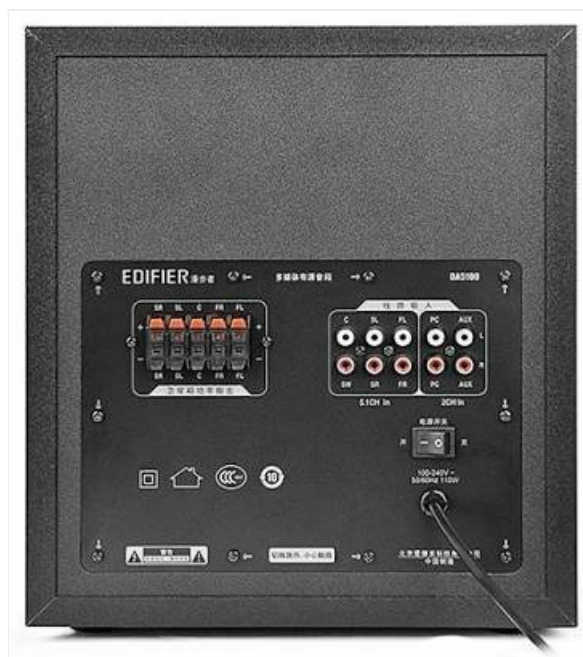
Figure 4: Rear panel of the subwoofer, detailing all audio input and speaker output connections.