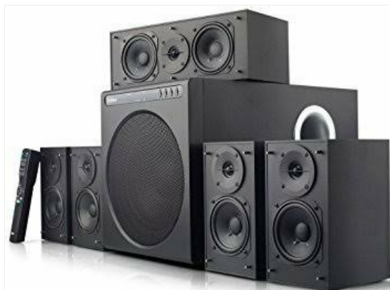
Figure 1: Overview of the Edifier DA5100 5.1 speaker system, showing the subwoofer, five satellite speakers, and remote control.