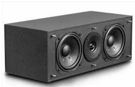
Figure 2: The center speaker, designed for clear dialogue reproduction.