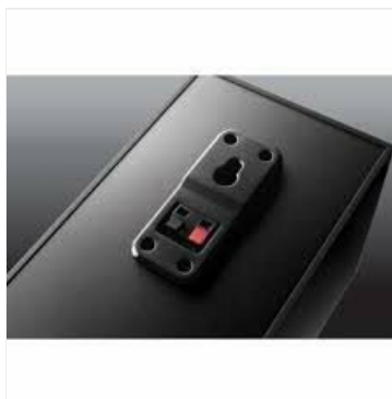
Figure 3: Speaker terminal on a satellite speaker, showing the red and black spring clips for wire connection.