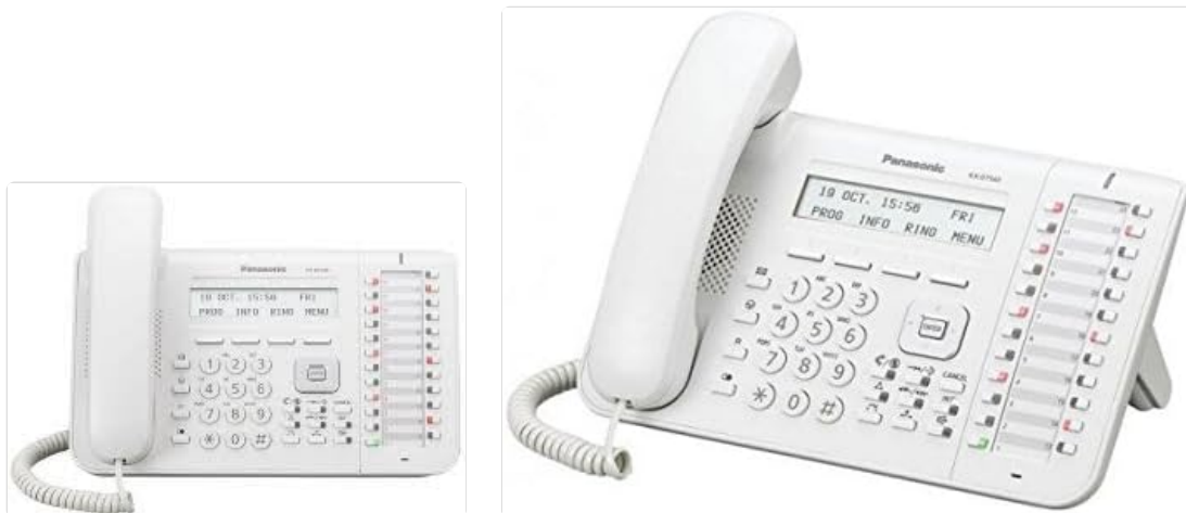
Image Description: Two images of the Panasonic KX-DT543x telephone. The first shows a direct front view, highlighting the display, keypad, and programmable buttons. The second image provides an angled perspective, showcasing the ergonomic design and the stand.

Additional views of the telephone are provided below: