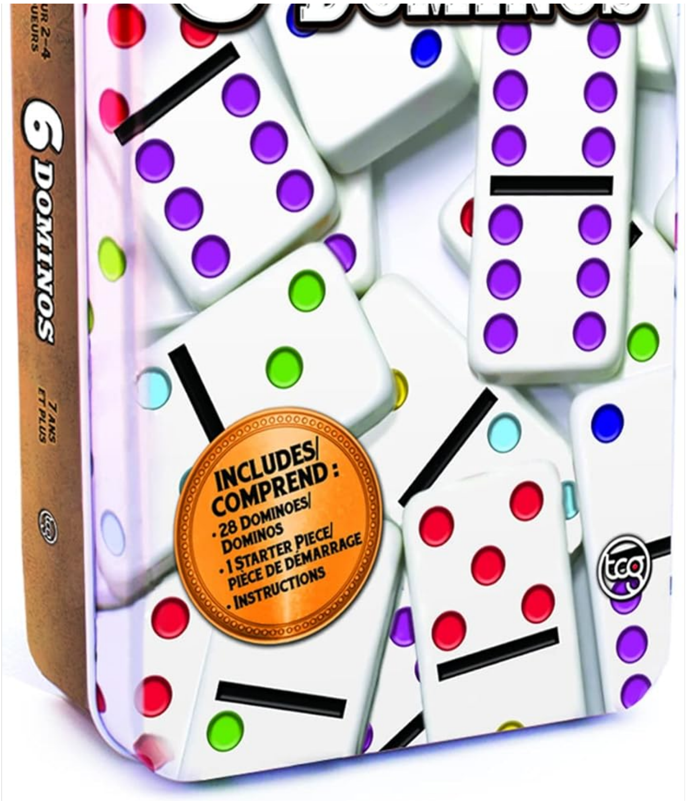
Image: The TCG Toys Double 6 Dominoes set, featuring the sturdy tin case and colorful dominoes.