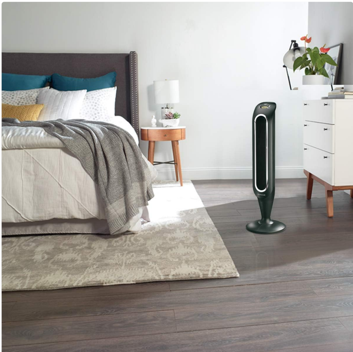
Figure 2: The tower fan positioned in a bedroom, demonstrating its compact footprint and ability to blend into living spaces.

For best performance, place the tower fan in a location where its oscillating action can effectively distribute air throughout the room. Avoid placing objects directly in front of the fan that could obstruct airflow. Placing the fan in a corner or near an open window can enhance air circulation and introduce fresh air into the space.