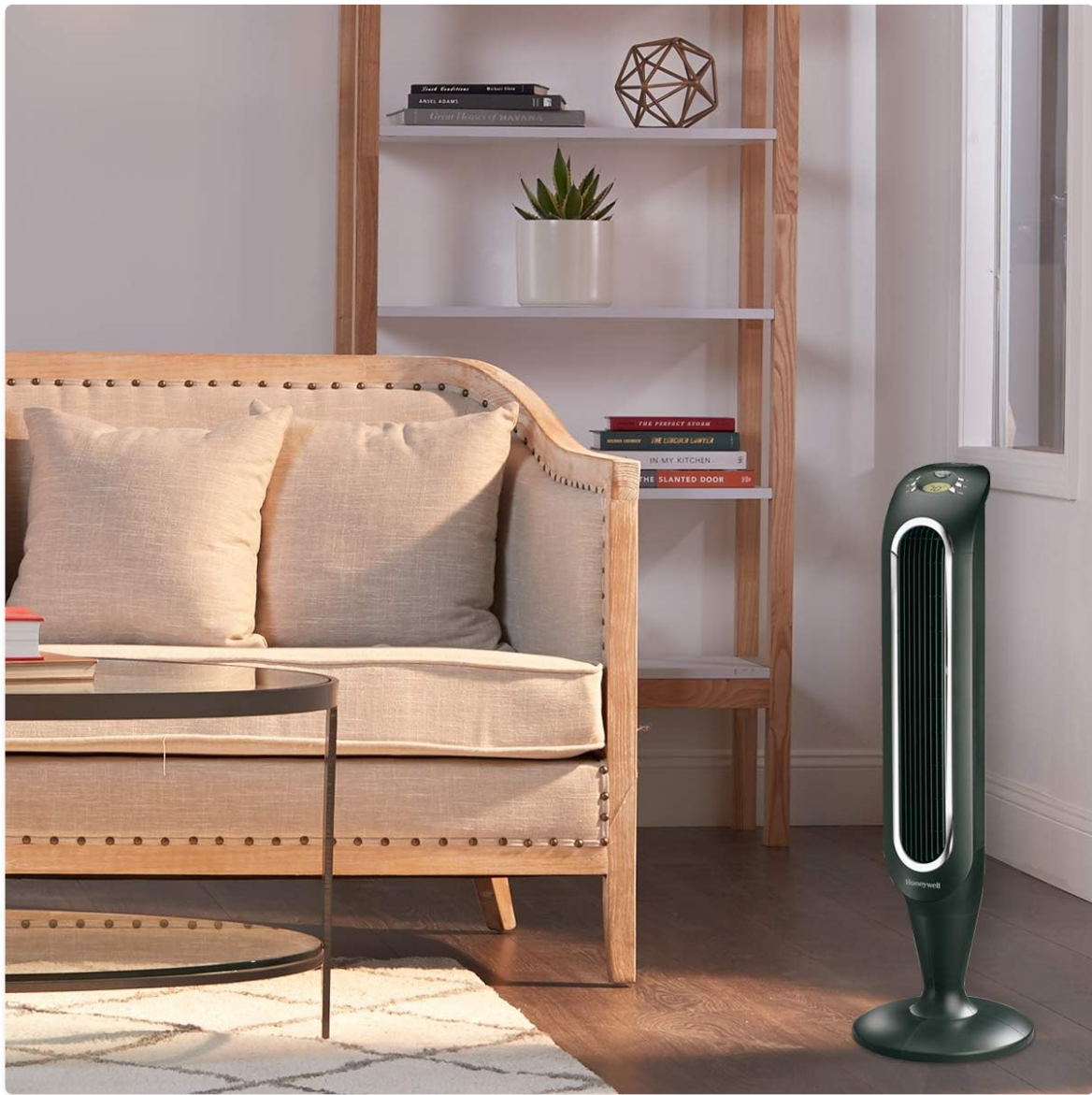
Figure 3: The tower fan placed in a living room, illustrating its versatility for different room types.