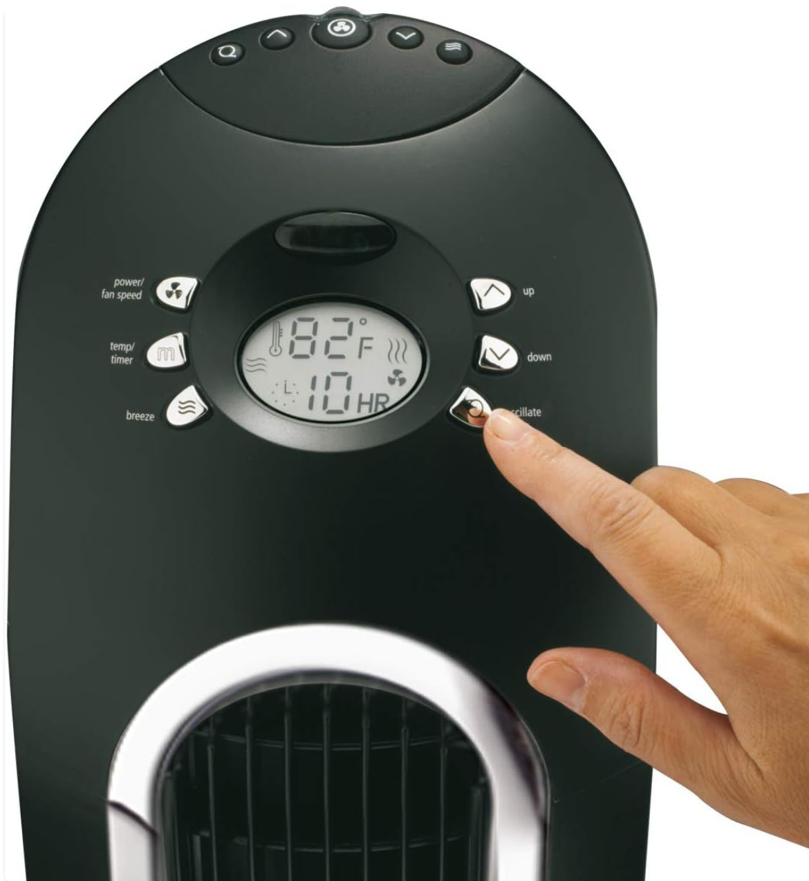
Figure 4: Detailed view of the fan's control panel, showing buttons for power, speed/mode, timer, and oscillation, along with the digital display.