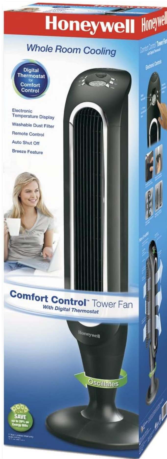
Figure 1: Honeywell HYF048 Fresh Breeze Tower Fan. This image displays the overall design of the black tower fan, highlighting its sleek profile and digital control panel.