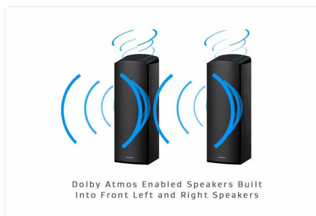
Image 3.1: Diagram illustrating the principle of Dolby Atmos enabled speakers, showing sound waves reflecting off the ceiling to create overhead audio effects.