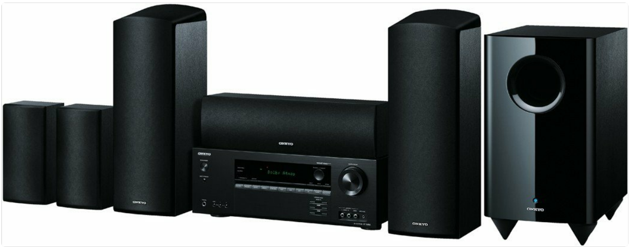
Image 2.1: Overview of the Onkyo HT-S5805 5.1.2-Channel Dolby Atmos Home Theater Package, including the receiver, subwoofer, and satellite speakers.