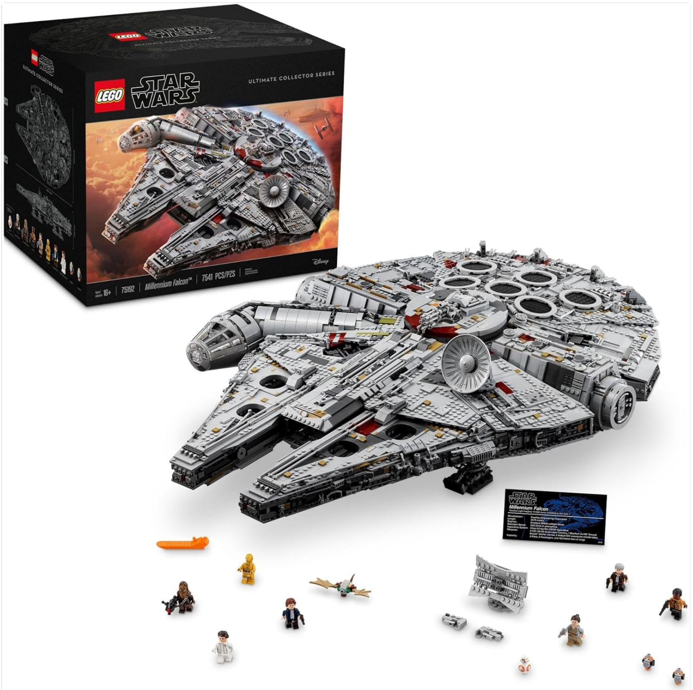
Image: The complete LEGO Star Wars Millennium Falcon set, including the main model, minifigures, and the product packaging.