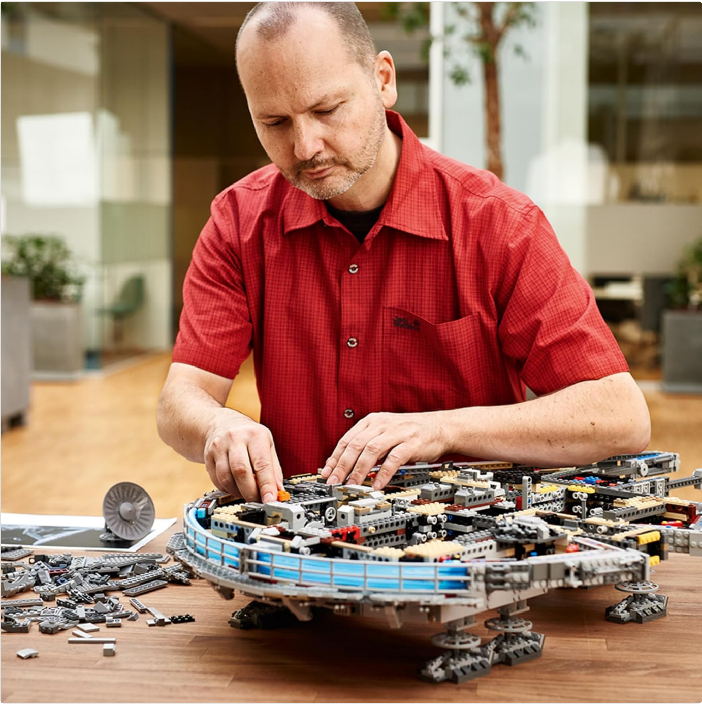
Image: A builder meticulously working on the large LEGO Millennium Falcon model, showcasing the scale and detail of the construction.

its classic trilogy configuration or its sequel trilogy appearance.