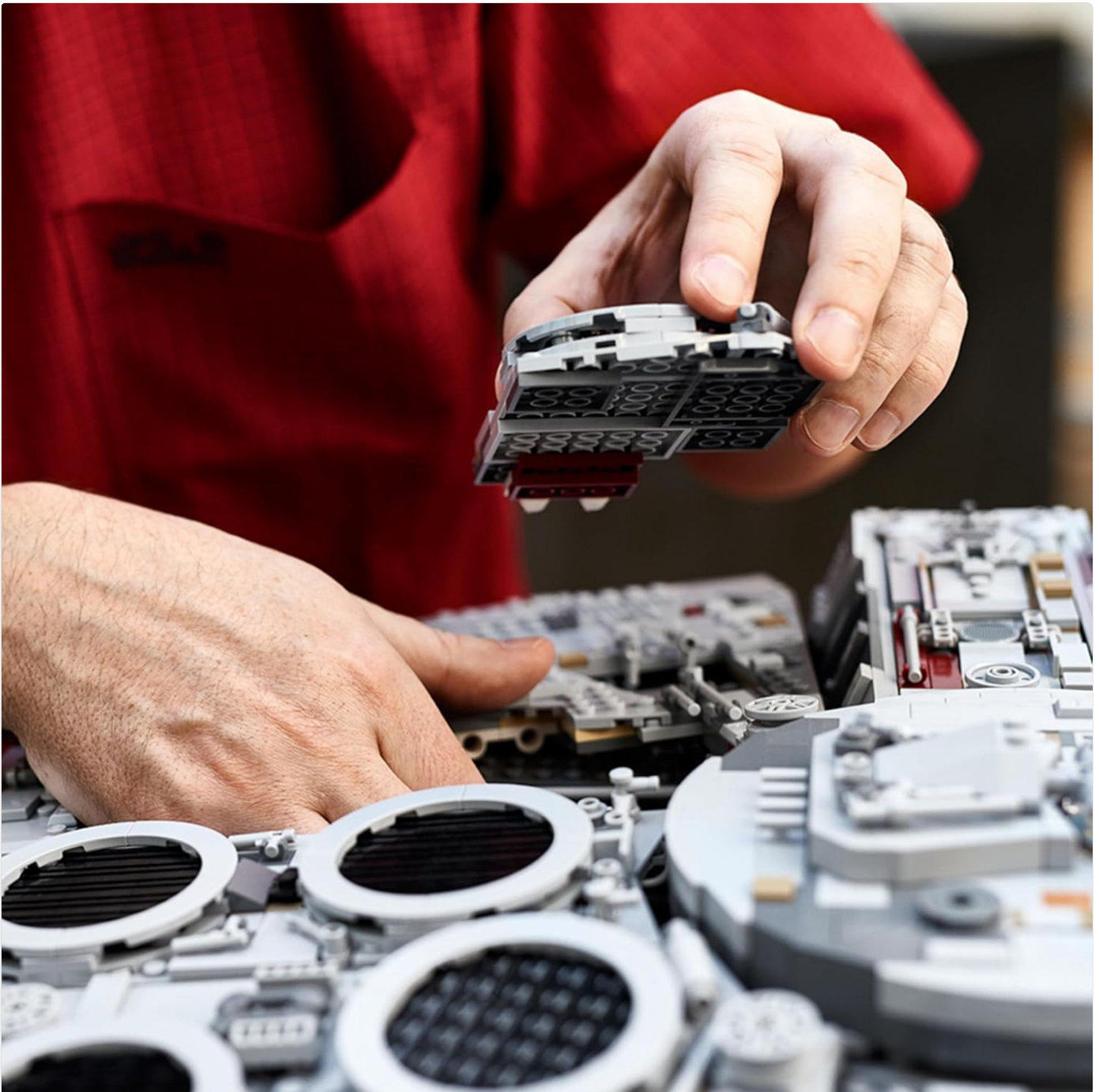
Image: Detailed view of hands placing LEGO bricks, illustrating the precision and intricate nature of the assembly process for the Millennium Falcon.