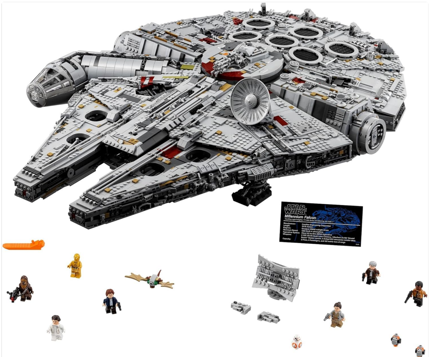
Image: The fully assembled LEGO Millennium Falcon, accompanied by its diverse cast of minifigures, ready for display.