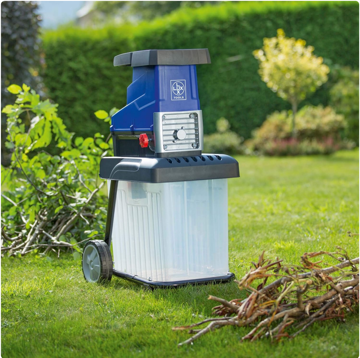
Image: The Lux-Tools E-LH-2800 Electric Shredder positioned in a garden, ready for use with a pile of branches nearby.