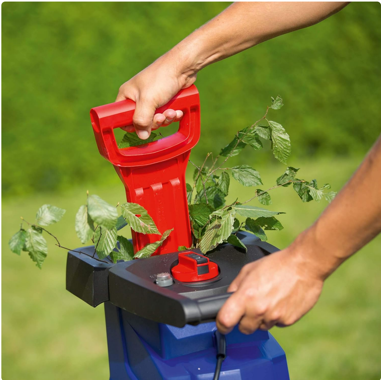
Image: A user safely feeding branches into the shredder's intake chute.