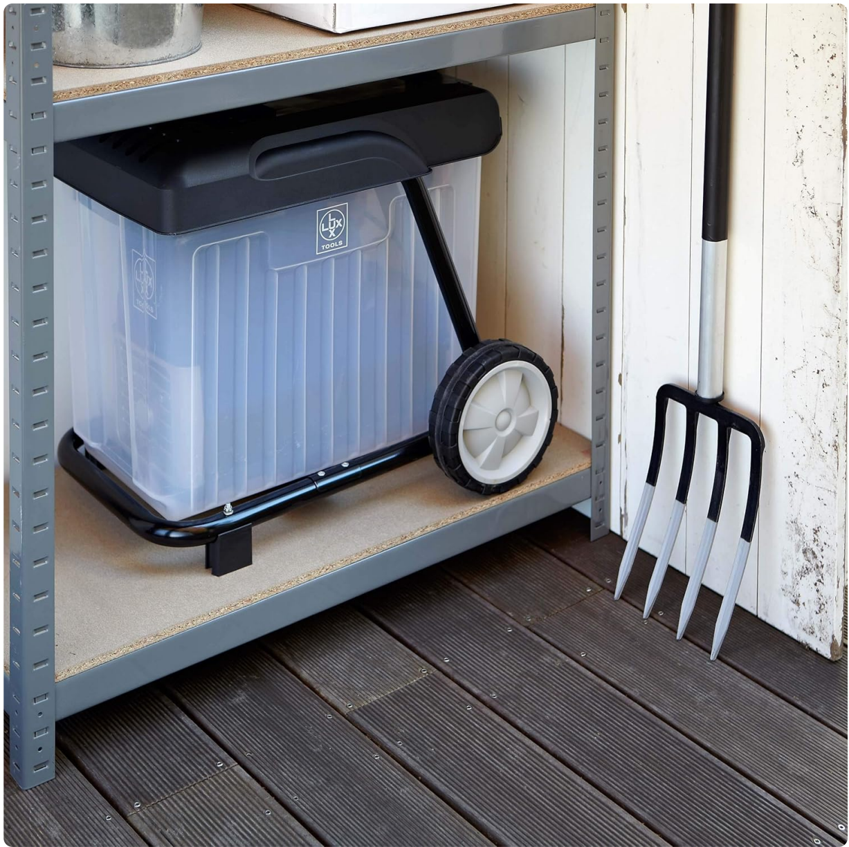
Image: The shredder with its 60-liter collection box attached, ready for use.