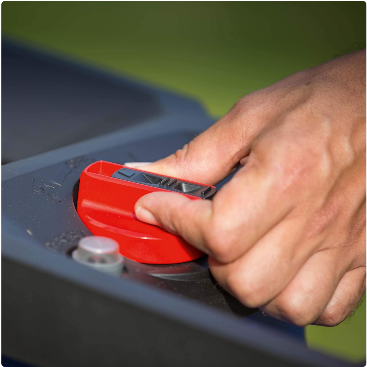
Image: The control panel with clearly marked ON/OFF buttons for easy operation.