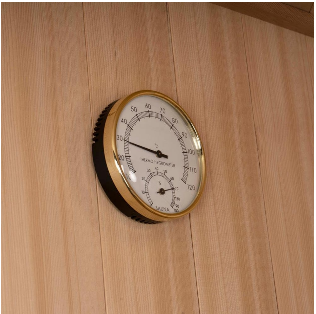
Image: A close-up view of the brass-rimmed thermo-hygrometer, displaying temperature in Celsius and Fahrenheit, and humidity percentage.