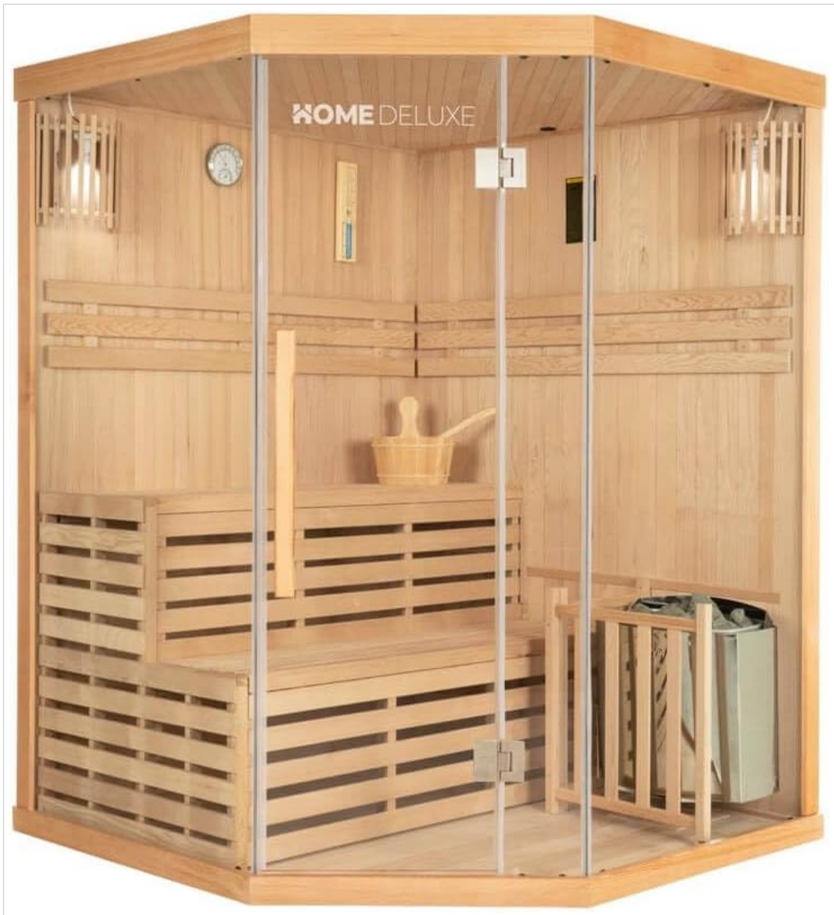
Image: A clear front view of the Home Deluxe SKYLINE XL sauna, highlighting its corner design, wooden interior, and transparent glass door.