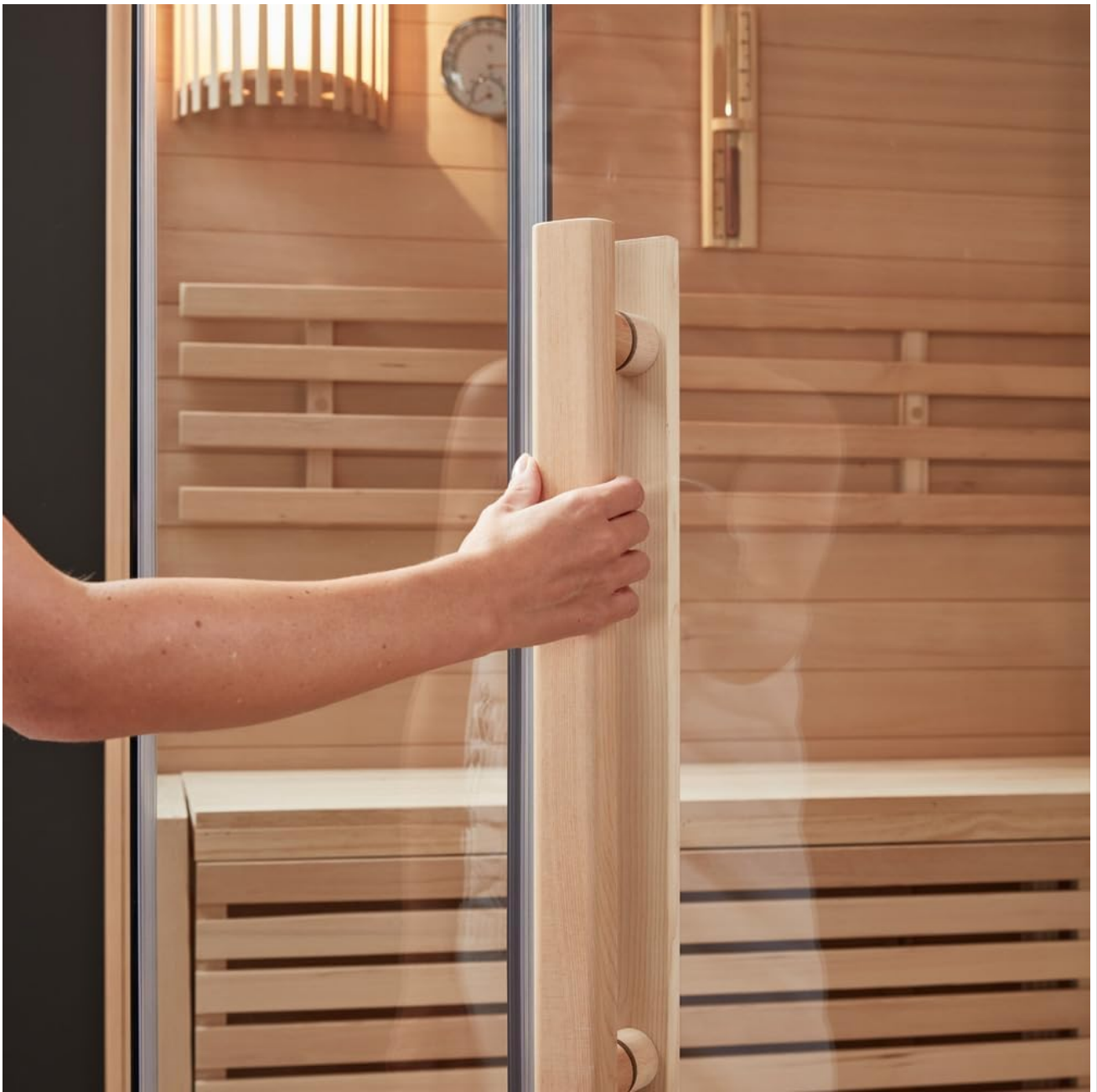
Image: A hand grasping the vertical wooden handle of the sauna's glass door, illustrating the ease of entry and exit.