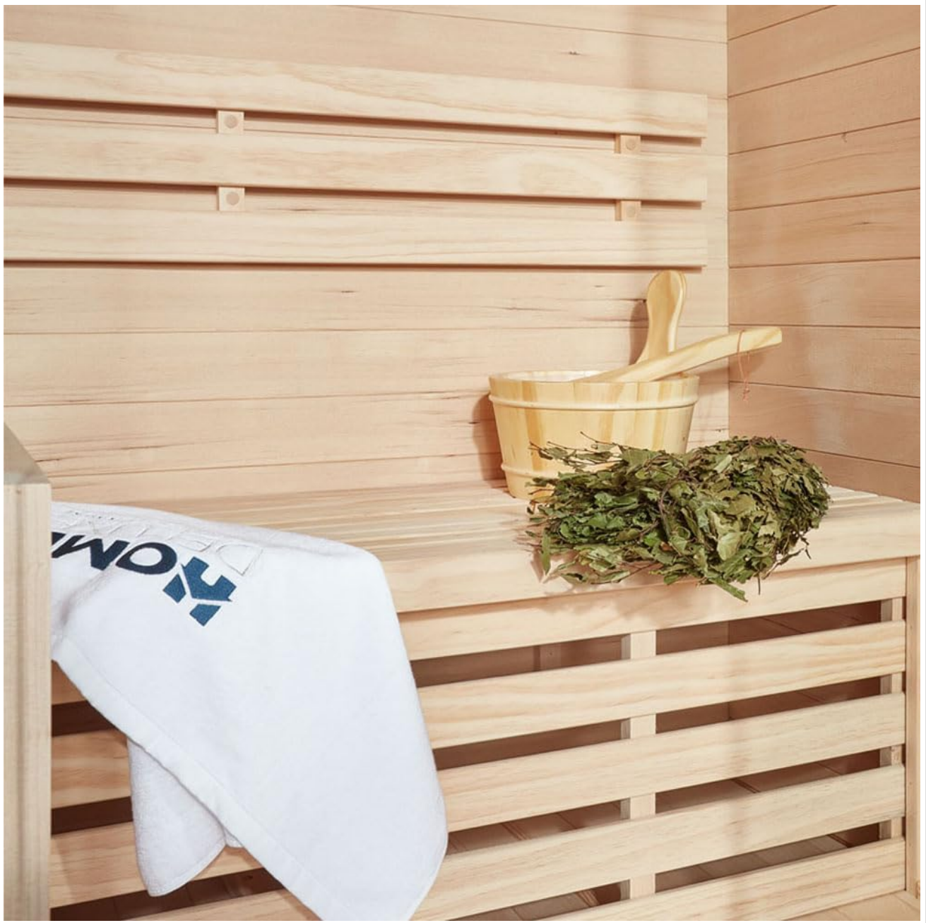
Image: The interior of the sauna, showing a wooden bench with a traditional sauna bucket, ladle, and a birch whisk, ready for use.