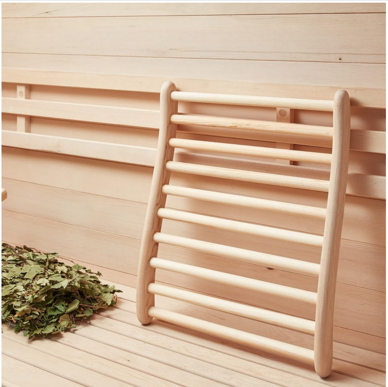
Image: A wooden sauna backrest leaning against the wall, next to a birch whisk, both resting on a sauna bench.