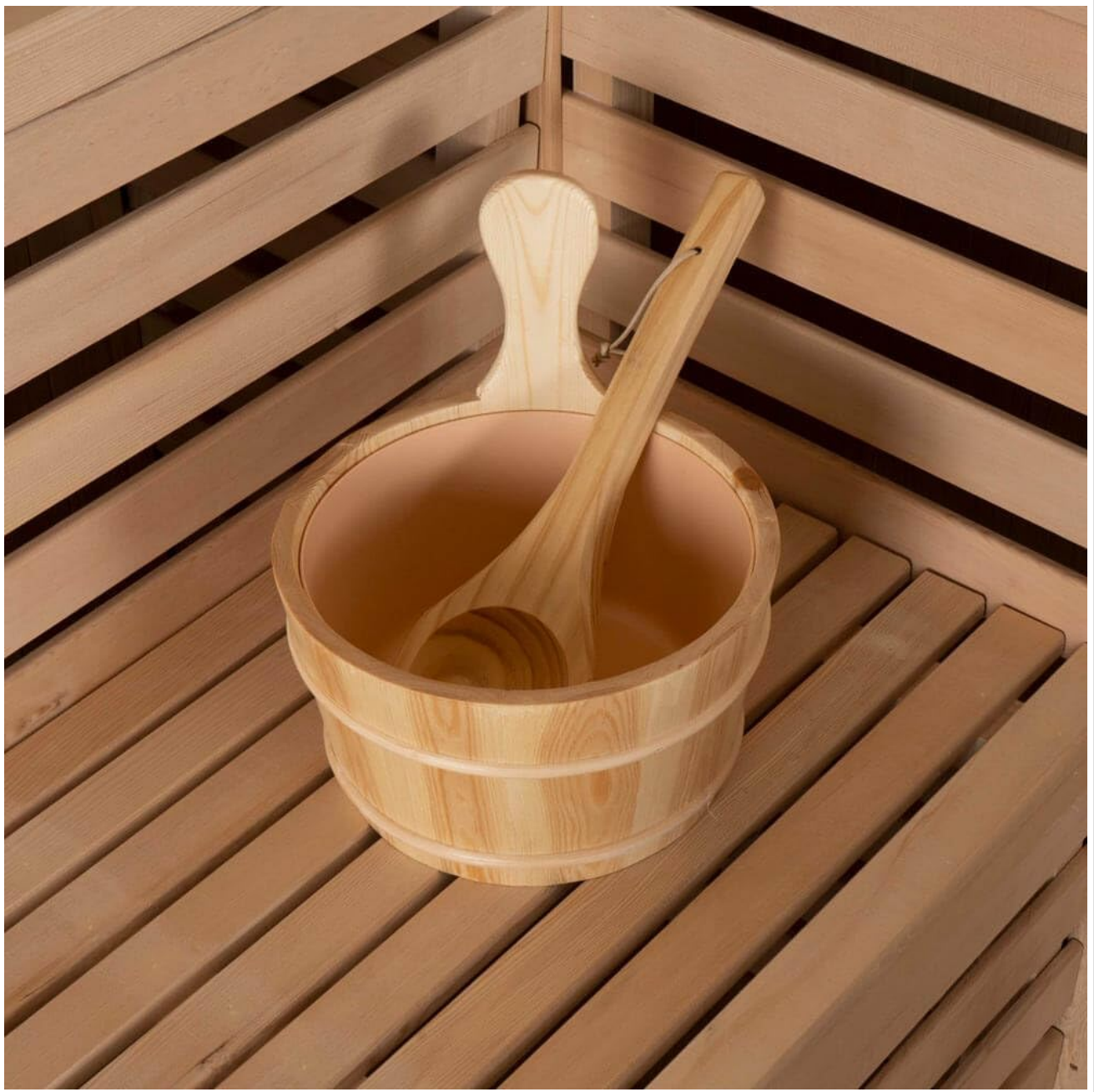
Image: A close-up of the wooden sauna bucket and ladle, essential accessories for creating steam by pouring water over hot sauna stones.