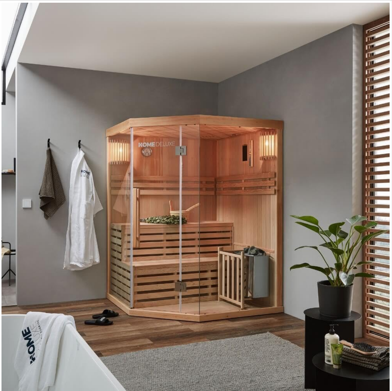
Image: The Home Deluxe SKYLINE XL sauna cabin integrated into a contemporary bathroom environment, showcasing its compact design and wooden interior.