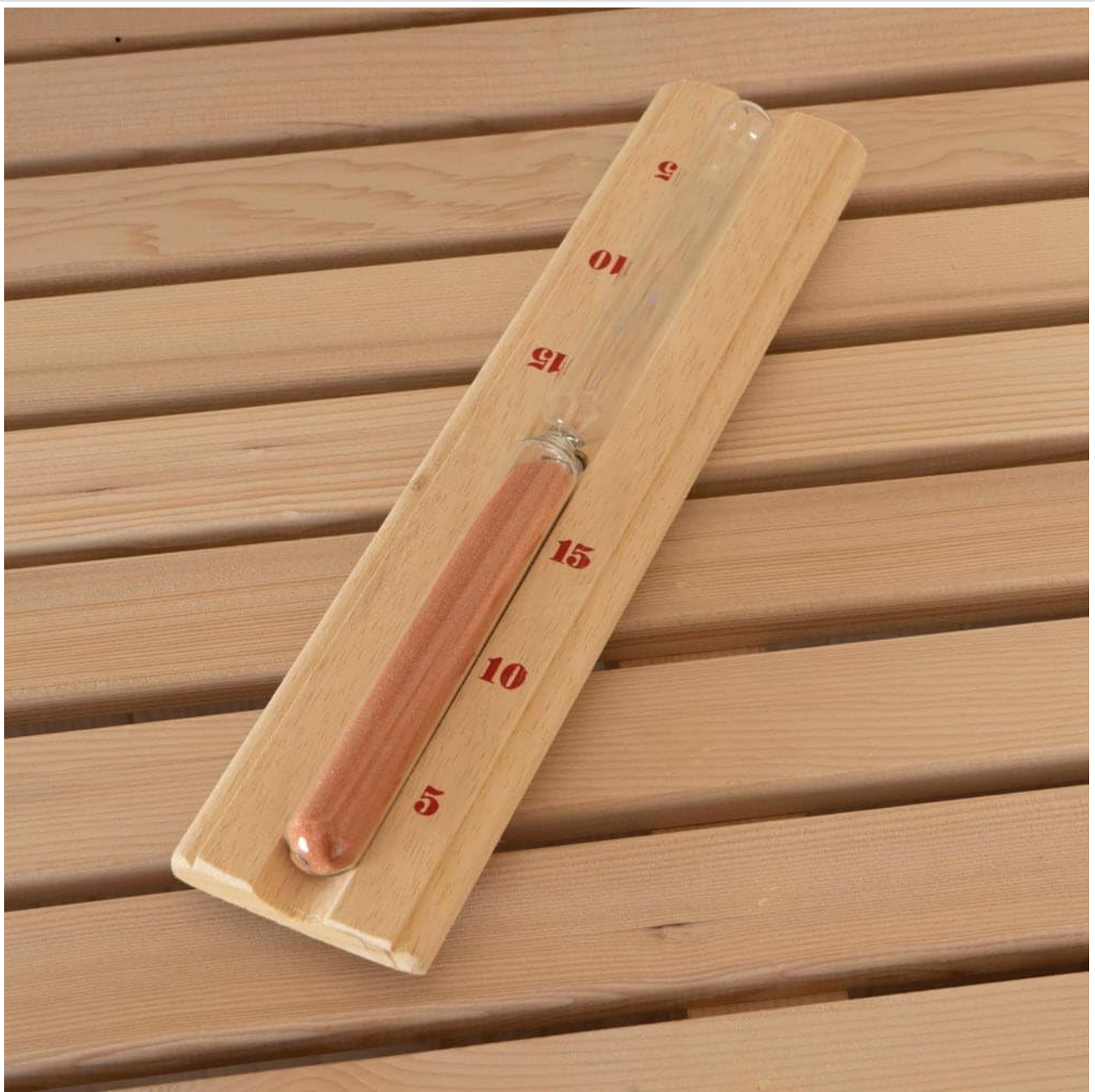
Image: A detailed shot of the wooden sand timer, used to track sauna session duration, with markings for 5, 10, and 15 minutes.