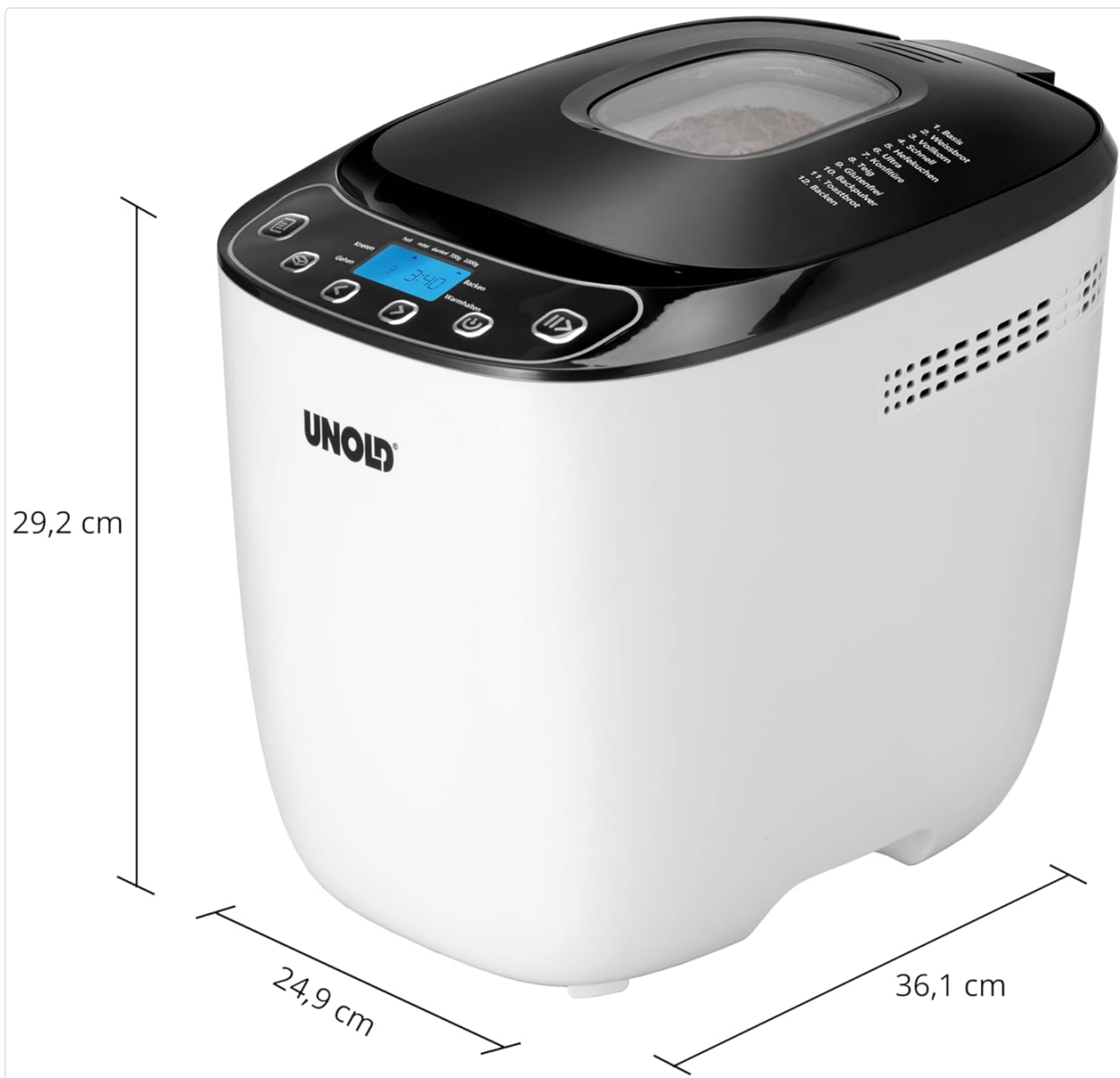
Image: Dimensional drawing of the Unold 68010 Bread Maker, indicating its height, width, and depth.