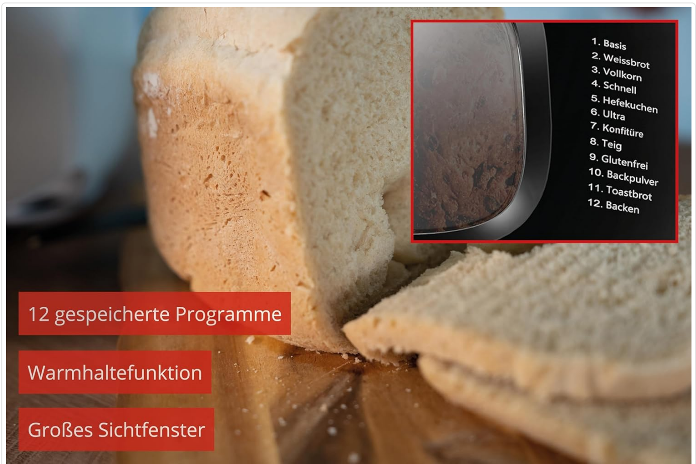
Image: A visual representation of the 12 available programs on the bread maker, including Basic, White Bread, Whole Wheat, and more, alongside a freshly baked loaf.