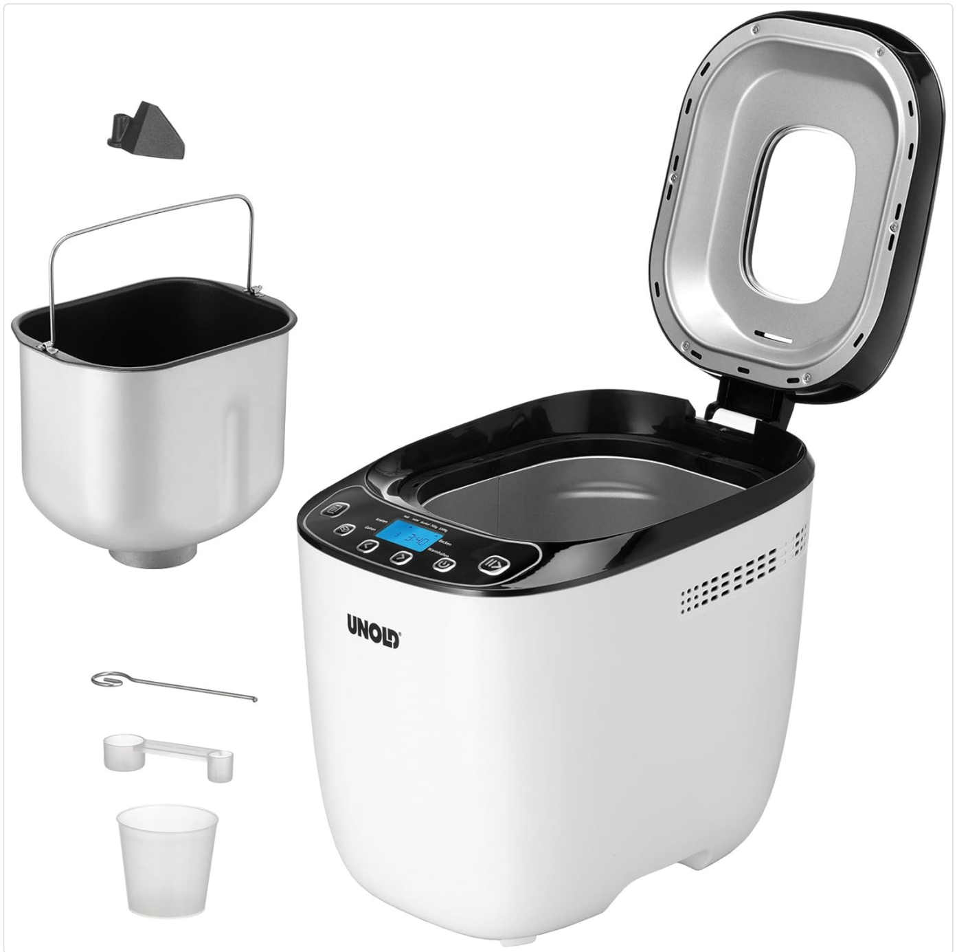
Image: The Unold 68010 Design Bread Maker shown with its baking pan, kneading paddle, measuring cup, measuring spoon, and hook, illustrating the included accessories.

Insert the kneading paddle onto the shaft at the bottom of the baking pan. Ensure it is securely in place. Then, insert the baking pan into the bread maker cavity and turn it slightly until it locks into position.