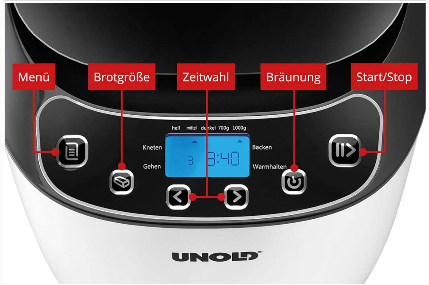
Image: A detailed view of the control panel, highlighting the 'Menu', 'Bread Size', 'Time Selection', 'Browning', and 'Start/Stop' buttons.

The bread maker features an easy-to-use backlit LCD display with soft-touch controls.