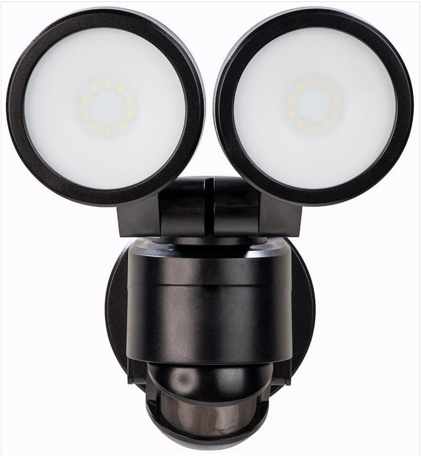
An image showing the Defiant DFI-5852-BK flood light. It features two round LED lamp heads mounted on an adjustable arm, with a motion sensor unit positioned below them. The light is black in color.