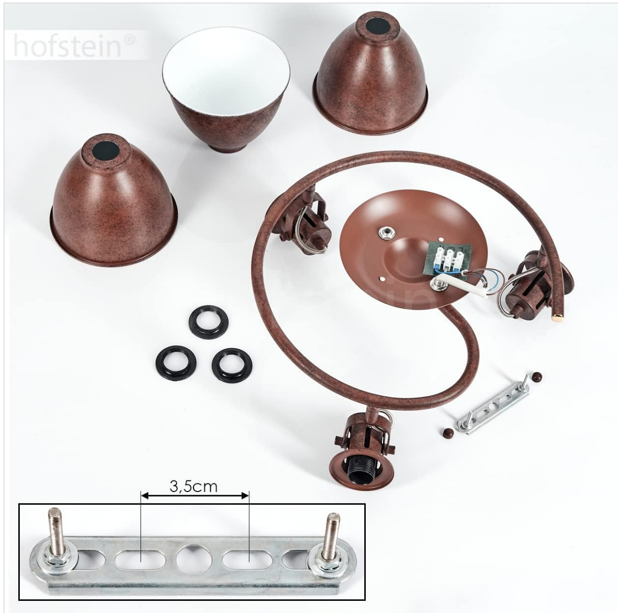
Image: Exploded view of the ceiling spotlight components, showing the main fixture, individual shades, mounting bracket, and electrical connectors.