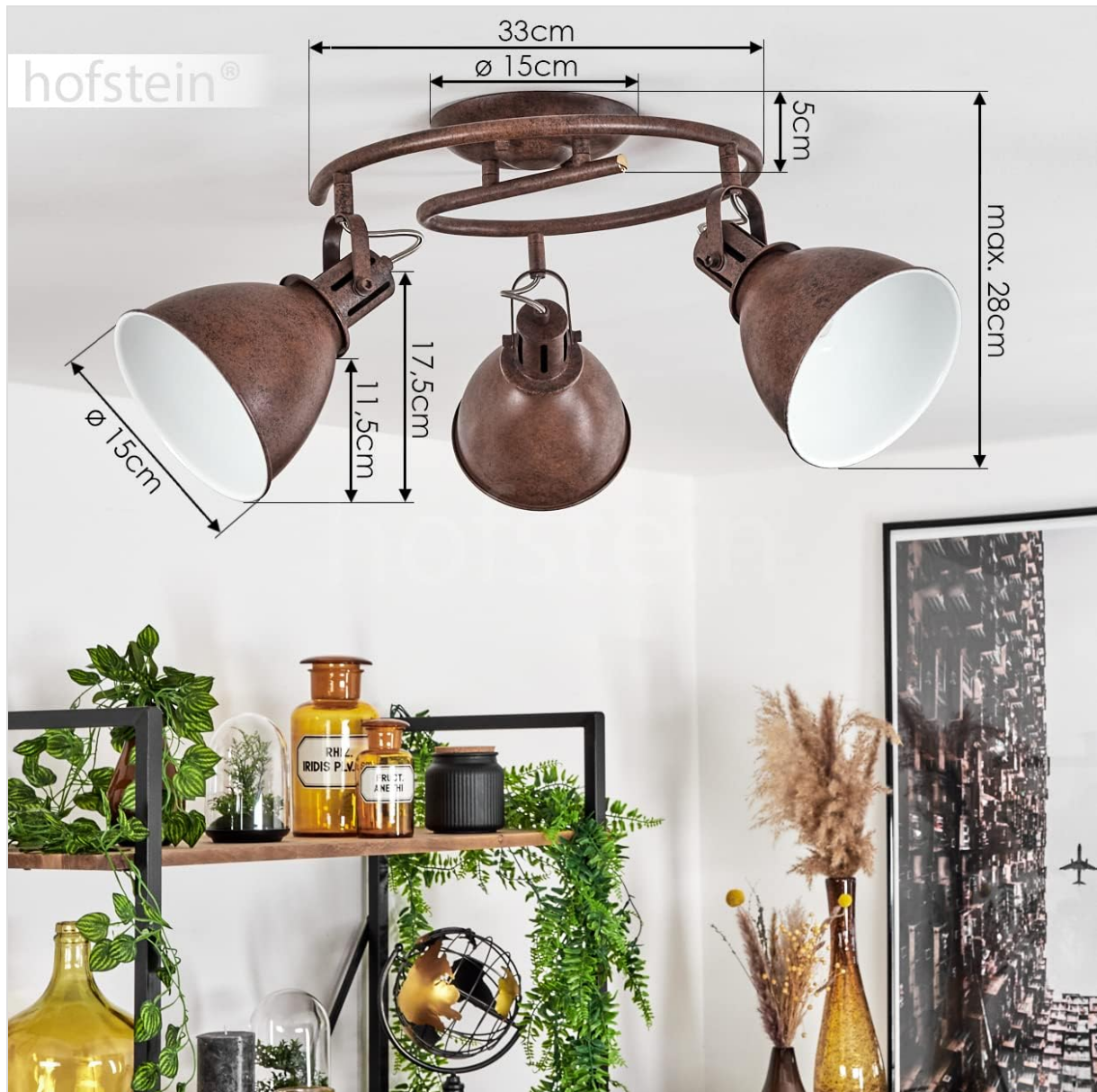
Image: Product dimensions for planning installation space.

9. Restore Power: Once installation is complete and all connections are secure, restore power at the circuit breaker.