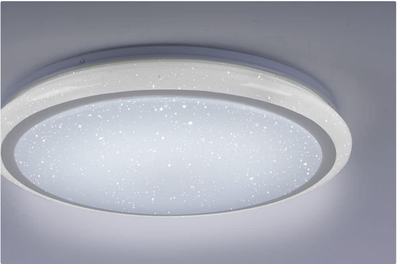
Figure 2: Side view of the LeuchtenDirekt LED Ceiling Light, showing its slim profile and the starry effect on the diffuser. This view highlights the depth of the fixture.