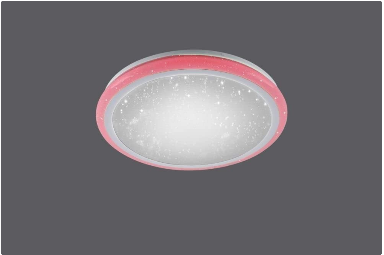
Figure 3: The ceiling light illuminated with a red ambient glow, demonstrating the RGB color changing capability.