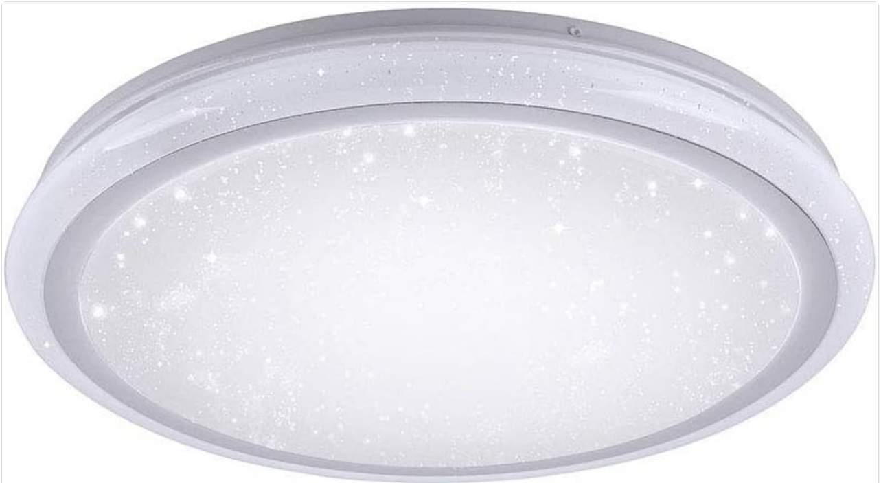
Figure 1: Front view of the LeuchtenDirekt LED Ceiling Light. This image shows the circular light fixture with a white frame and a starry sky effect on the diffuser.

This manual provides detailed instructions for the installation, operation, and maintenance of your LeuchtenDirekt LED Ceiling Light. Please read this manual carefully before installation and retain it for future reference.