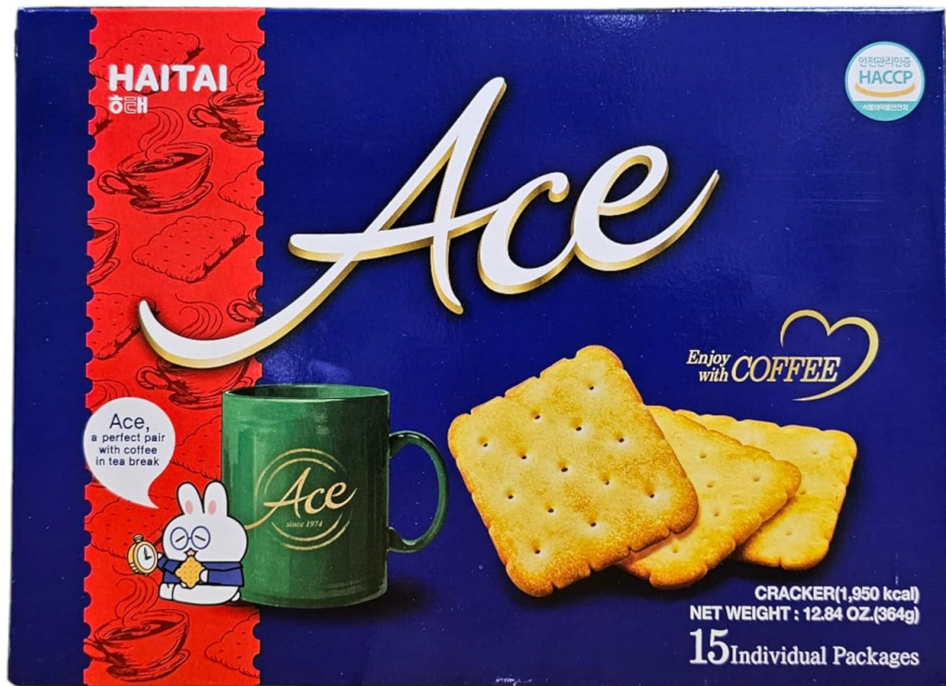
Image 1: Haitai Ace Cracker product packaging. The blue box features the 'Ace' logo, 'Enjoy with Coffee' text, and an illustration of crackers next to a coffee mug. The package indicates '15 Individual Packages' and a net weight of 12.84 oz (364g).